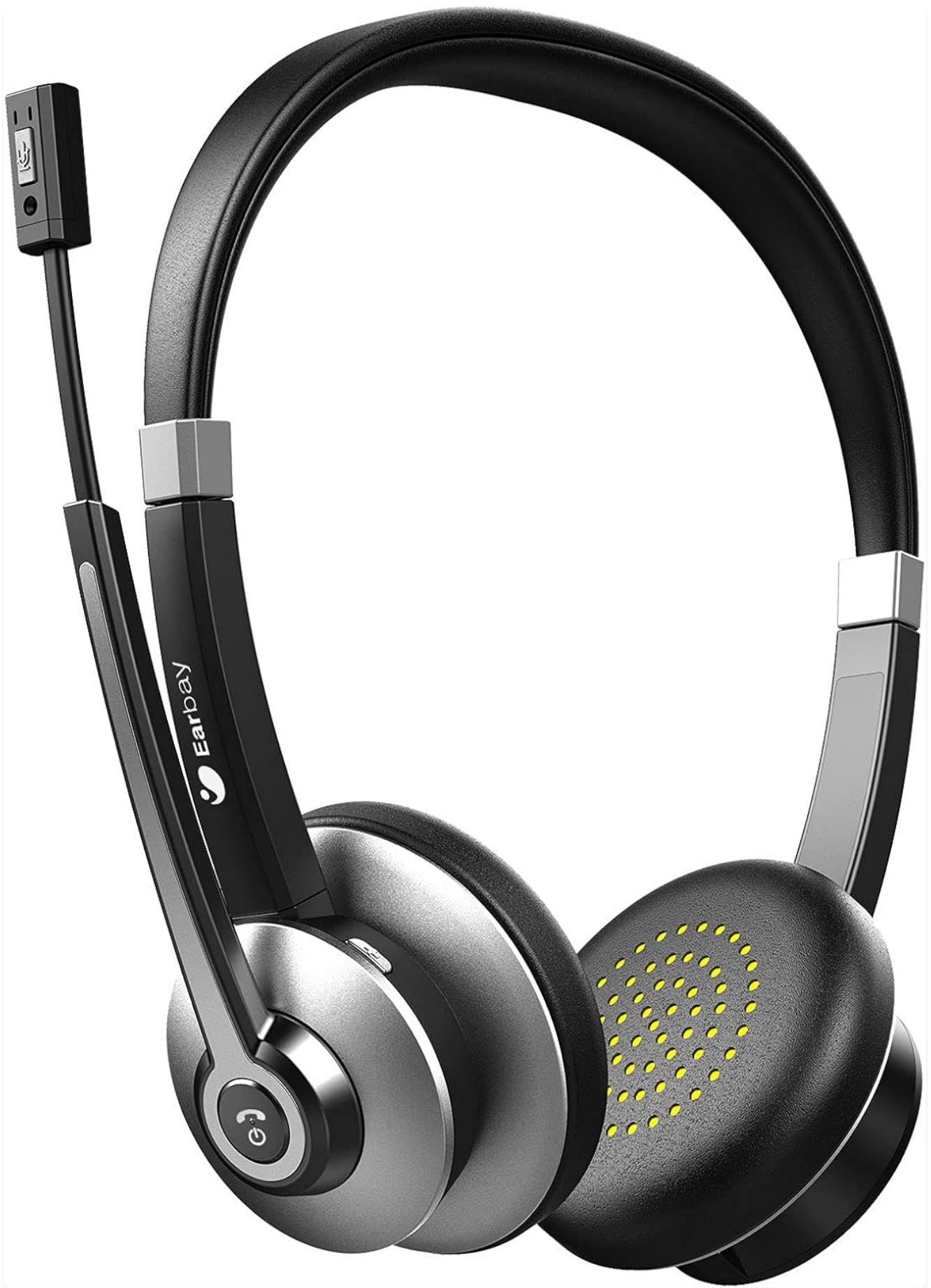
Figure 1: Earbay BT688SS-JL Bluetooth Headset. This image shows the full headset with its adjustable headband and microphone boom.