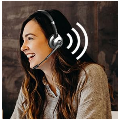
Figure 8: Clear Call Quality. A woman is shown smiling while using the headset, with sound waves emanating from the microphone, indicating clear audio transmission.

positioned close to your mouth for the best noise-cancelling performance.