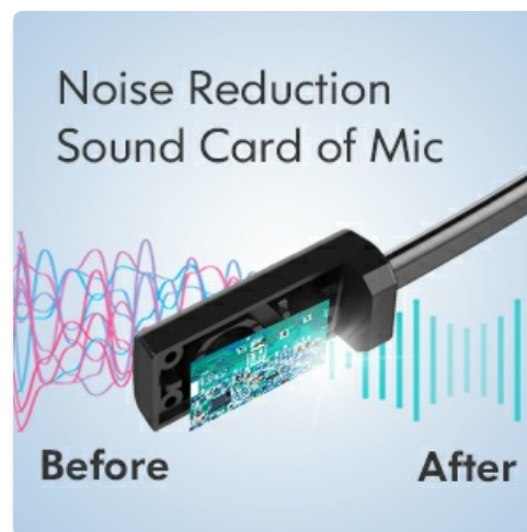
Figure 9: Noise Reduction Technology. A diagram illustrating the noise reduction sound card within the microphone, showing the before and after effect on sound waves.