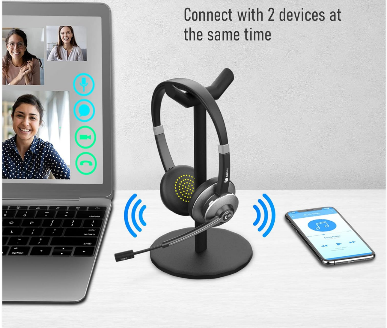
Figure 3: Dual Connection. The headset is depicted on a stand, wirelessly connected to both a laptop and a smartphone, demonstrating its ability to connect to two devices concurrently.