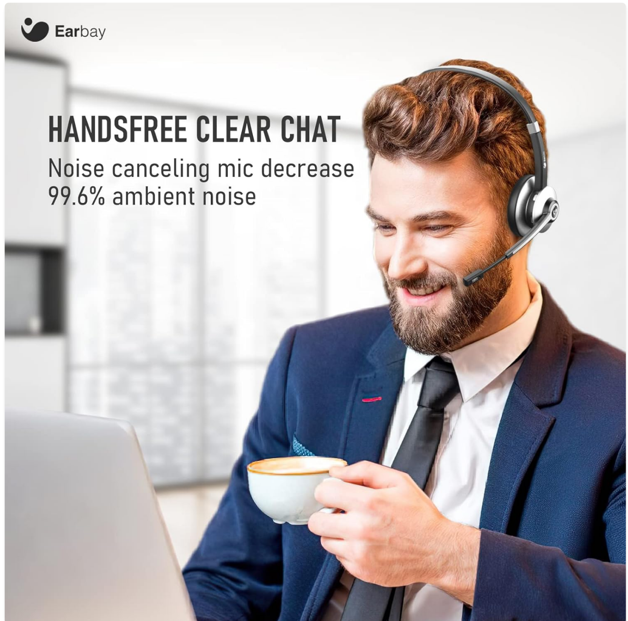
Figure 2: Handsfree Clear Chat. A man is shown using the headset while working on a laptop, illustrating the clear communication feature.