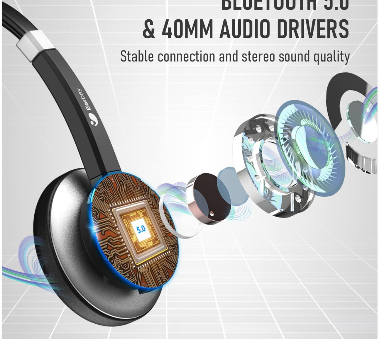
Figure 5: Bluetooth 5.0 & 40mm Audio Drivers. An exploded view diagram illustrates the internal components, including the Bluetooth 5.0 chip and 40mm audio drivers, indicating stable connection and quality sound.

Stable connection and stereo sound quality