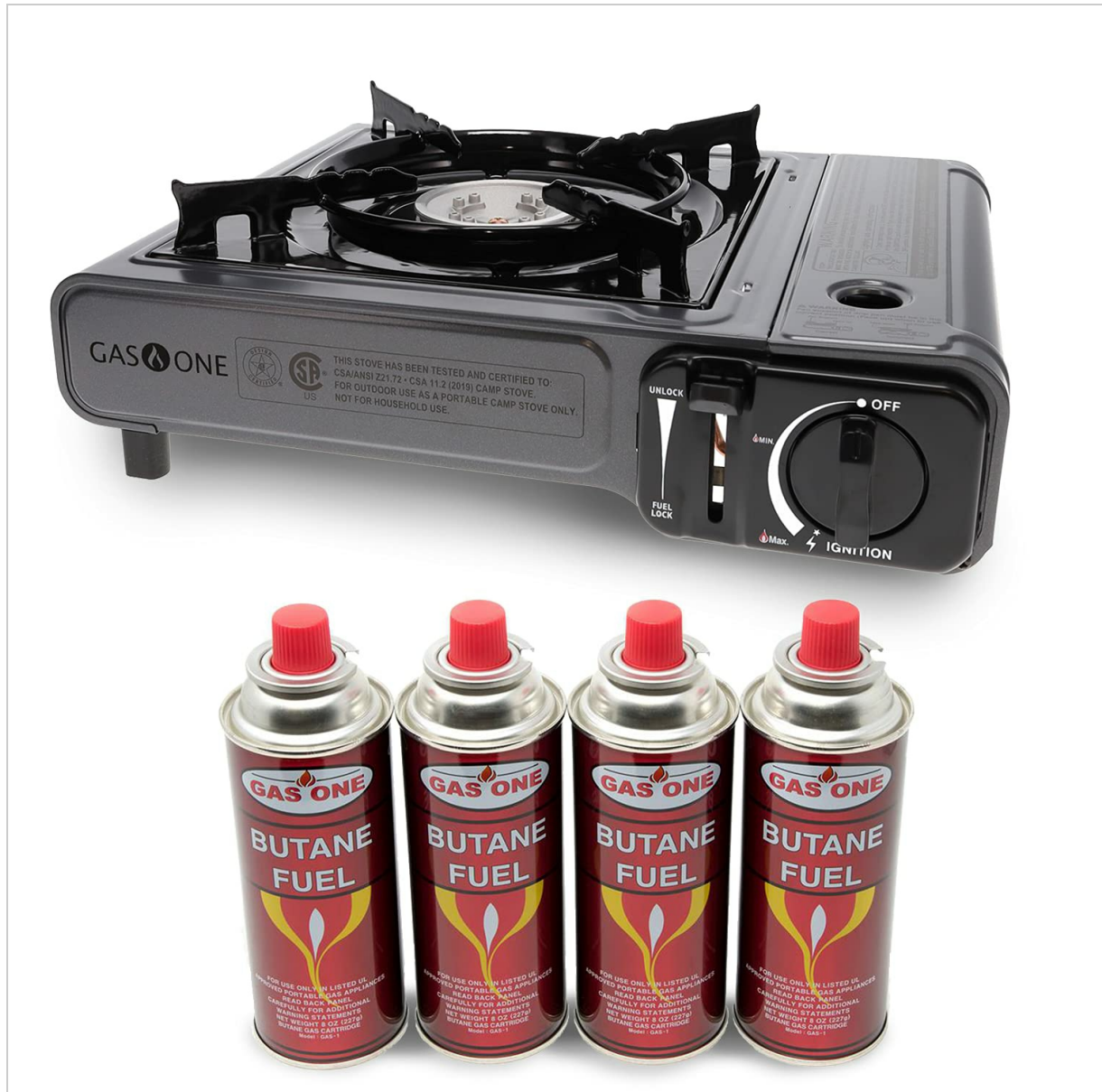
Figure 1: Gas One Portable Butane Gas Stove with included butane fuel canisters.

The Gas One Portable Butane Gas Stove is a compact and efficient cooking solution. Key features include a high-output burner, adjustable heat control, and an automatic piezo-electric ignition system.