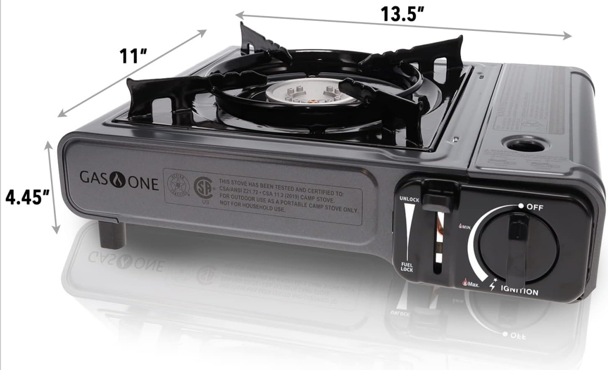
Figure 4: Product dimensions and weight.

DIMENSIONS: 13.5" x 11" x 4.45" WEIGHT: 3.1 LBS