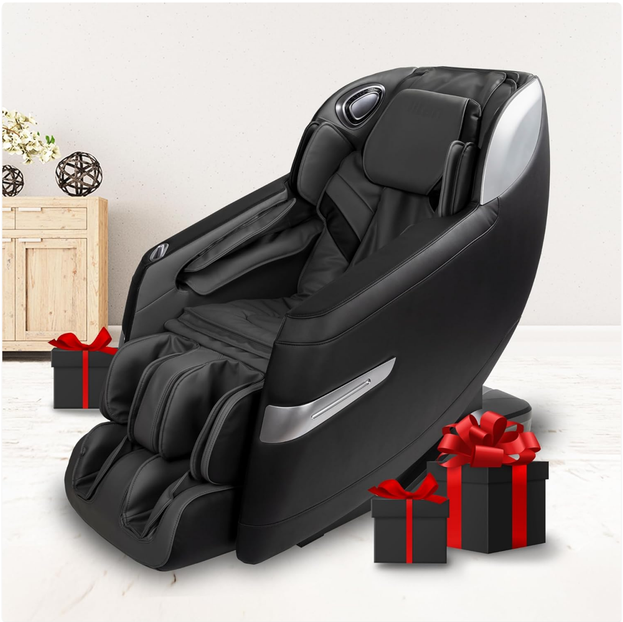
Figure 1: The Osaki Titan Quantum Massage Chair in Black.