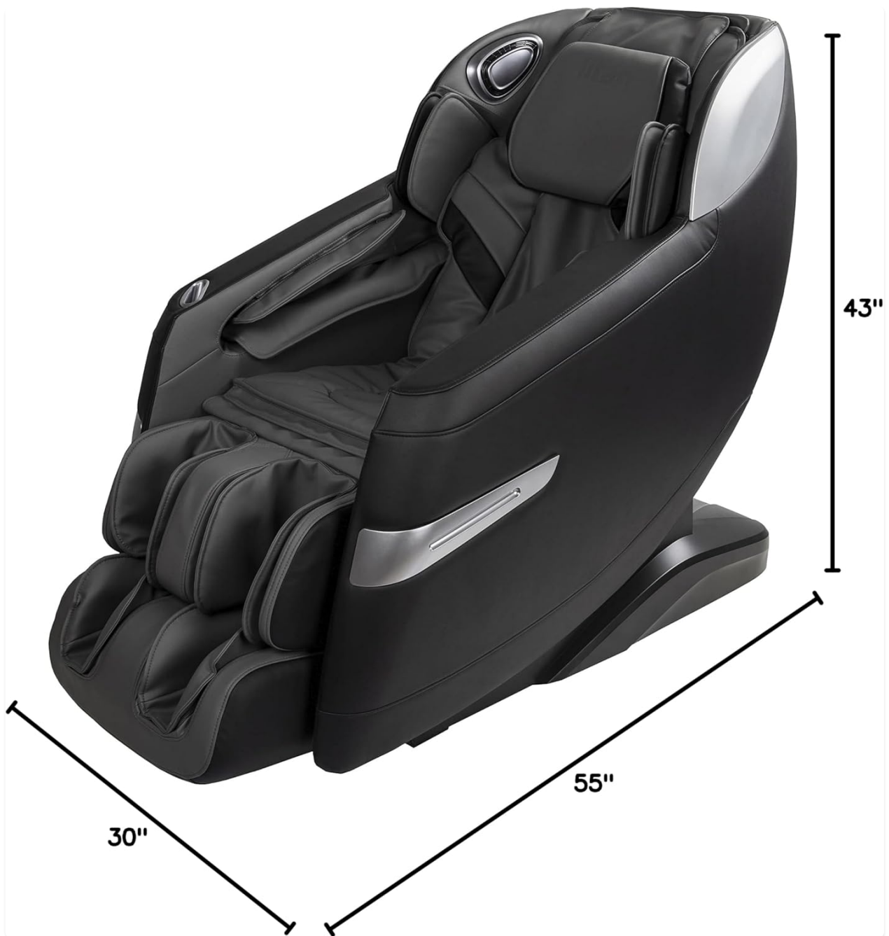
Figure 6: Product dimensions of the Osaki Titan Quantum Massage Chair.