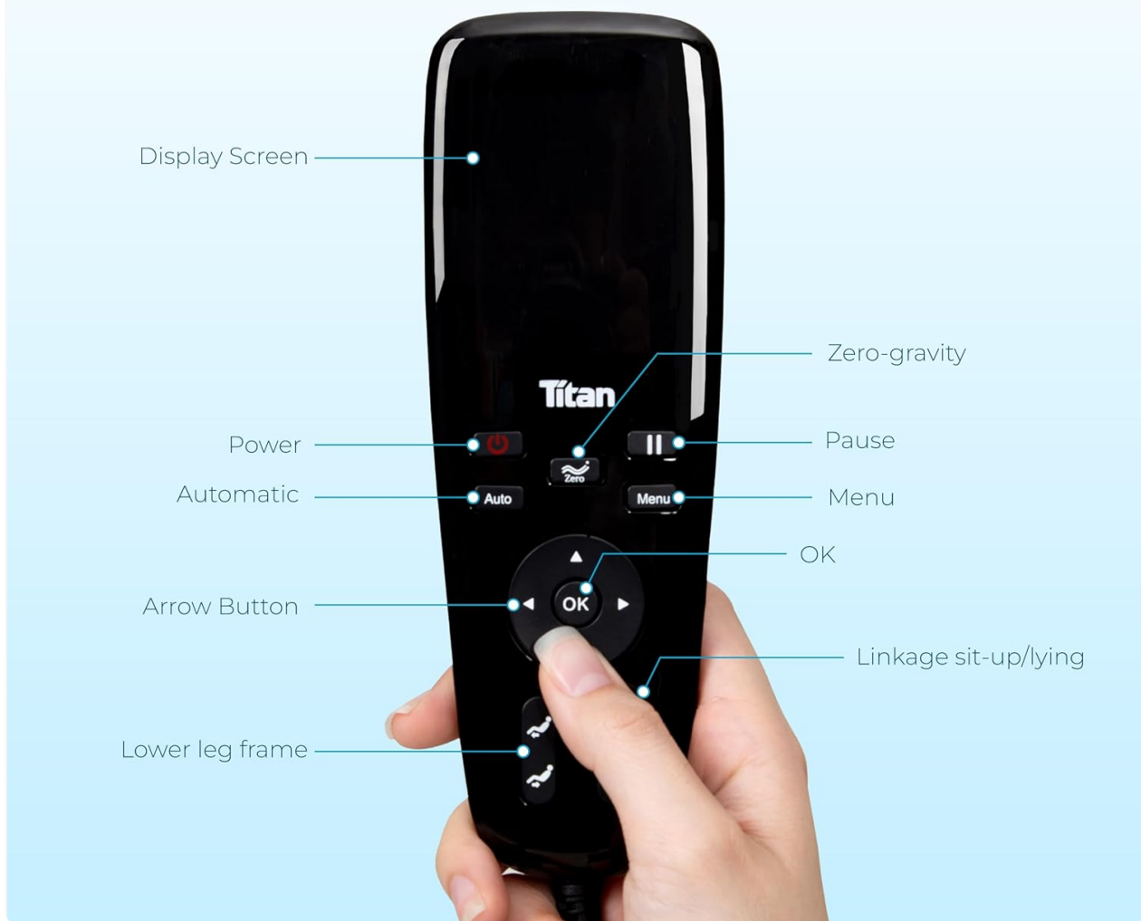
Figure 3: The remote control for the Osaki Titan Quantum Massage Chair.