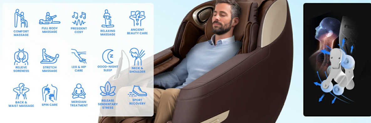
Figure 4: The 3D SL-Track roller system provides comprehensive massage coverage.