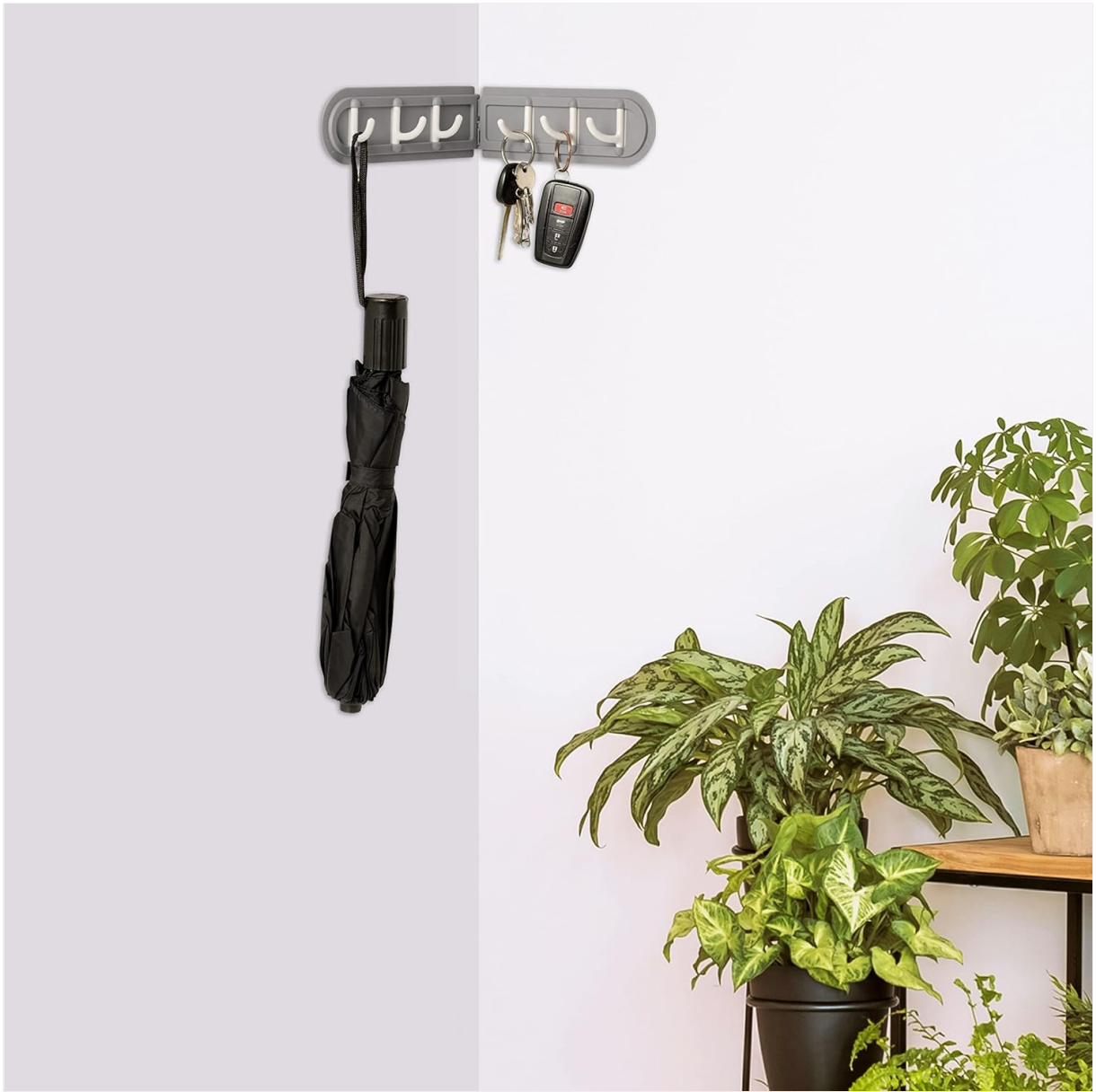
Image: The Jobar Foldable Corner Hangers mounted in a room corner, demonstrating its use for an umbrella next to a potted plant.