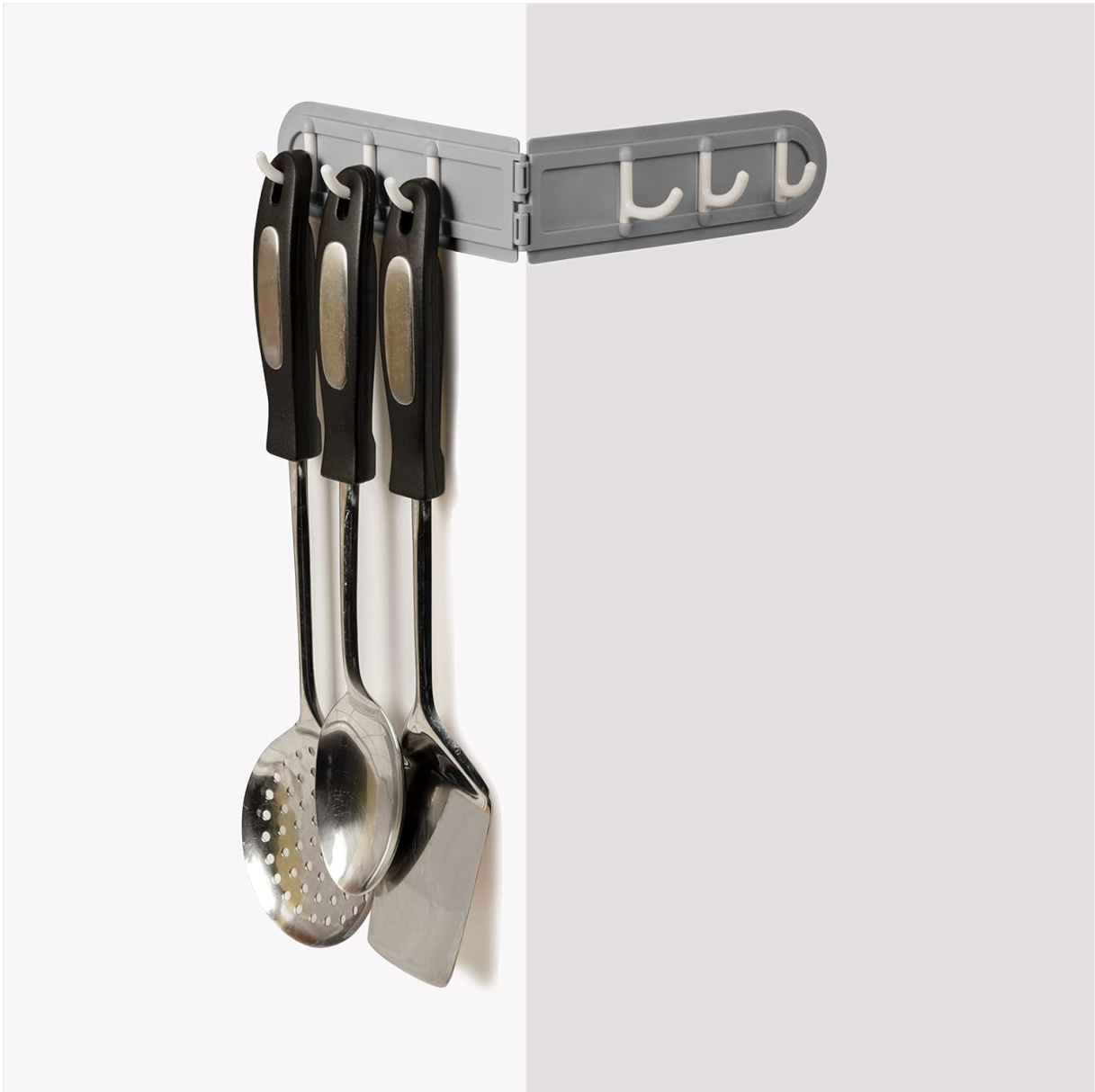
Image: The Jobar Foldable Corner Hangers used in a kitchen setting, holding various cooking utensils.