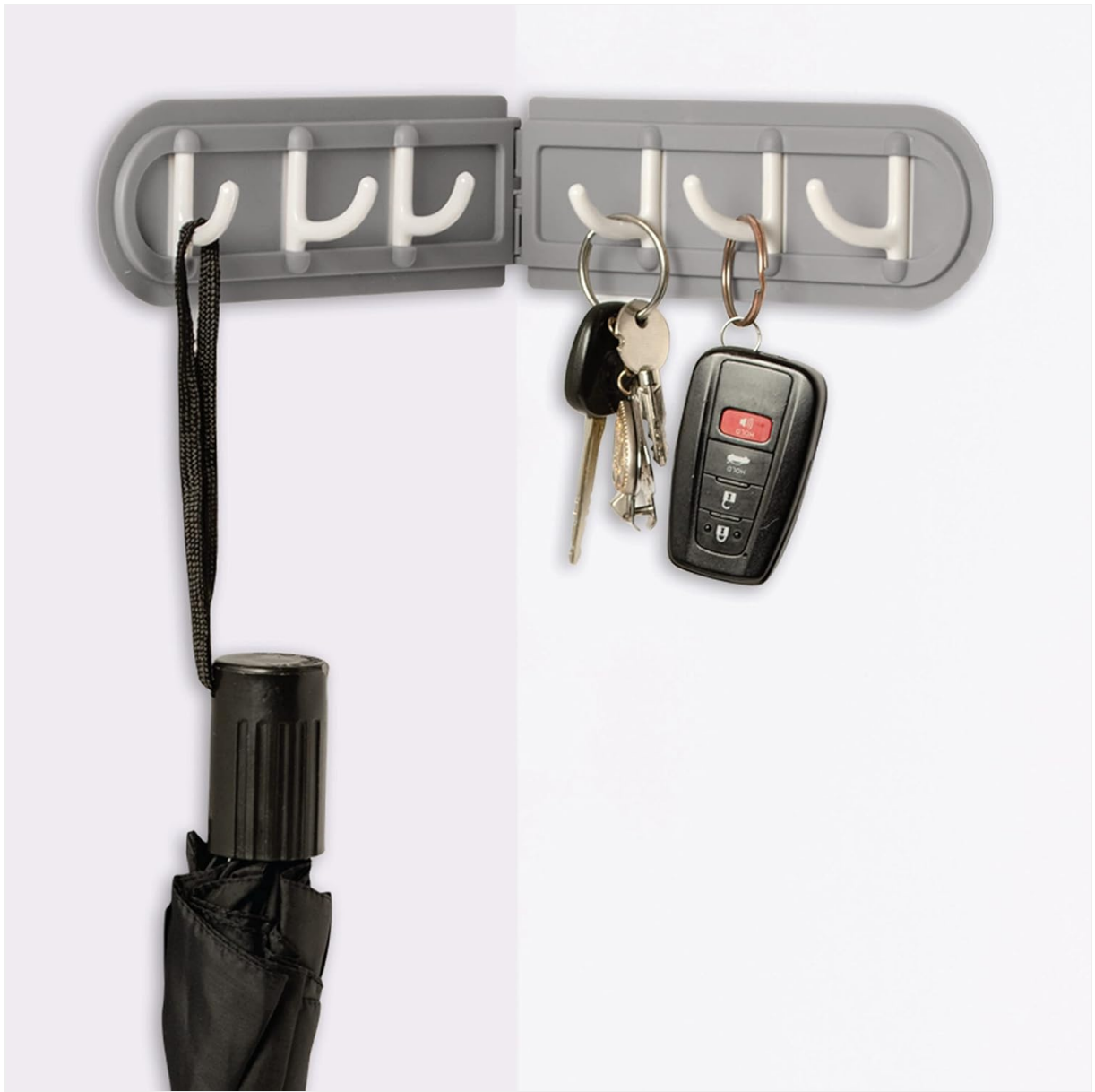
Image: The Jobar Foldable Corner Hangers installed in a corner, holding a set of keys and a folded umbrella.