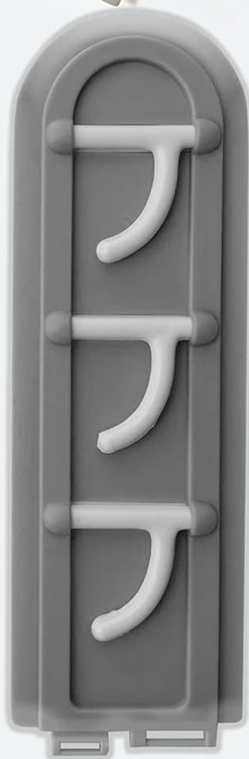
Dimensions: 14.57" x 2.24" x 0.29"