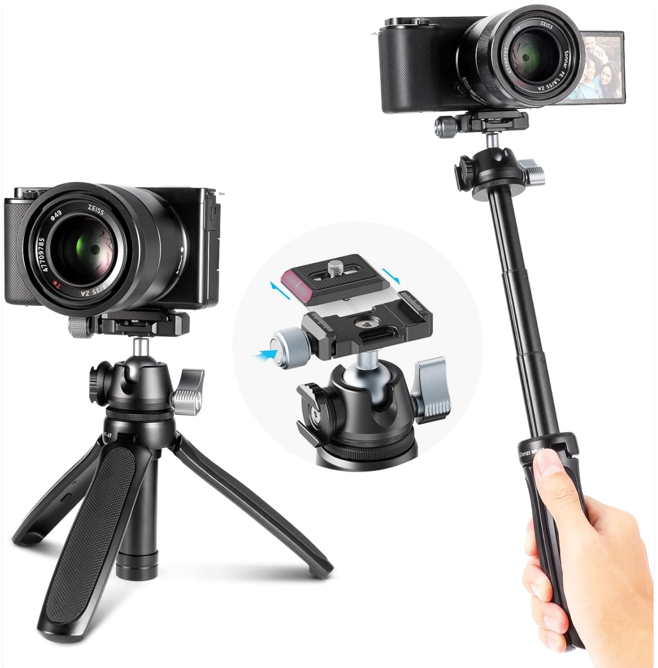
The ULANZI MT-47 tripod can be used as a stable desktop tripod or an extendable handheld grip.