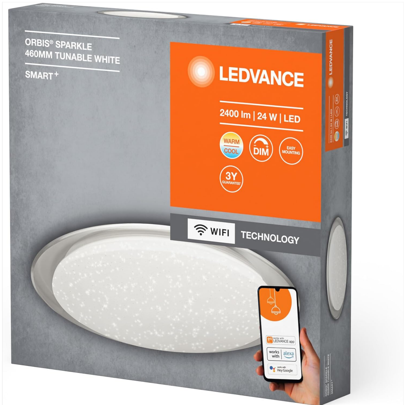
Image: Product packaging showing the LEDVANCE ORBIS SPARKLE SMART+ WiFi Ceiling Light and its features.