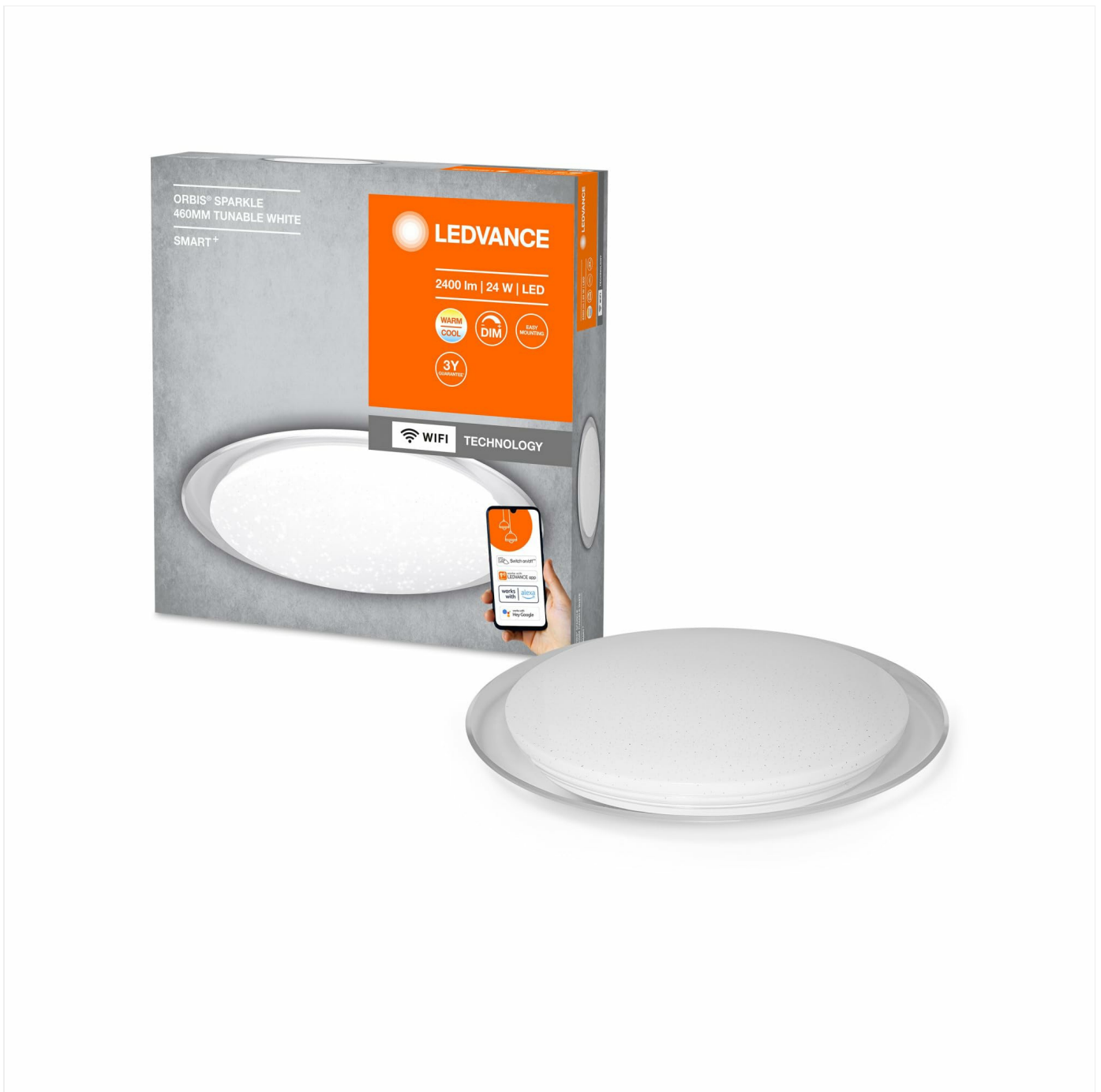
Image: The LEDVANCE ORBIS SPARKLE SMART+ WiFi Ceiling Light providing illumination in a room.