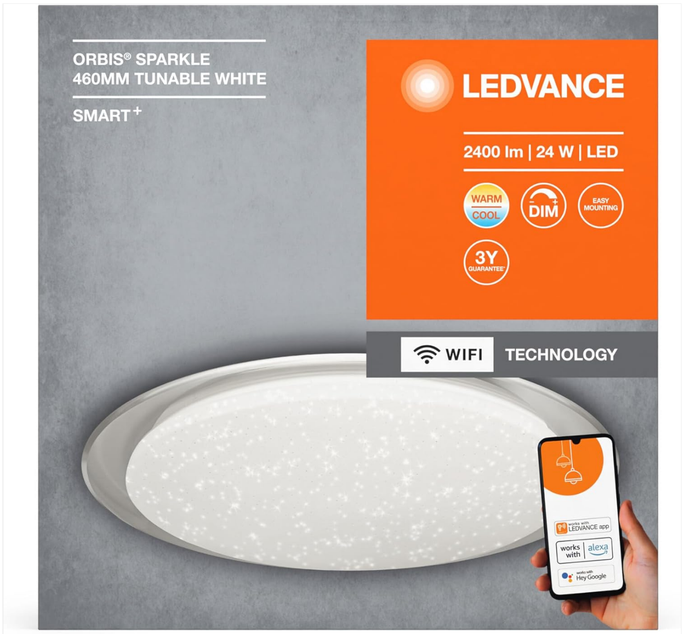
Image: Product packaging highlighting compatibility with the LEDVANCE SMART+ app, Amazon Alexa, and Google Assistant.