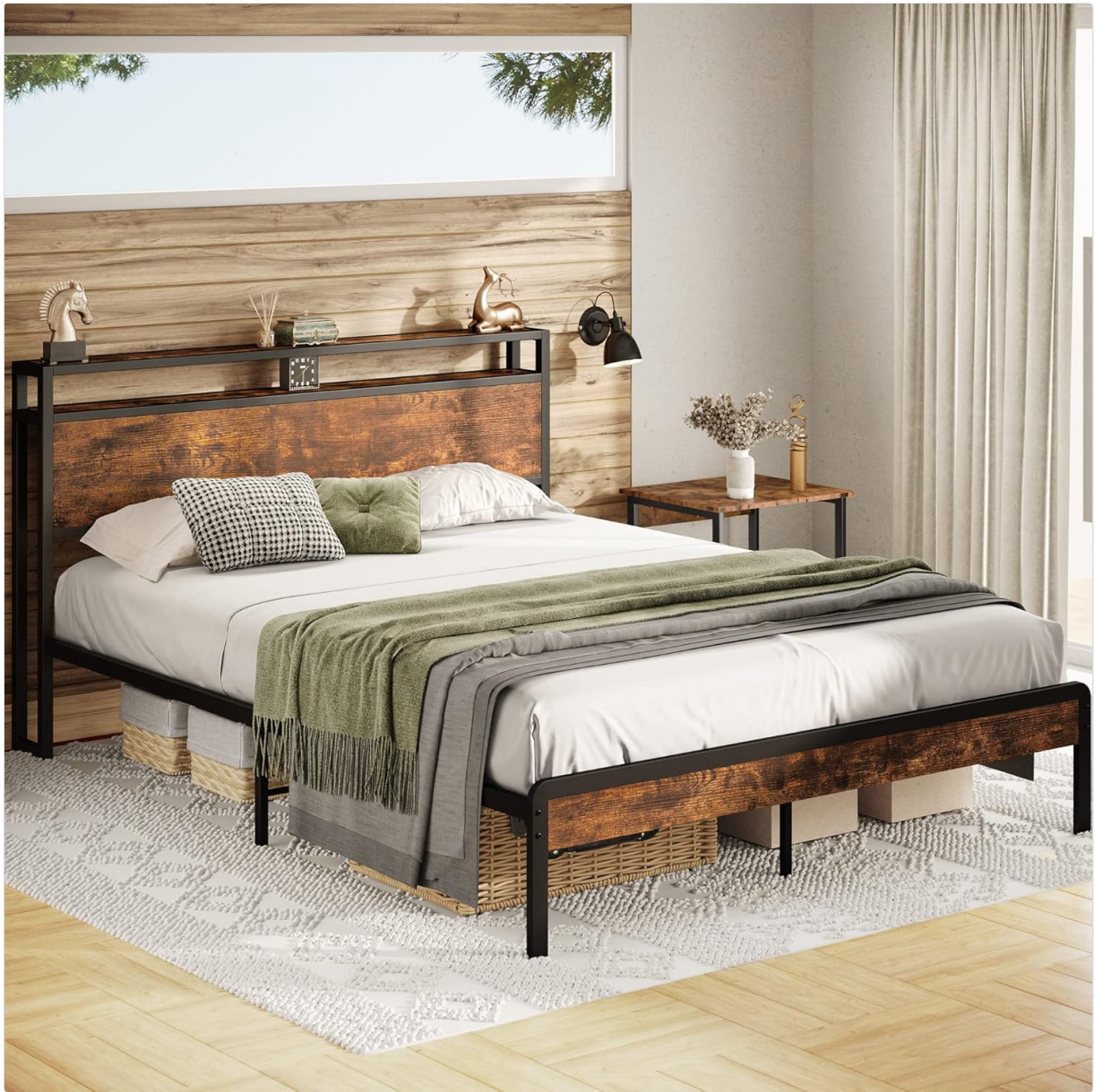
Image: A detailed view of the 2-tier storage headboard, showcasing its functionality for holding small items like a phone, glasses, and decorative objects.