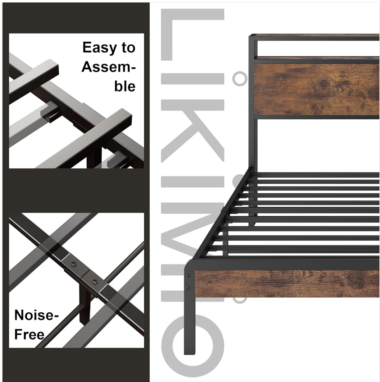
Image: A visual representation of the bed frame's robust construction, emphasizing the stable frame and arc corner design for enhanced durability and safety.