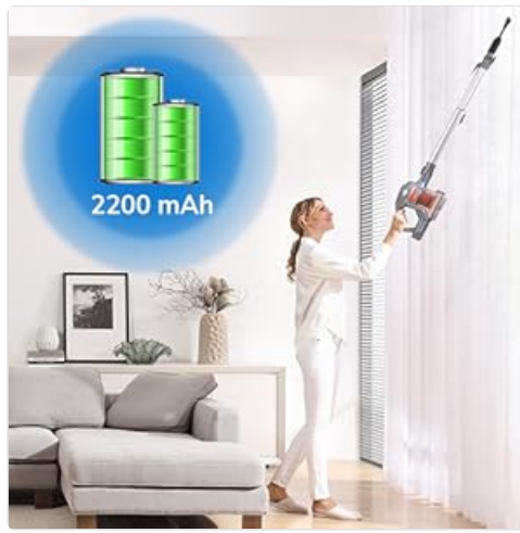
Image: The adjustable extension wand allows for comfortable use by individuals of varying heights.