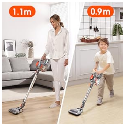
Image: The 2200 mAh battery provides ample power for cleaning sessions.