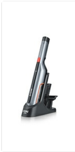
Image: The charging dock provides a convenient way to store and charge the vacuum.