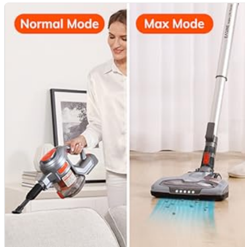
Image: The flexible design of the floor head allows it to reach every area and corner with ease.

The motorized floor head is designed for flexibility, allowing it to maneuver around corners and furniture with ease. The built-in LED lights illuminate dark spots, ensuring no dirt is missed.