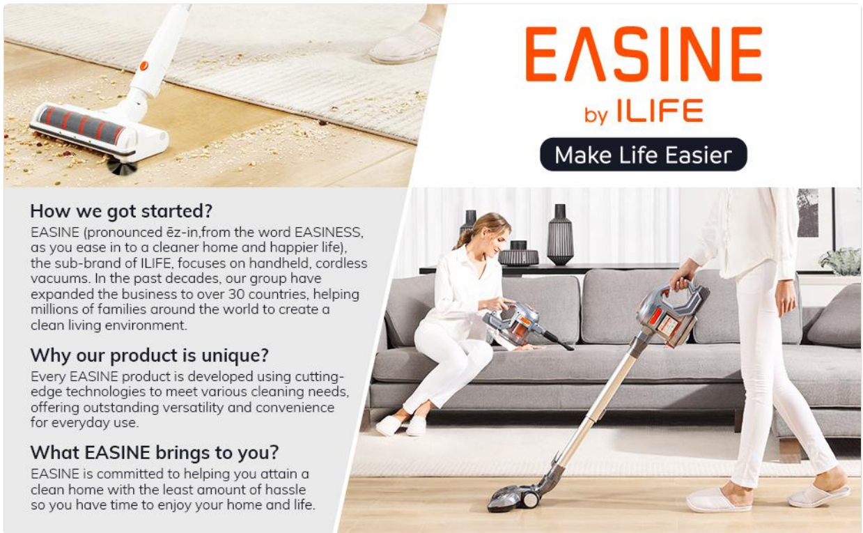
Image: The motorized floor head efficiently picks up debris with 10.5Kpa suction and integrated LED lights, illuminating the cleaning path.