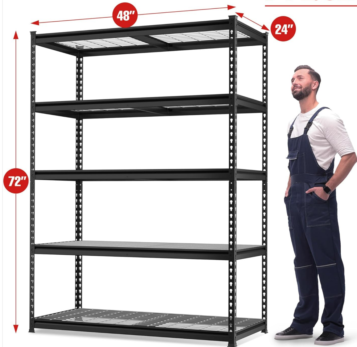
Image: Dimensions of the WORKPRO 5-Tier Metal Shelving Unit.