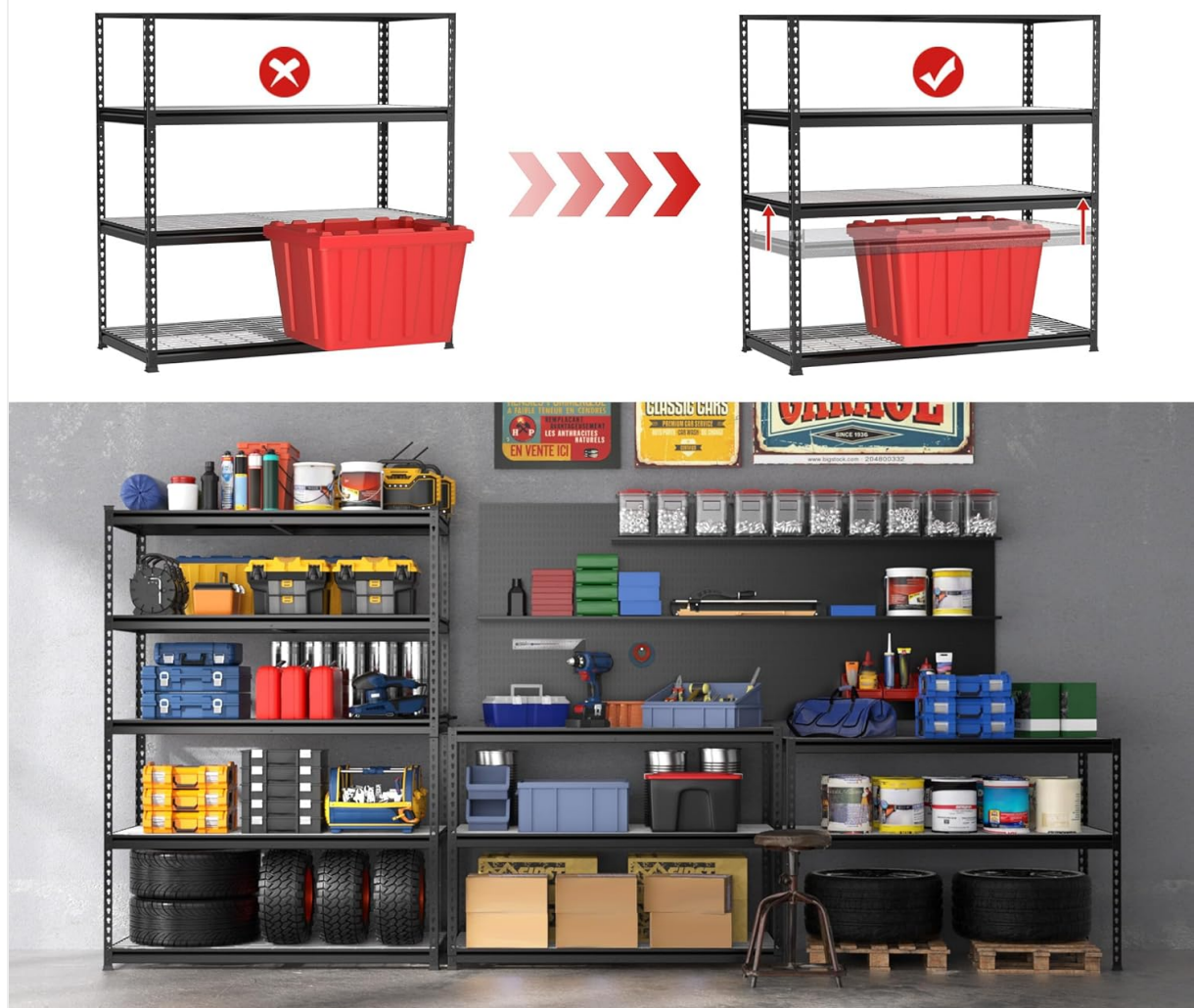
Image: Illustration of the two possible assembly configurations for the shelving unit.