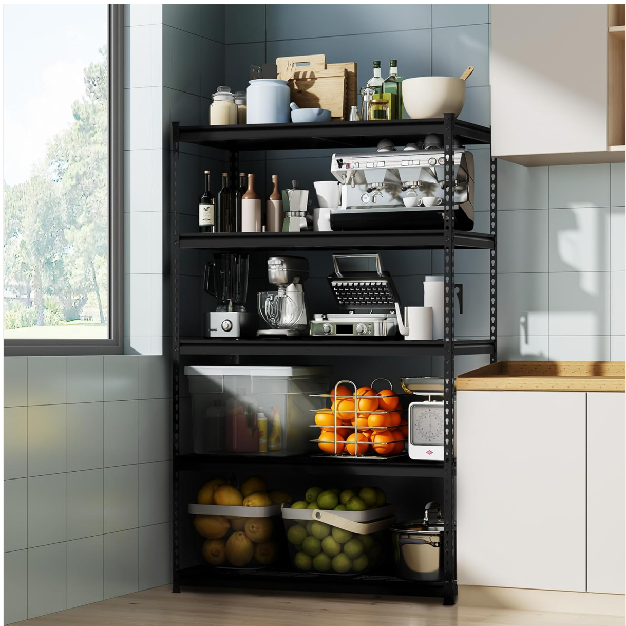
Image: A WORKPRO shelving unit used in a kitchen setting, holding appliances and food.