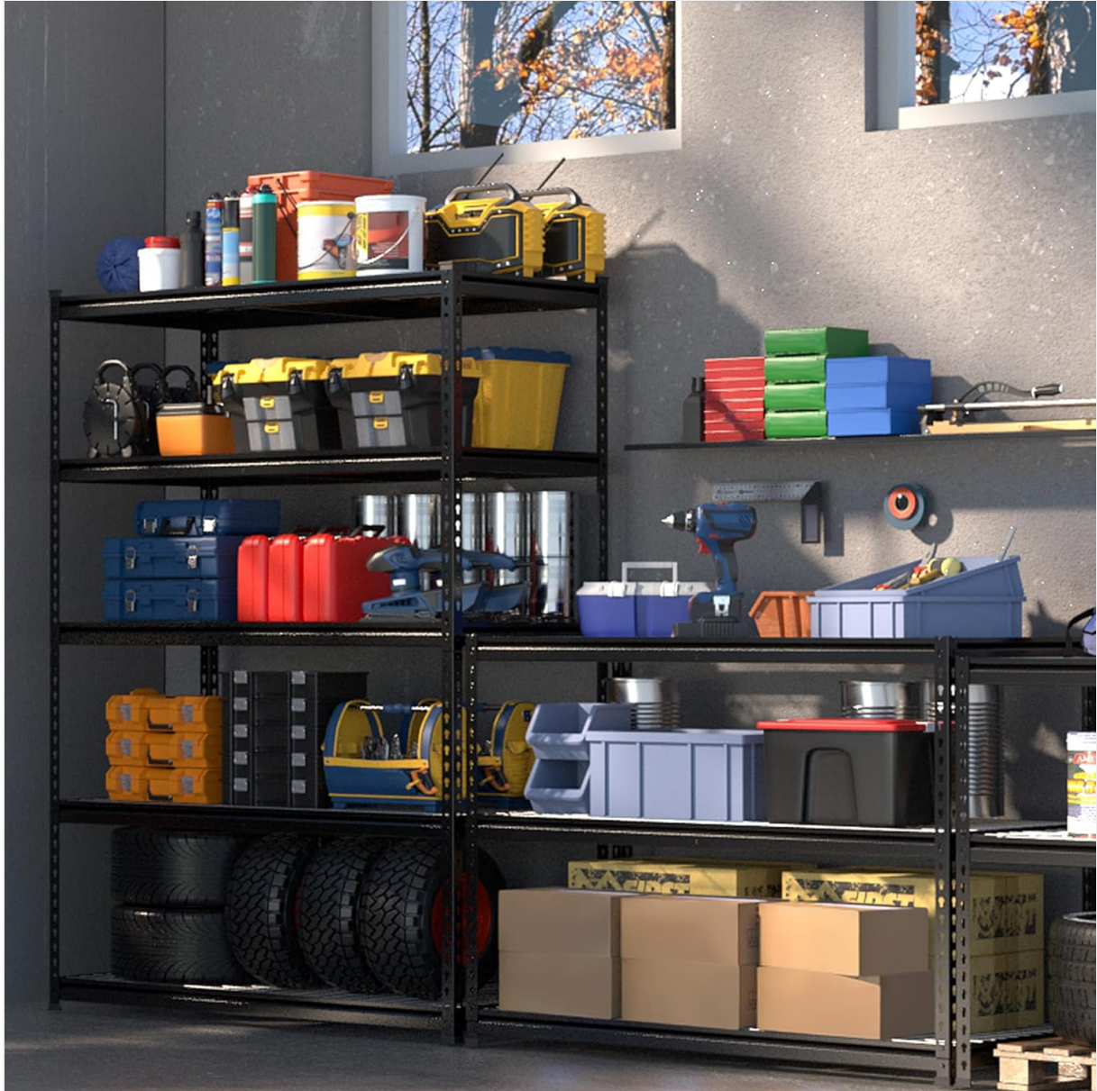
Image: A WORKPRO shelving unit fully loaded with various items in a garage, showcasing its storage capacity.