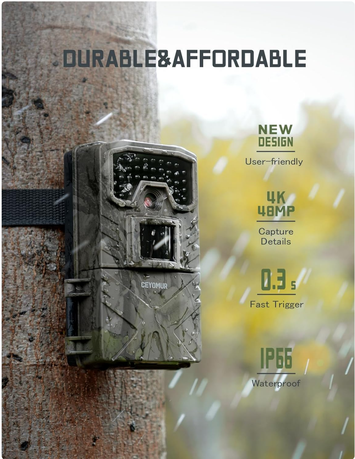
Figure 4.2: Camera mounted on a tree.