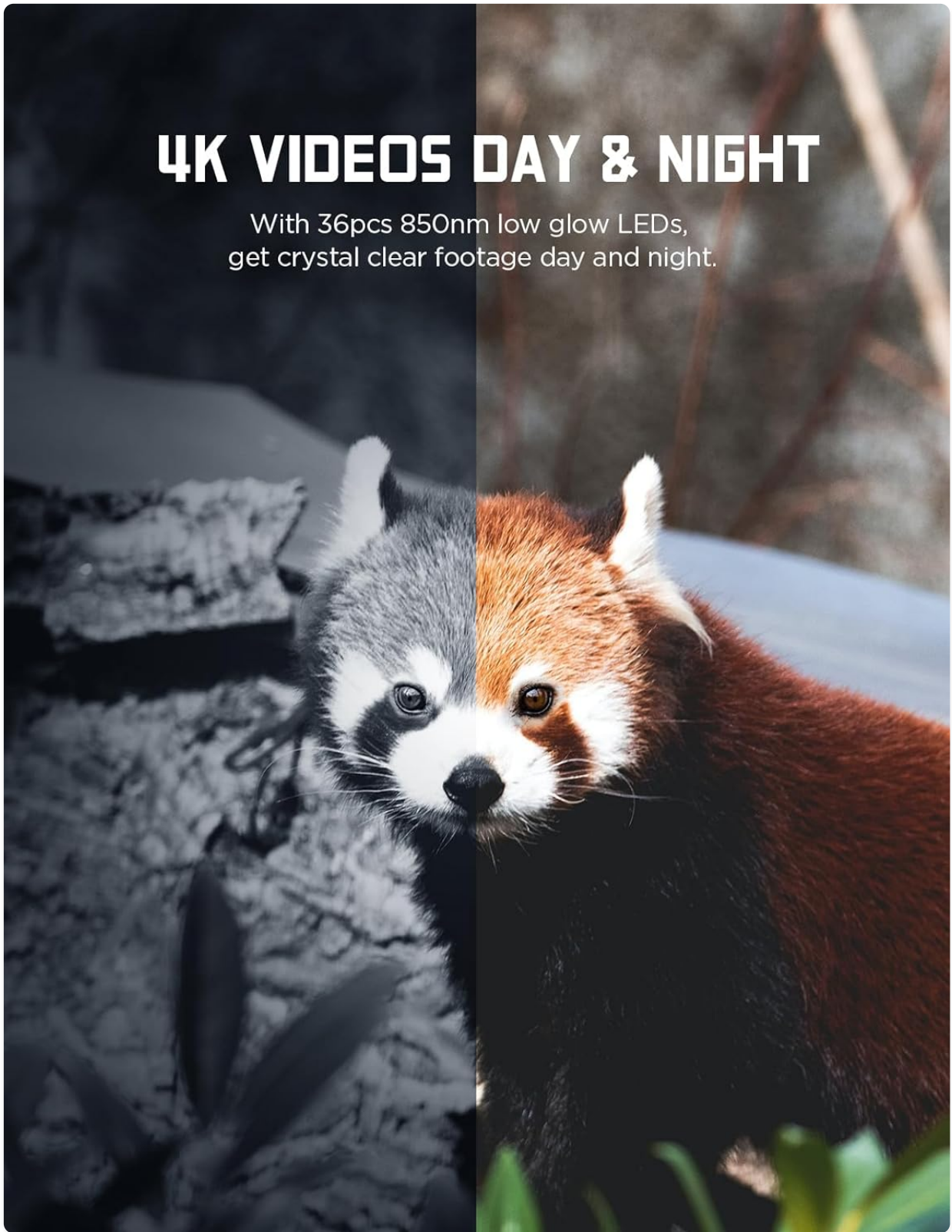
Figure 5.2: 4K Videos Day & Night.

With 36pcs 850nm low glow LEDs, get crystal clear footage day and night.