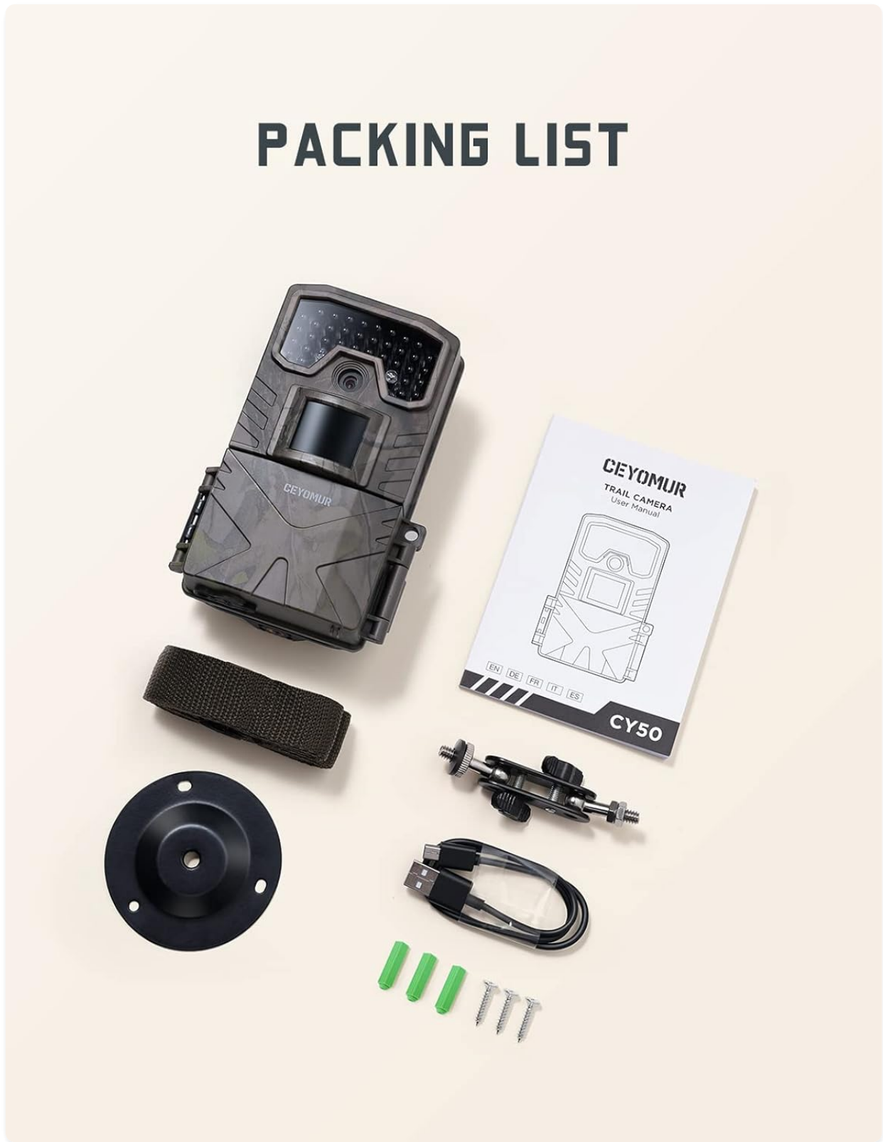
Figure 2.1: Contents of the CEYOMUR CY50 package.