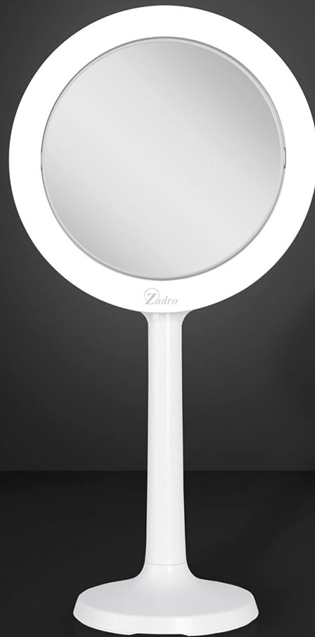
Figure 5: Three distinct LED light color settings.