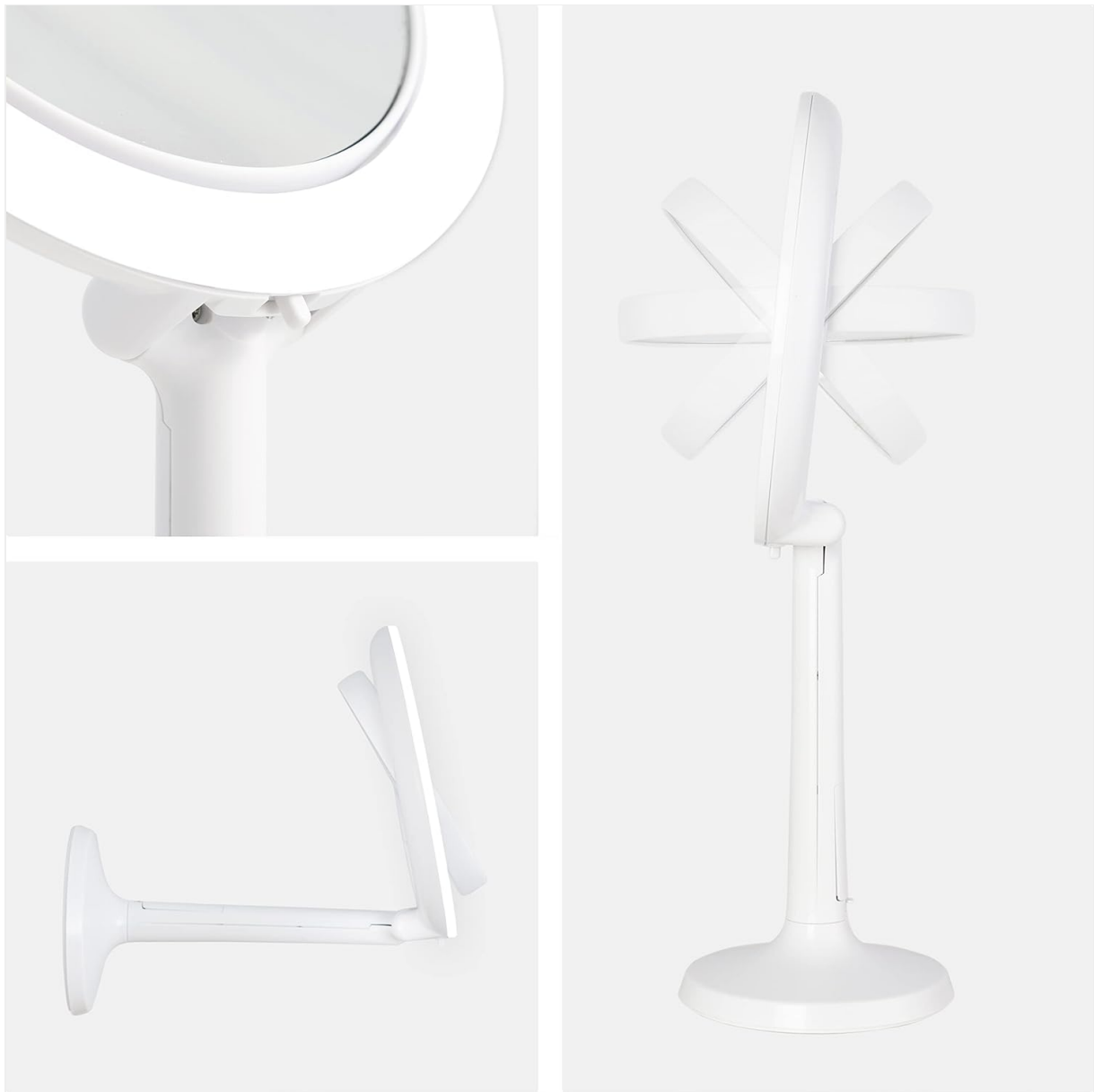
Figure 7: Mirror folded for storage or travel.