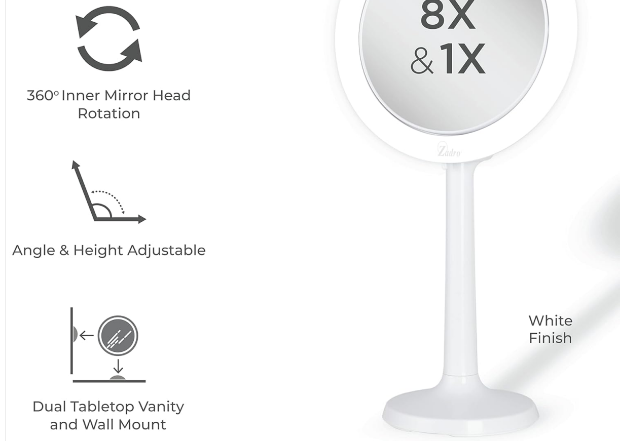
Figure 6: Dual magnification and rotational features.

Your browser does not support the video tag.