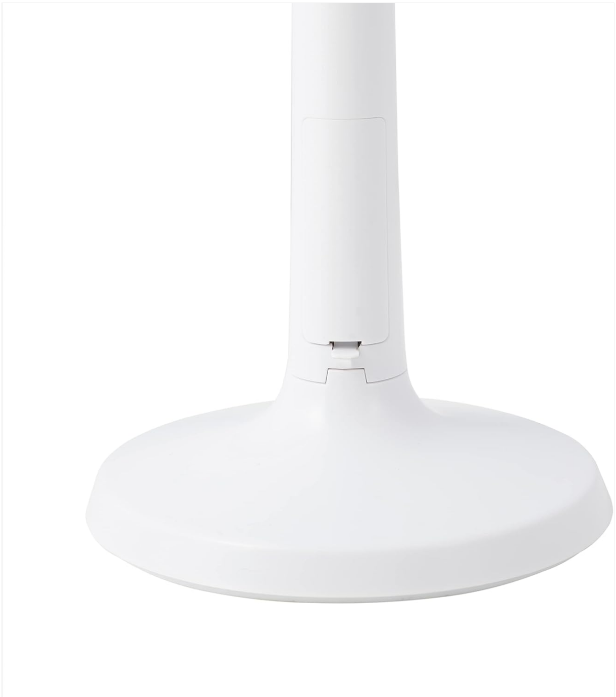
Figure 1: Battery compartment on the mirror base.