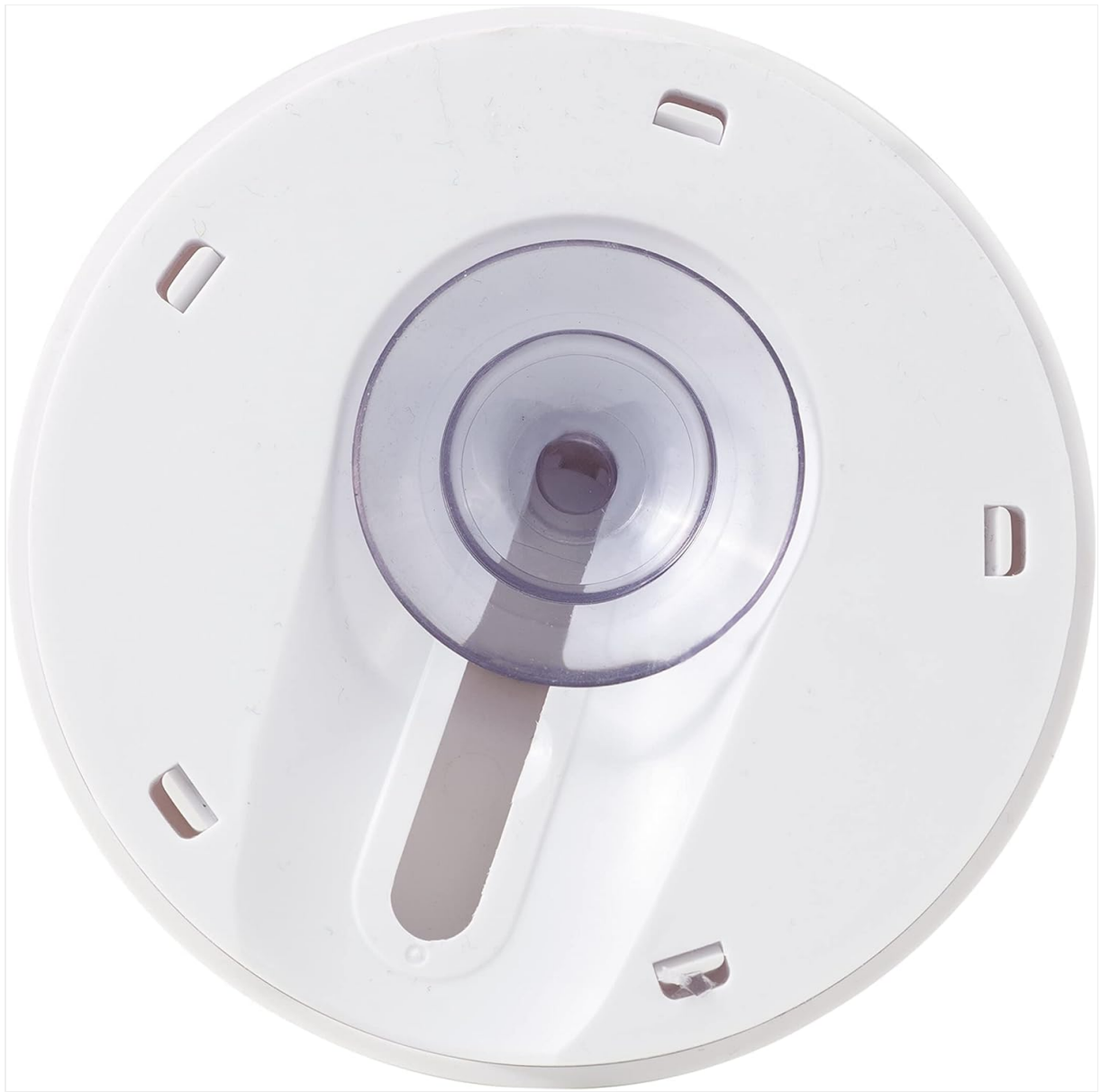
Figure 3: View of the suction cup base.

Your browser does not support the video tag.