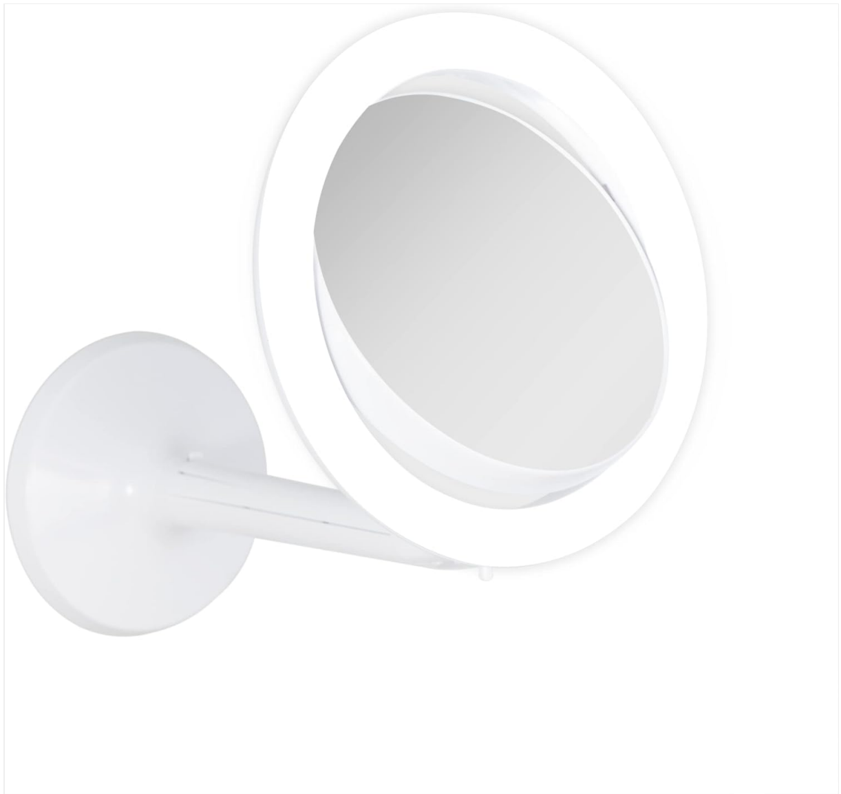
Figure 4: Mirror in wall-mounted configuration.