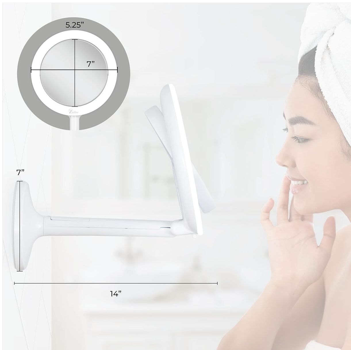
Figure 2: Mirror set up for tabletop use.