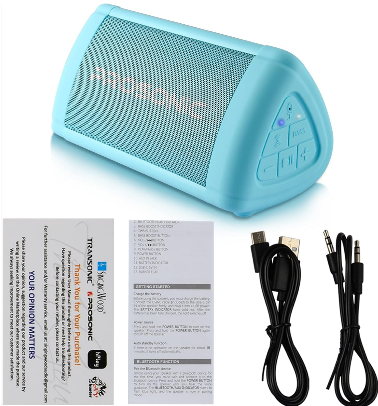
Image: Prosonic BT3 speaker shown with its USB charging cable and Aux cable, as typically found in the package.