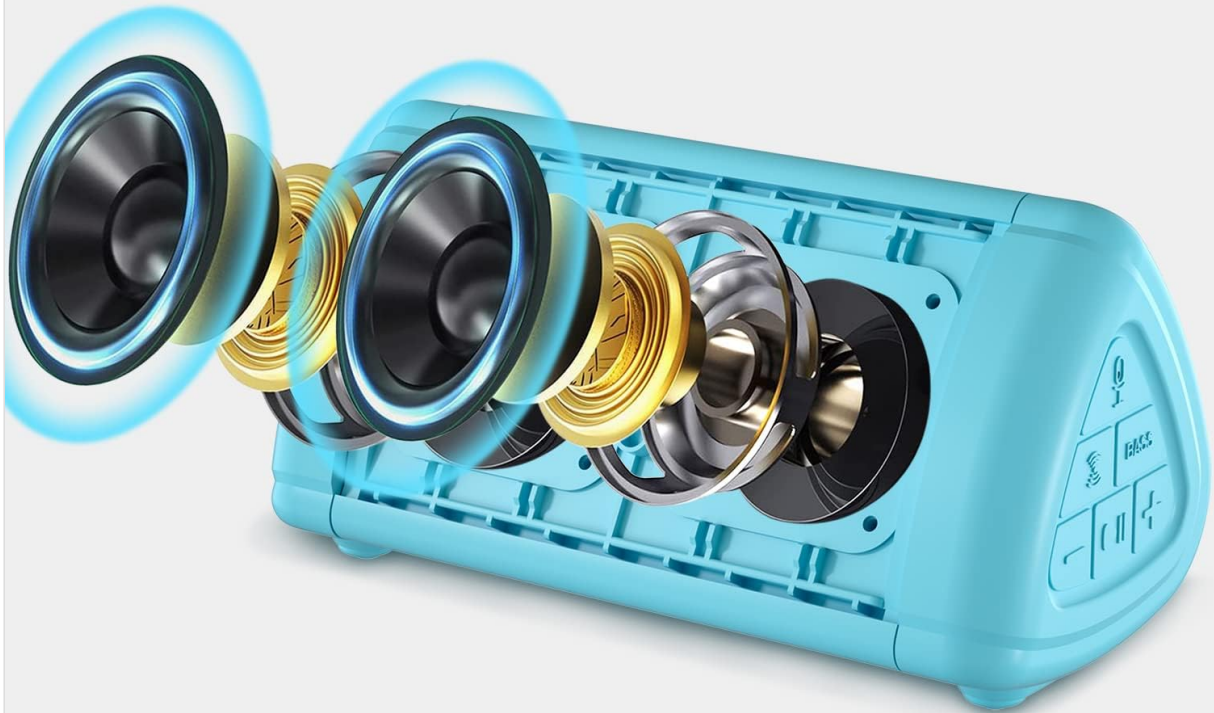
Image: An internal diagram of the Prosonic BT3 speaker illustrates its dual drivers and bass port, which contribute to its powerful stereo sound and deep bass output.