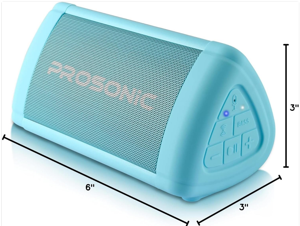
Image: Another view of the Prosonic BT3 speaker with its dimensions indicated as 6 inches wide, 3 inches deep, and 3 inches high.