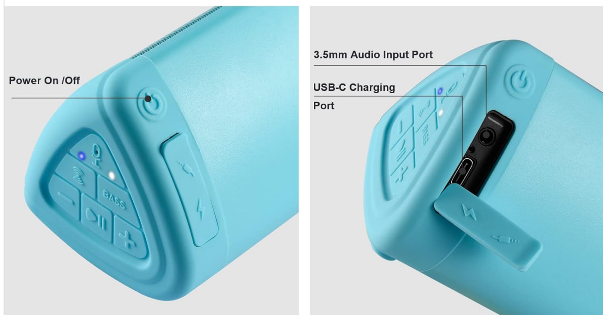
Image: This image illustrates the various buttons and ports on the Prosonic BT3 speaker, including Power On/Off, TWS Pairing, States Indication LED/Microphone, Bass Boost, Next Track/Volume Up, Play/Pause, Previous Track/Volume Down, 3.5mm Audio Input Port, and USB-C Charging Port.