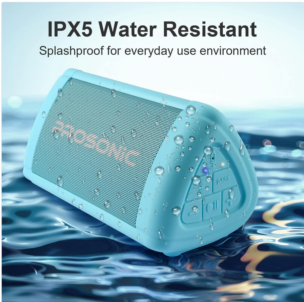
Image: The Prosonic BT3 speaker is shown with water splashing on it, illustrating its IPX5 water-resistant capability for outdoor use.