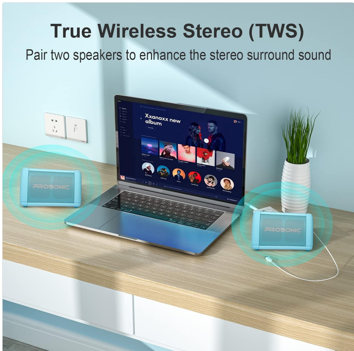
Image: Two Prosonic BT3 speakers are shown wirelessly connected to a laptop, demonstrating the True Wireless Stereo (TWS) feature for enhanced sound.

Your browser does not support the video tag.