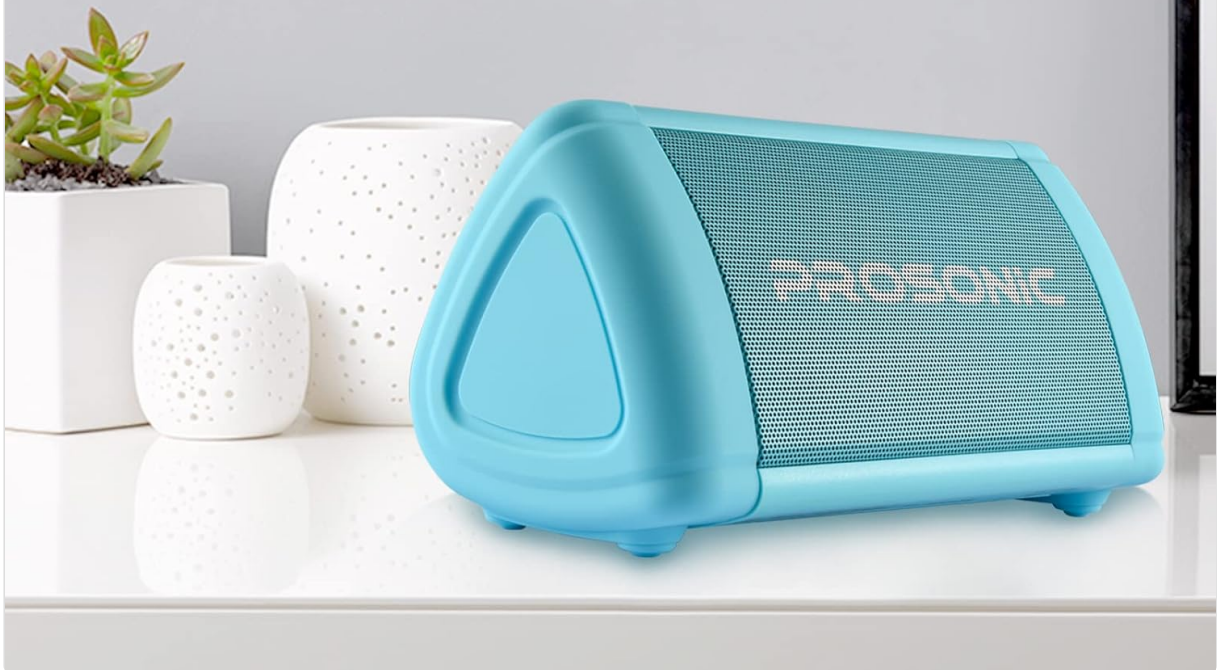
Image: The speaker is shown, highlighting its 14-hour continuous playtime on a full charge.

Built-in 2500mAh rechargeable battery provide up to 14 hours of music playtime ( at 70% volume)