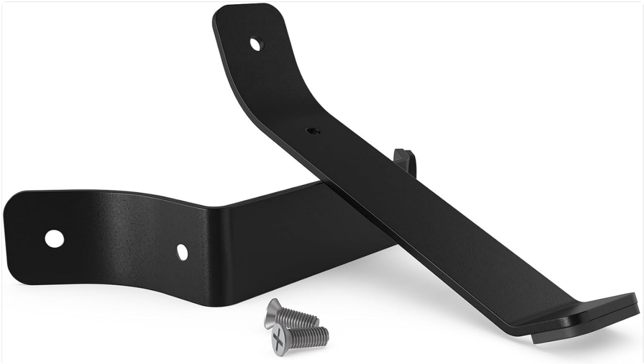
Image 3.1: Mounting brackets and screws, which may be used for either wall mounting or attaching feet for freestanding use.