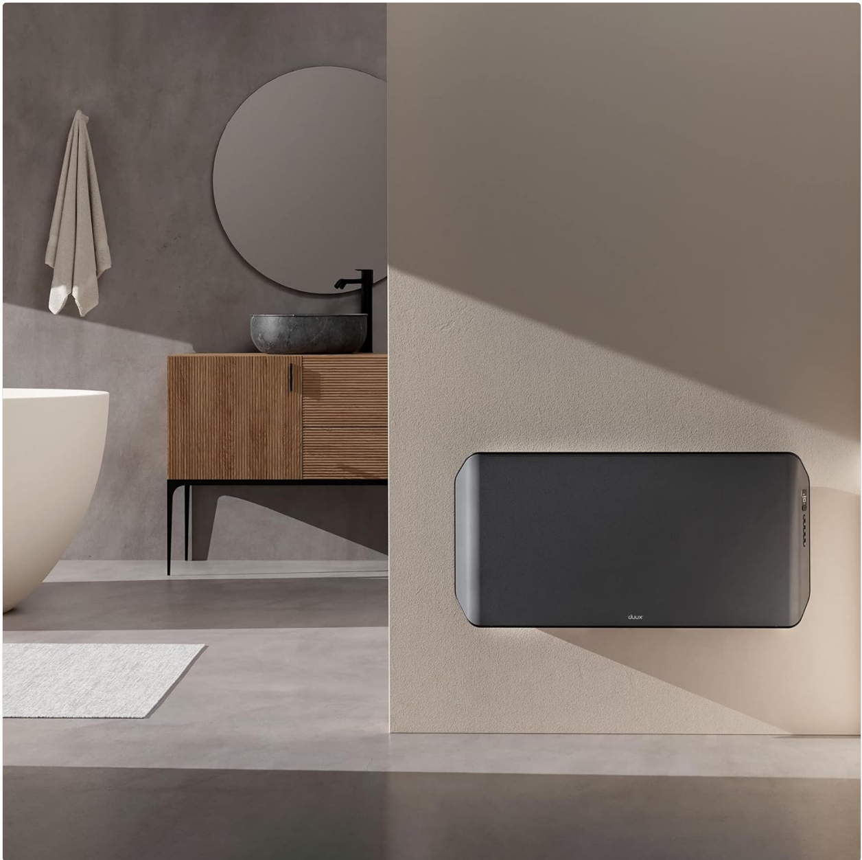
Image 3.2: The Duux Edge 2000 Smart Convactor Heater installed on a wall in a bathroom setting.