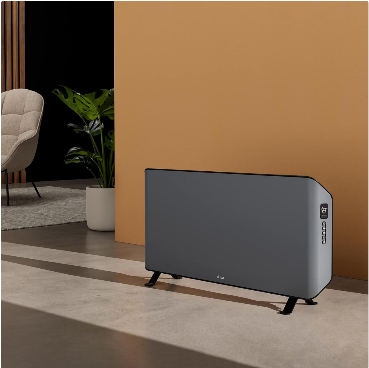
Image 2.2: The Duux Edge 2000 Smart Convector Heater positioned freestanding in a contemporary living space.