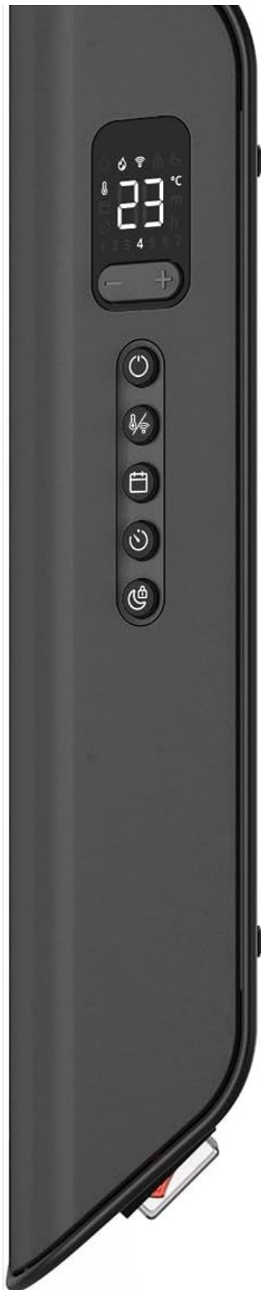
Image 4.1: Close-up view of the Duux Edge 2000 heater's integrated control panel.