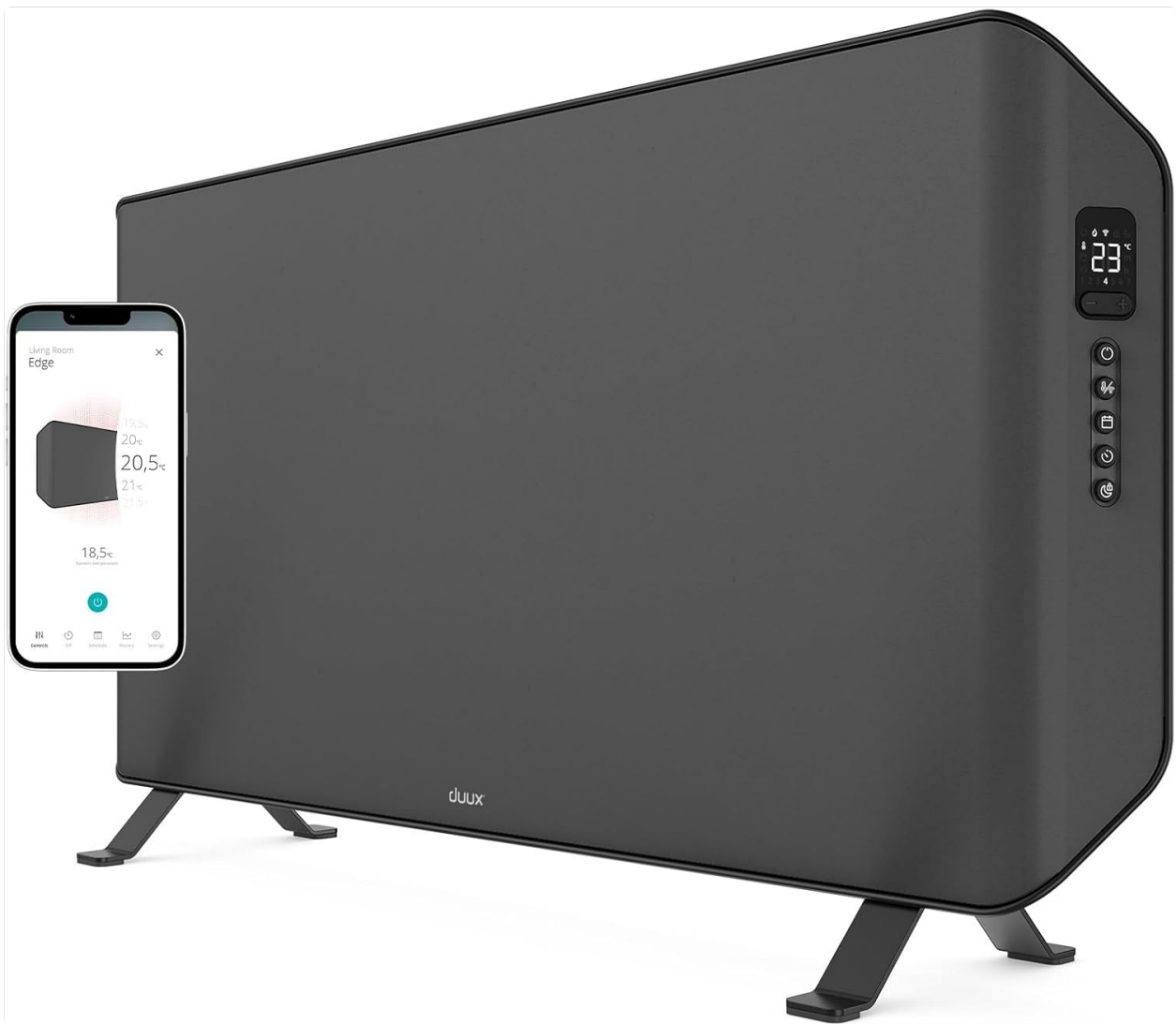
Image 2.1: Duux Edge 2000 Smart Convactor Heater with its accompanying smartphone application interface.