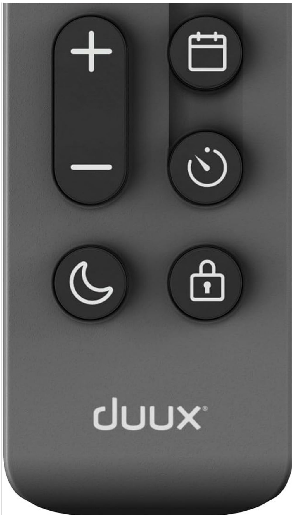
Image 4.3: The remote control for the Duux Edge 2000 Smart Convactor Heater, showing various function buttons.