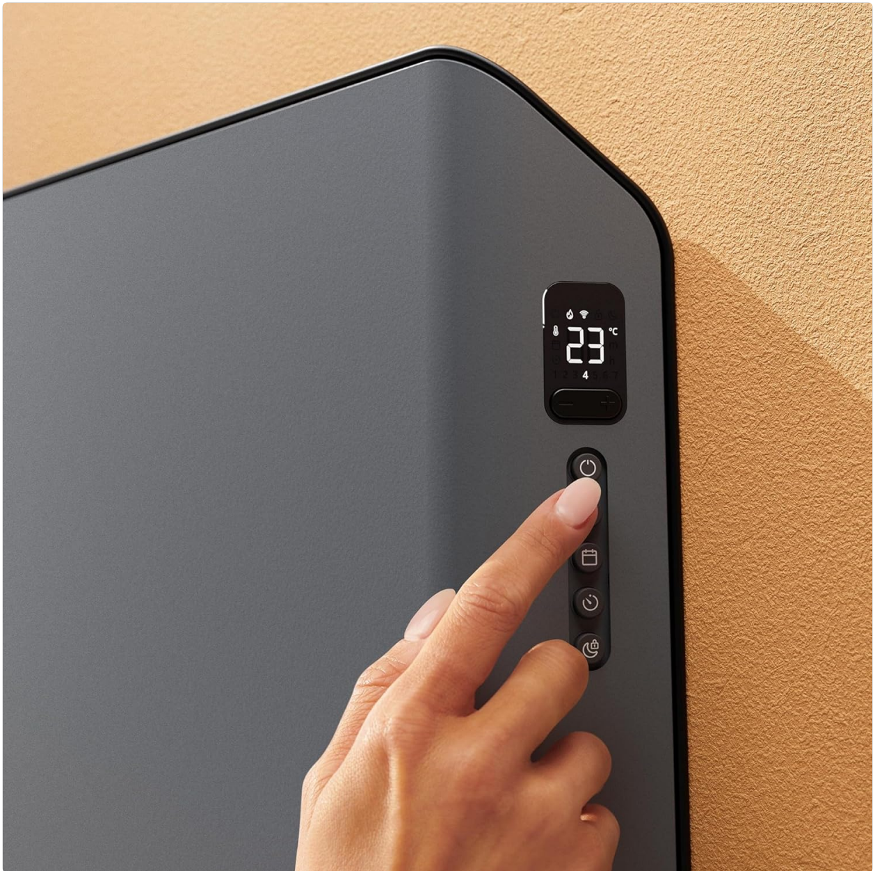
Image 4.2: A hand demonstrating interaction with the heater's control panel buttons.