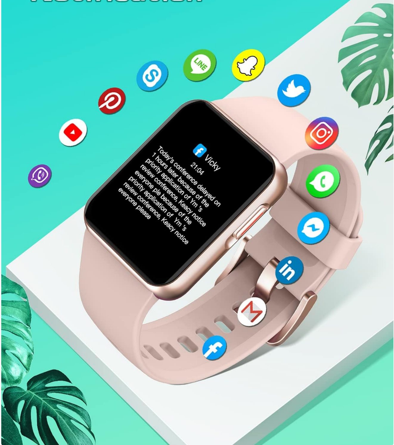
Figure 3: Smartwatch Notification Display. This image shows how messages from various social media platforms appear on the watch screen.