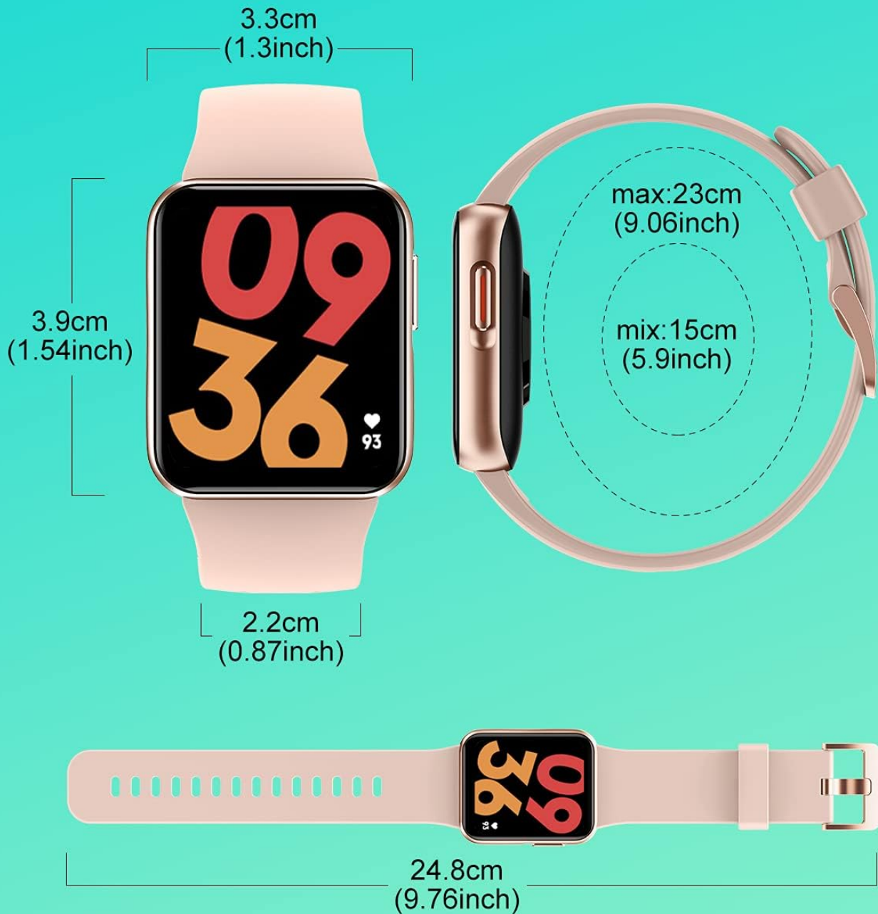
Figure 9: GRV Smart Watch N29 Dimensions. This diagram provides detailed measurements of the watch face and strap length.