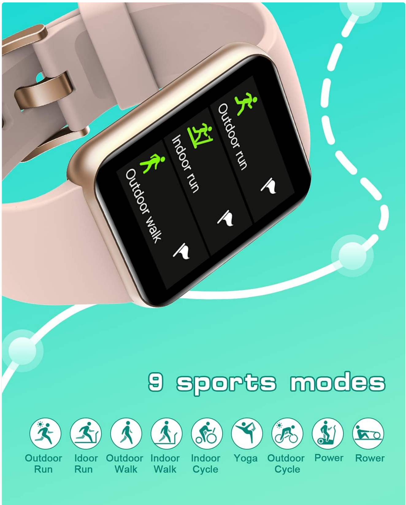
Figure 5: Sports Modes. This image highlights the variety of exercise tracking options available on the smartwatch.