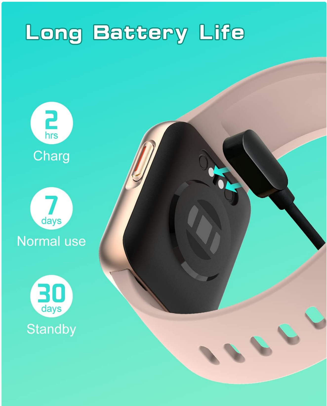
Figure 2: Charging the GRV Smart Watch N29. This image illustrates the magnetic charging connection and highlights the watch's long battery life capabilities.