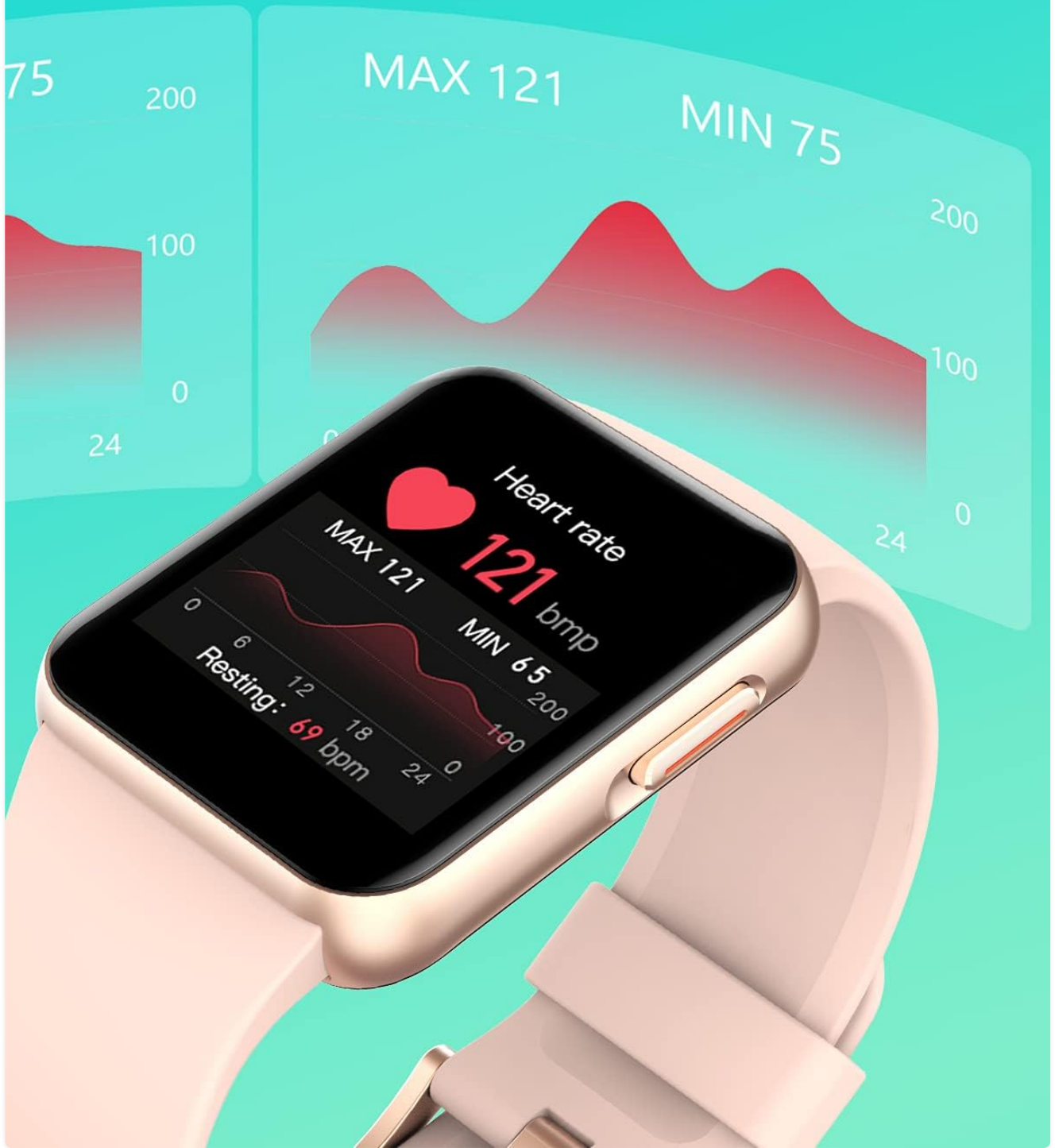
Figure 6: Heart Rate Monitoring. This image shows the watch's interface for displaying heart rate, including current and historical data.