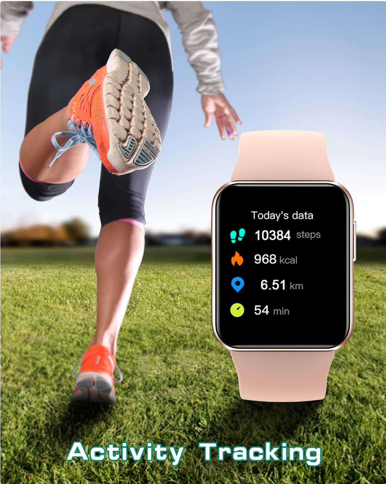
Figure 4: Activity Tracking on GRV Smart Watch N29. This image shows the watch displaying real-time fitness data during an activity.