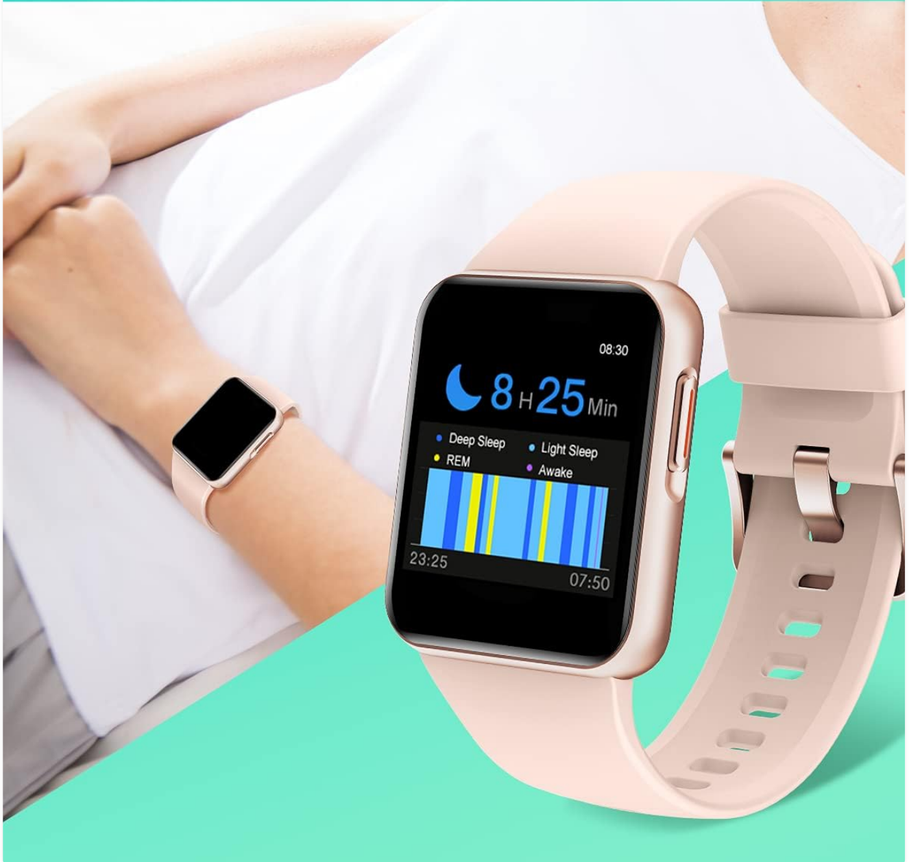
Figure 7: Scientific Sleep Tracking. This image demonstrates the watch's ability to monitor and categorize different stages of sleep.