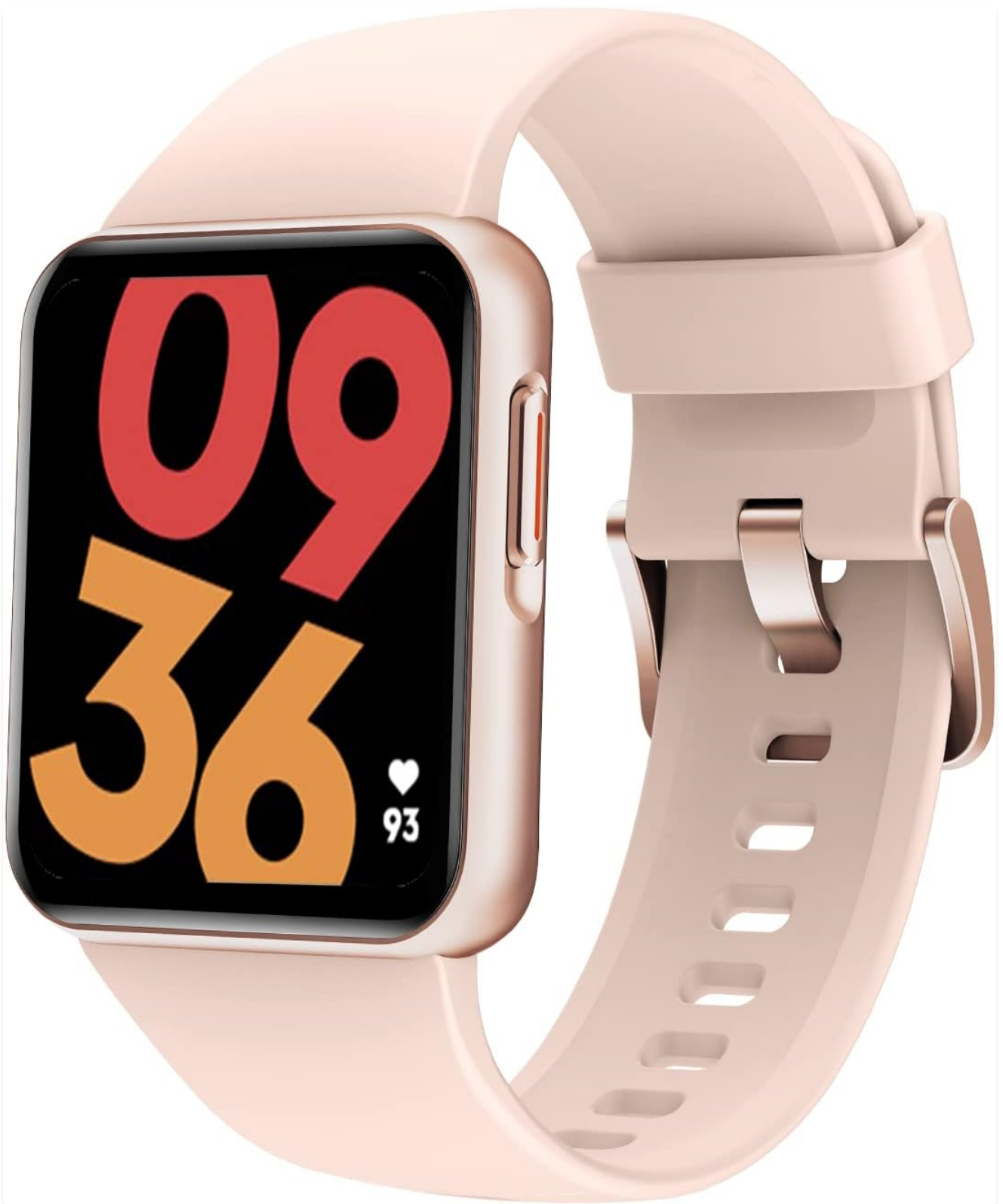
Figure 1: GRV Smart Watch N29. This image shows the watch's main display with the time and heart rate, highlighting its sleek design and pink strap.