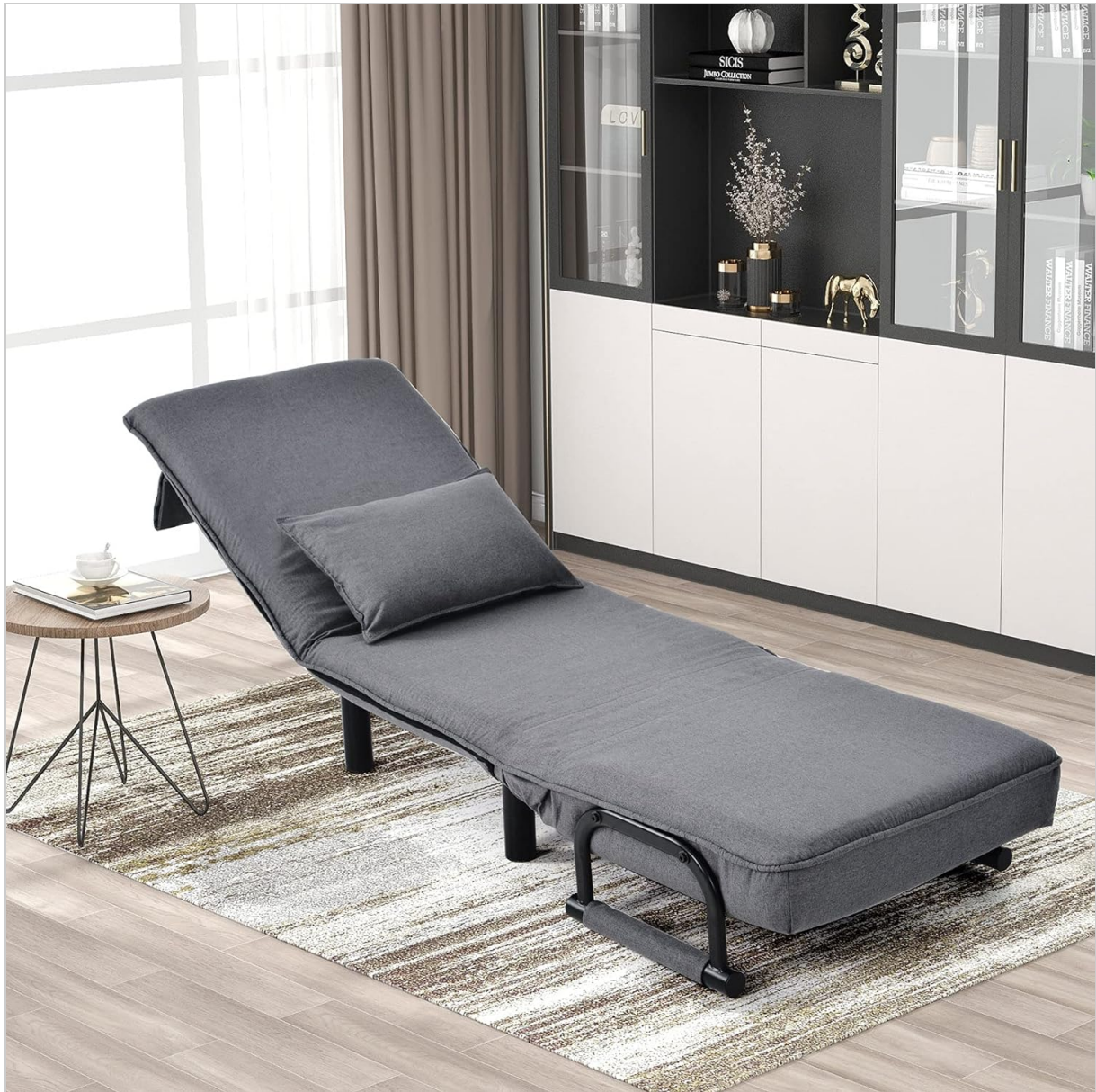
Image 5.1: The sofa bed extended into a comfortable lounge position.