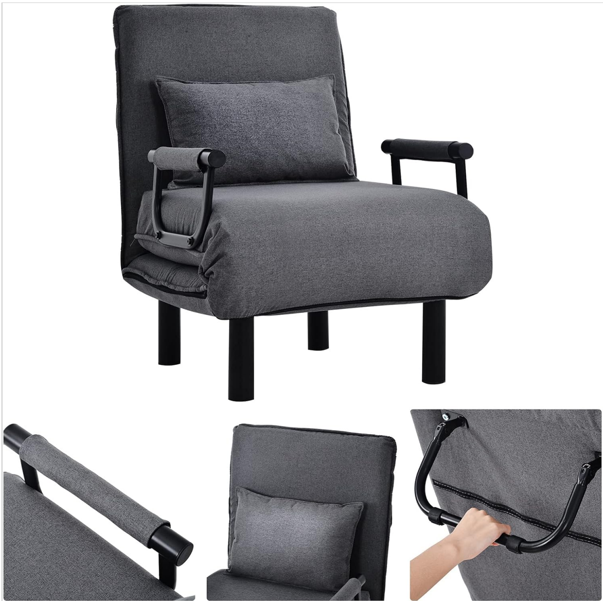
Image 5.5: Visual representation of the 6 adjustable backrest positions.