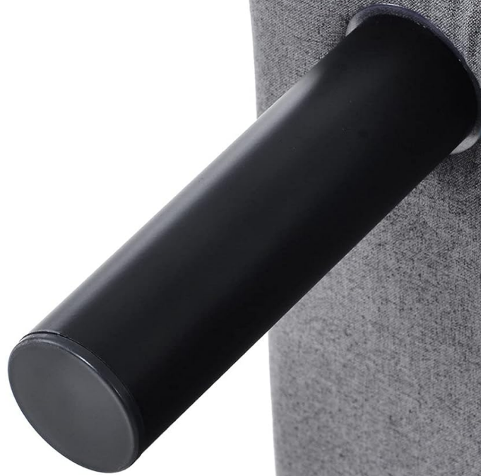
Image 5.3: Close-up view demonstrating how to extend the hidden support legs for bed conversion.

Premium-Metall bietet eine stabile Basis mit einer maximalen Tragfähigkeit von bis zu 150 kg