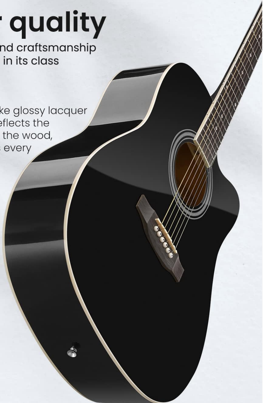
Image: A close-up of the Moukey acoustic guitar's body, showcasing its glossy finish and craftsmanship.

The thin, wing-like glossy lacquer finish not only reflects the original grain of the wood, but also sounds every hint of detail.