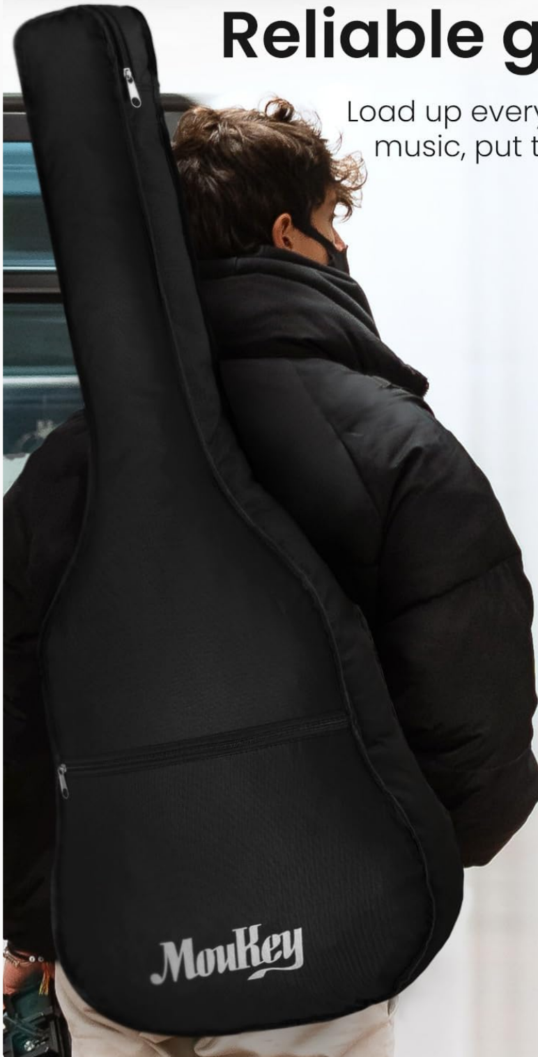
Image: The Moukey acoustic guitar safely stored in its padded gig bag, ready for transport or protection.