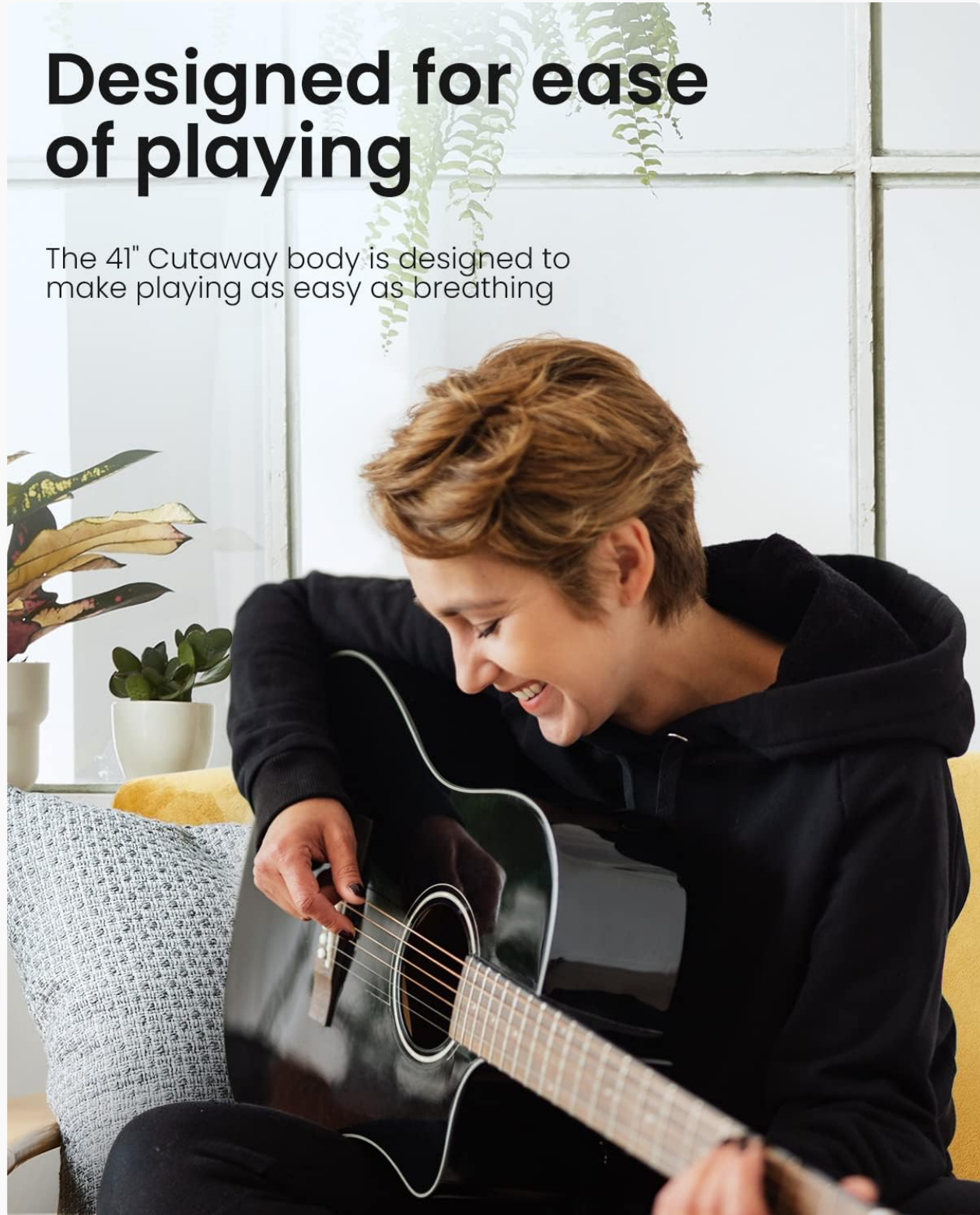
Image: A person playing the Moukey acoustic guitar, highlighting the comfortable design and cutaway body.

The Moukey 41" acoustic guitar features a cutaway design, making it easy for beginners to reach higher frets. The smooth fingerboard and non-scratching frets ensure comfortable playability for extended periods. Precise position marks at the 3rd, 5th, 7th, 9th, 12th, 15th, and 17th frets on the neck and top of the fingerboard assist in convenient learning.