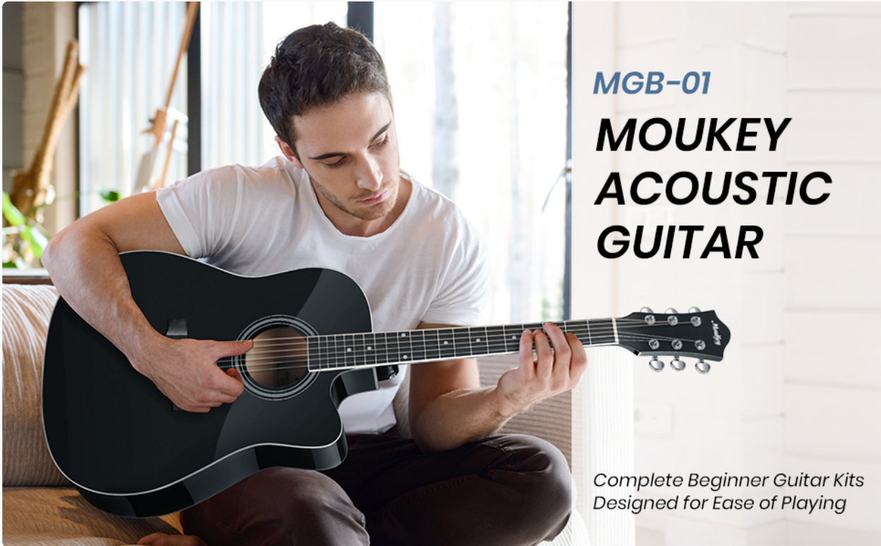
Image: The Moukey 41" Acoustic Guitar, a full-size instrument with a black finish, designed for beginners.

Thank you for choosing the Moukey 41" Acoustic Guitar. This full-size acoustic guitar is designed for beginners, adults, and teens, offering a comfortable playing experience and a rich, vibrant tone. This manual provides essential information for setting up, operating, maintaining, and troubleshooting your new instrument, ensuring a rewarding musical journey.