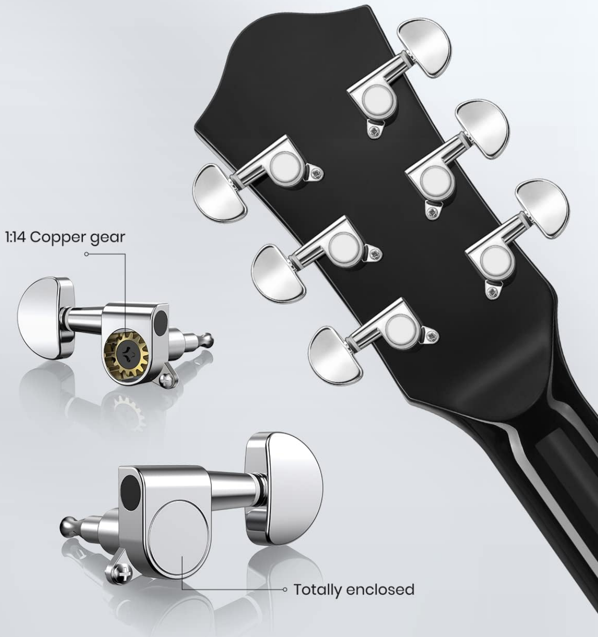
Image: Detailed view of the guitar's headstock, highlighting the 1:14 enclosed copper tuning machines for precise tuning.

Uses 1:14 gears to make tuning easier and more enjoyable