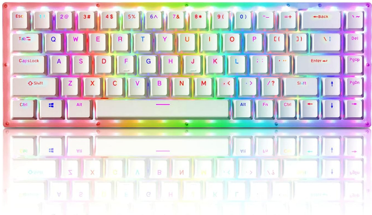
Figure 1: Womier W-K68 65% Wired Mechanical Keyboard

Thank you for choosing the Womier W-K68 65% Wired Mechanical Keyboard. This manual provides essential information for setting up, operating, and maintaining your new keyboard. The W-K68 features a compact 65% layout, hot-swappable switches, vibrant RGB backlighting, and a durable acrylic casing, designed to enhance your typing and gaming experience.