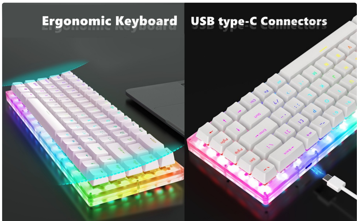
Figure 2: Ergonomic design and USB Type-C connectivity.