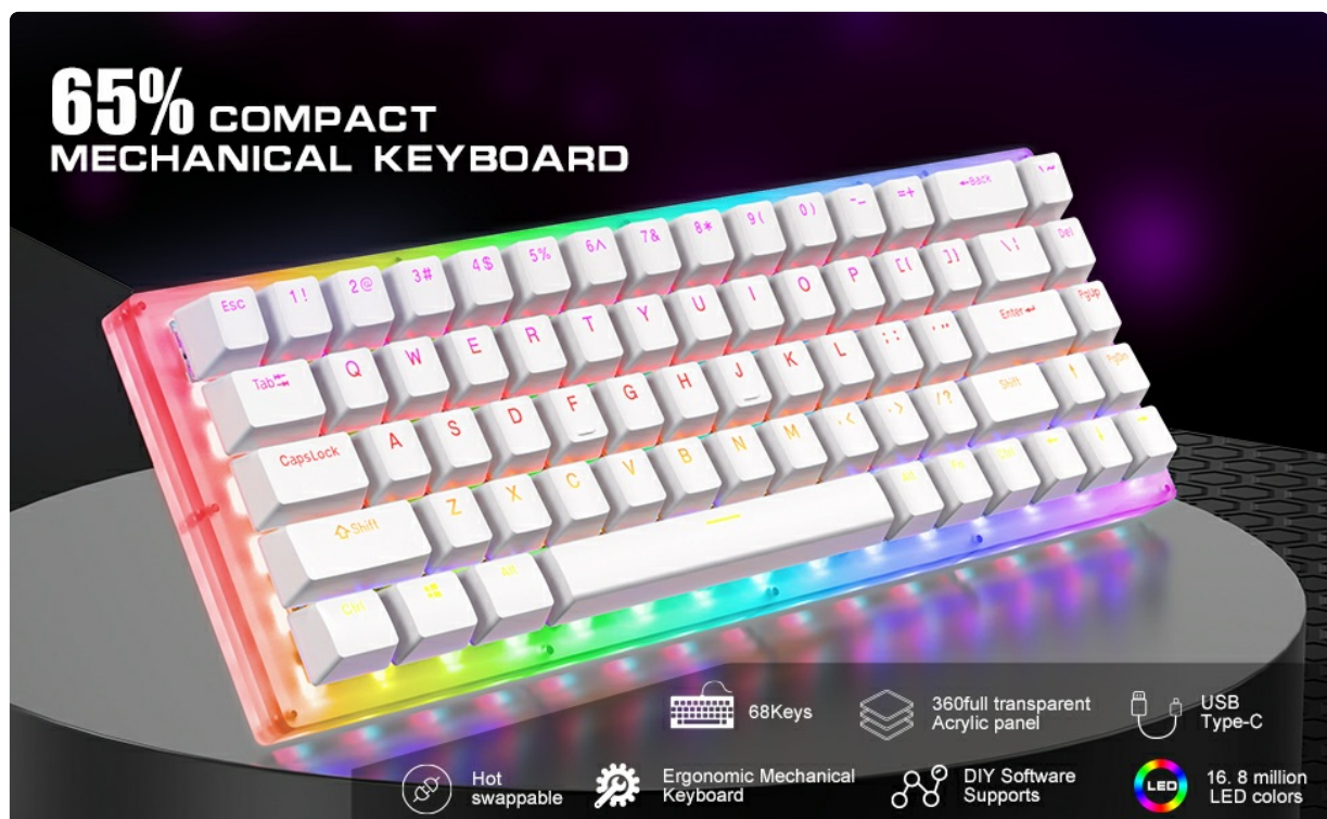
Figure 4: The 65% compact mechanical keyboard with its acrylic panel.

The keyboard is constructed with a translucent, three-layer acrylic casing. This design not only provides a unique aesthetic but also enhances the visual impact of the RGB backlighting, allowing light to diffuse beautifully through the case.