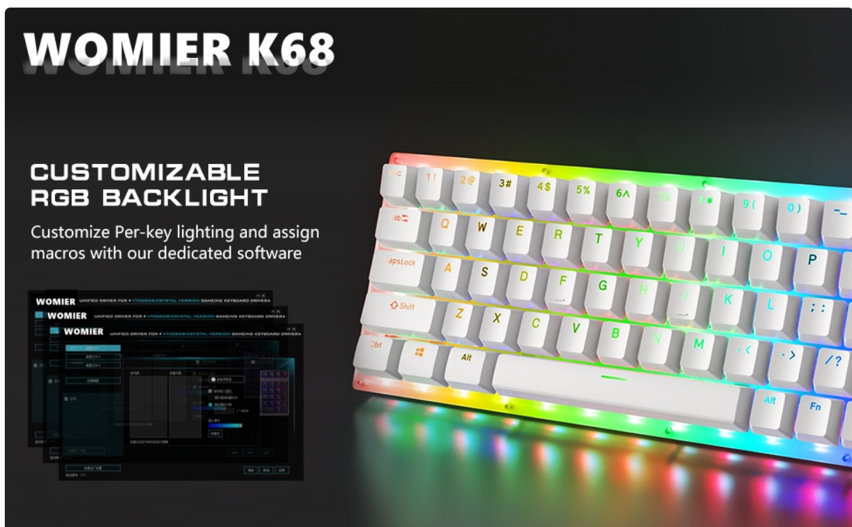
Figure 6: Customizable RGB backlighting in action.

Experience vibrant and customizable RGB backlighting with the W-K68. The frosted acrylic casing enhances the light diffusion, creating a stunning visual effect. The keyboard offers multiple lighting effects, adjustable brightness, color waves, and more, all controllable directly from the keyboard without the need for additional software.