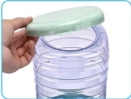
1. Open the lid