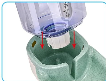
2. Fixed on the base