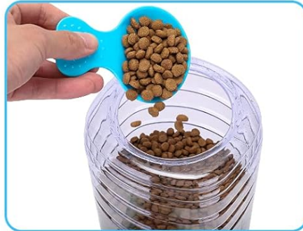
2. Fill the bucket with food