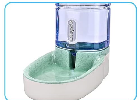
3. The water will flow out automatically

Image: Visual guide demonstrating the steps to fill and set up both the food and water dispensers.