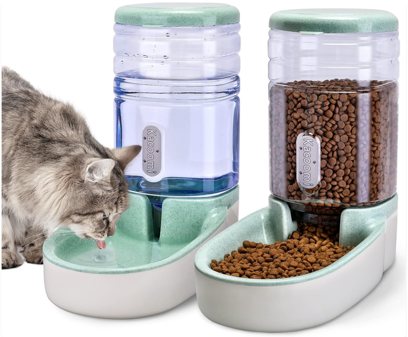
Image: The Kacoomi Automatic Pet Feeder and Water Dispenser set, showing a cat using the water dispenser and the food dispenser filled with kibble.