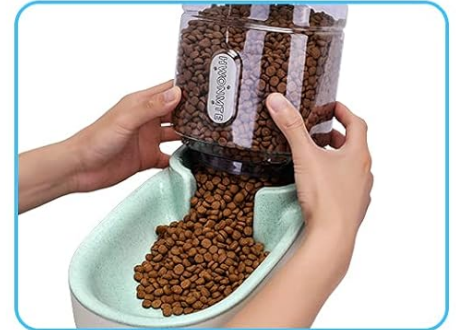
3. The food will fall automatically