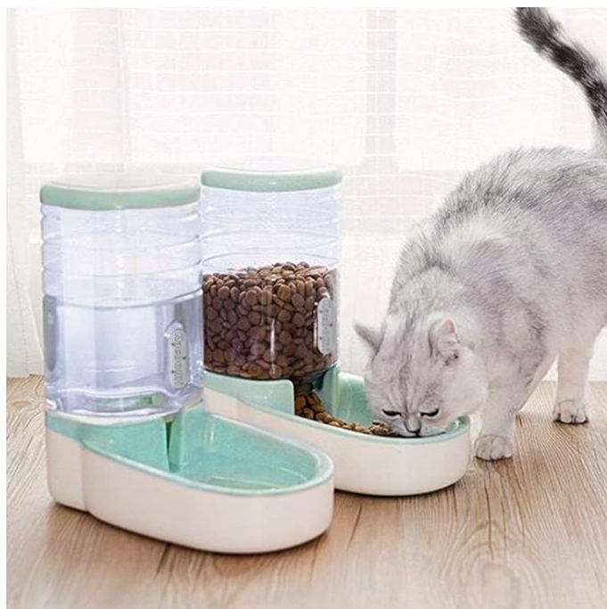
Image: Examples of cats and dogs comfortably using the Kacoomi automatic feeders.