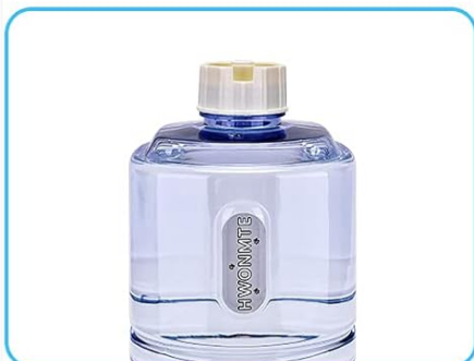
1. Fill the bucket with water, Screw the cap