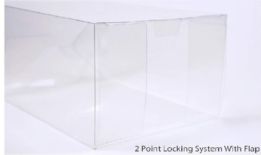
2 Point Locking System With Flap