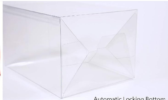
Automatic Locking Bottom