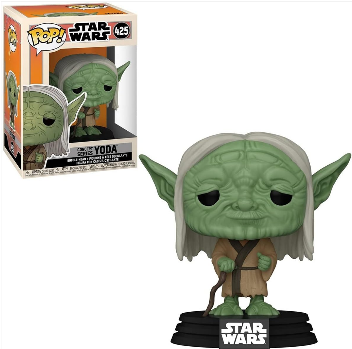
Image: The Funko Pop! Star Wars Ralph McQuarrie Concept Yoda figure, both inside its window display box and standing freely on its base.