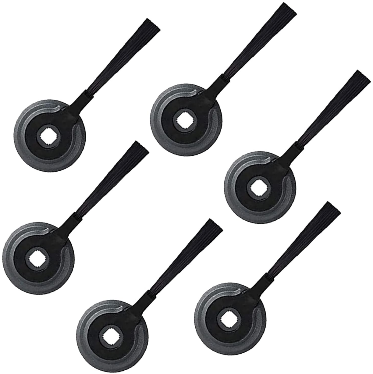
Figure 1: Six Detetap replacement side brushes. These brushes feature a durable design with black bristles and a grey base, ensuring effective debris collection.