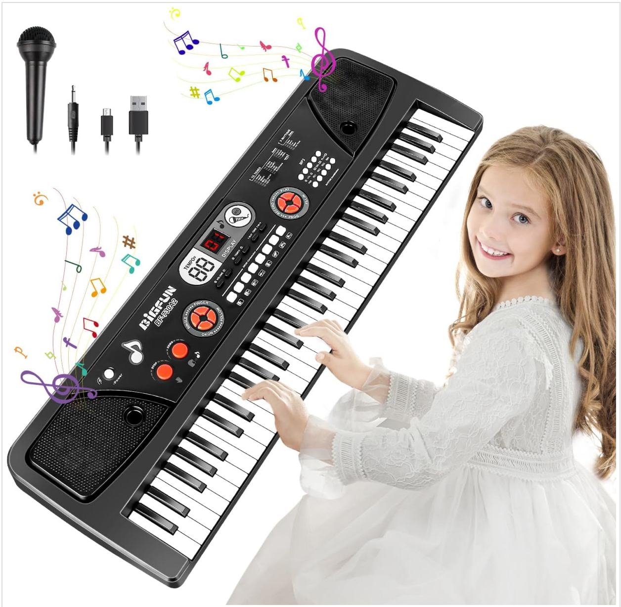
Image 3.1: The TWFRIC 61 Key Electronic Piano Keyboard with its accessories, including a microphone and power cable.