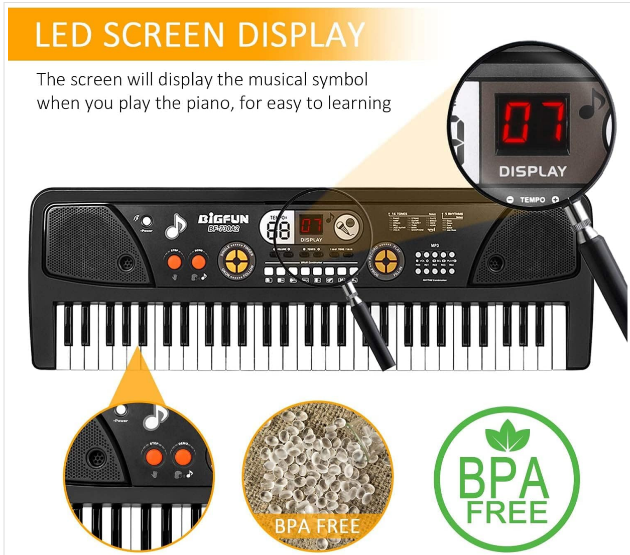
Image 6.1: The LED screen displays musical symbols and numbers for easy learning and setting identification.