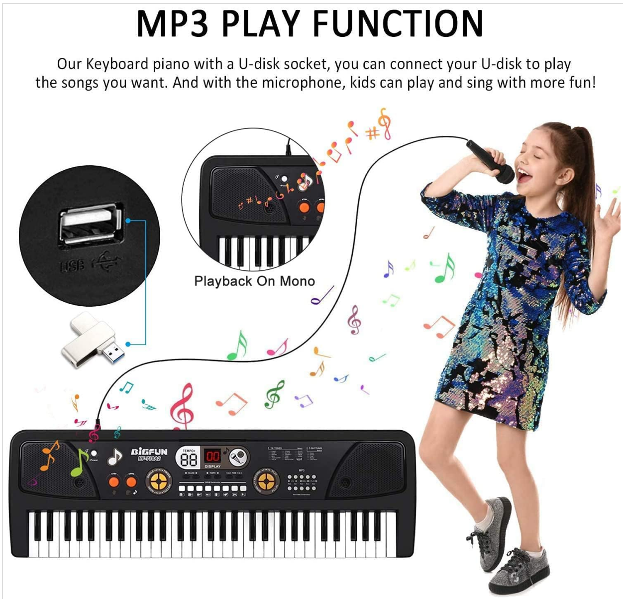
Image 6.2: The USB port allows connection of a U-disk for MP3 playback.