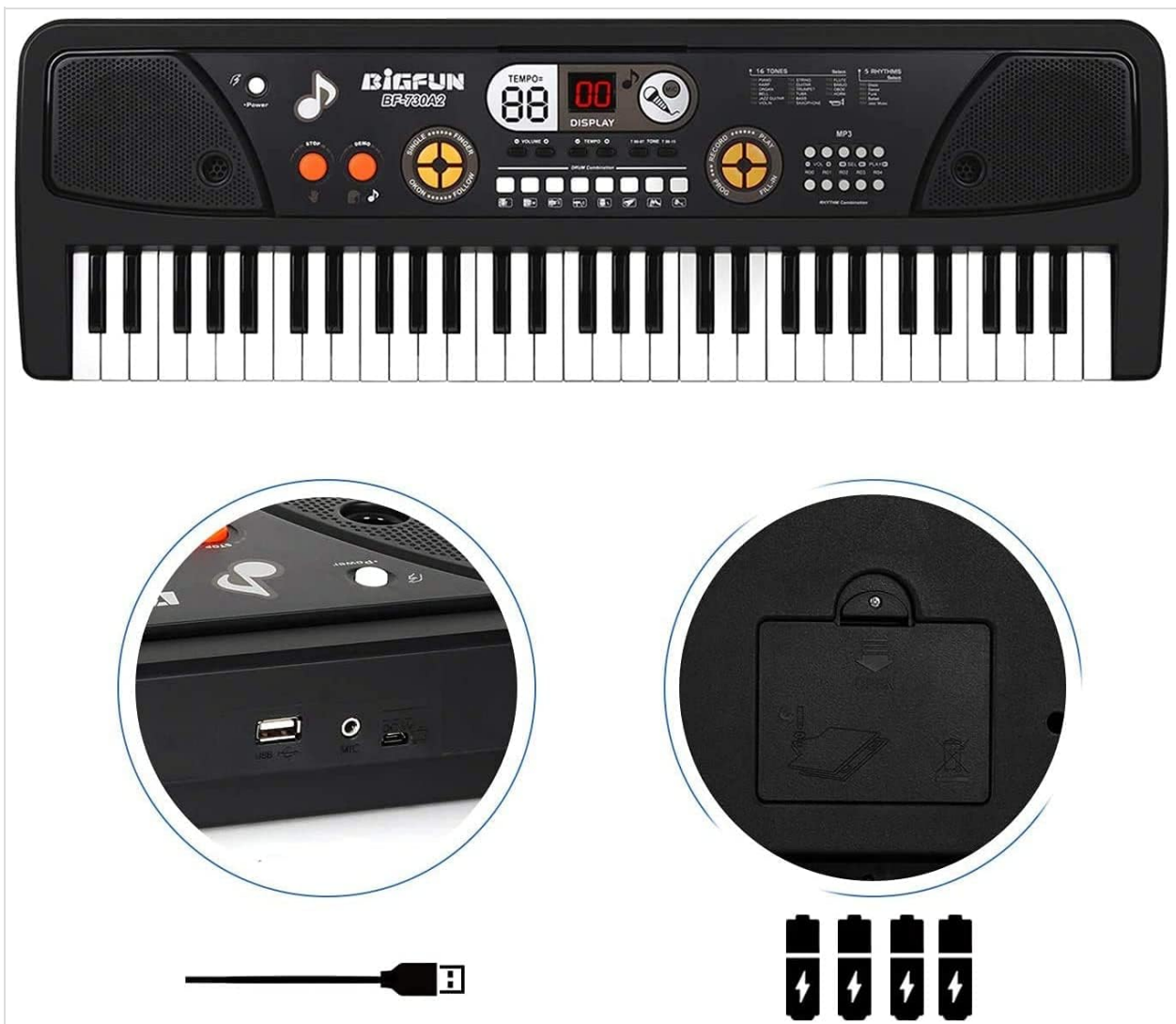
Image 5.1: The keyboard's power input port and battery compartment for 4 AA batteries.