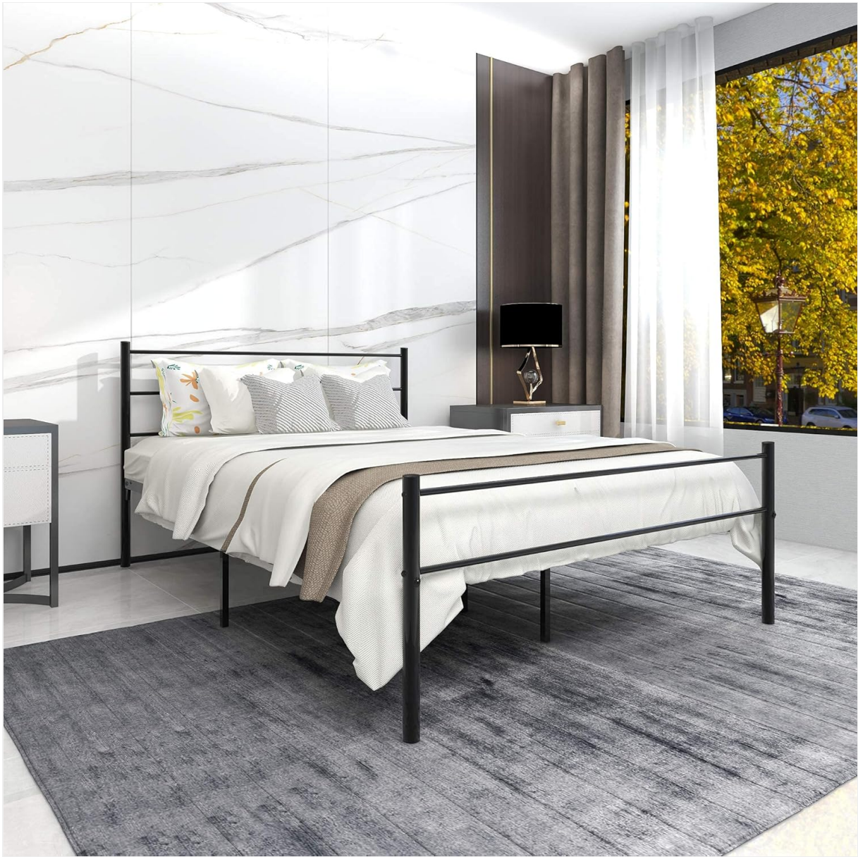
Image: Fully assembled BOFENG Full Size Metal Bed Frame, black, with an industrial-style headboard, shown in a modern bedroom with a mattress and bedding.