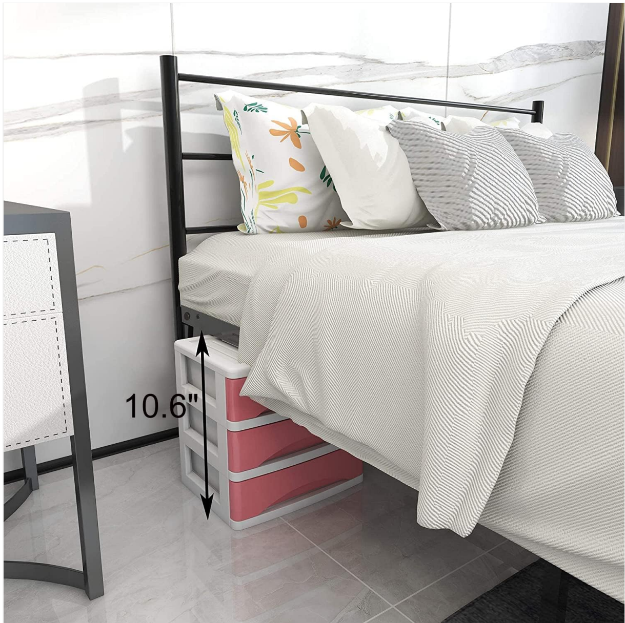
Image: A side view of the bed frame illustrating the 10.6-inch clearance beneath, with small storage drawers placed in the space.