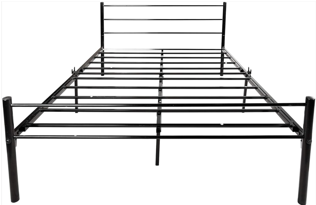
Image: Disassembled BOFENG Full Size Metal Bed Frame, showing the headboard, footboard, side rails, and support slats, ready for assembly.