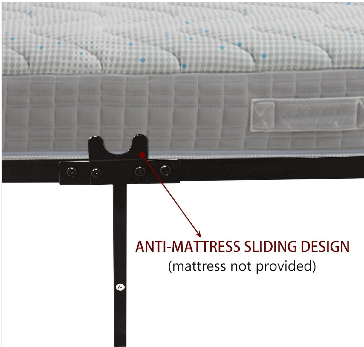
Image: Detail of the anti-mattress sliding design, a small raised edge on the bed frame's side rail, intended to keep the mattress in place.