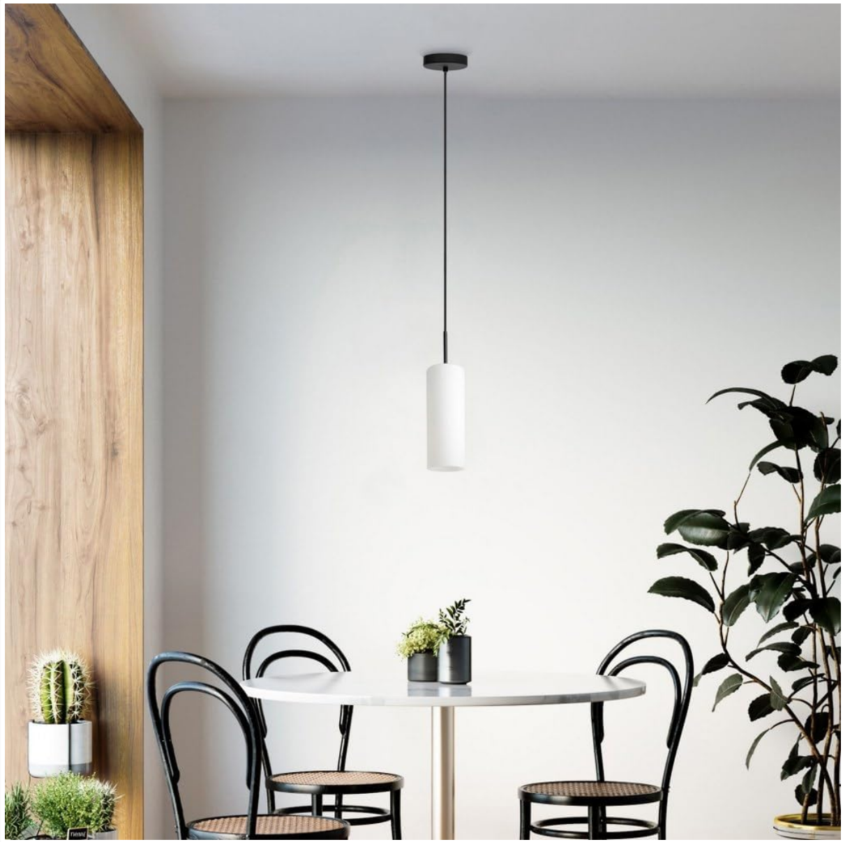
Image 2: The EGLO Troy 3 Pendant Light elegantly installed above a dining table, illustrating its aesthetic appeal in a home setting.