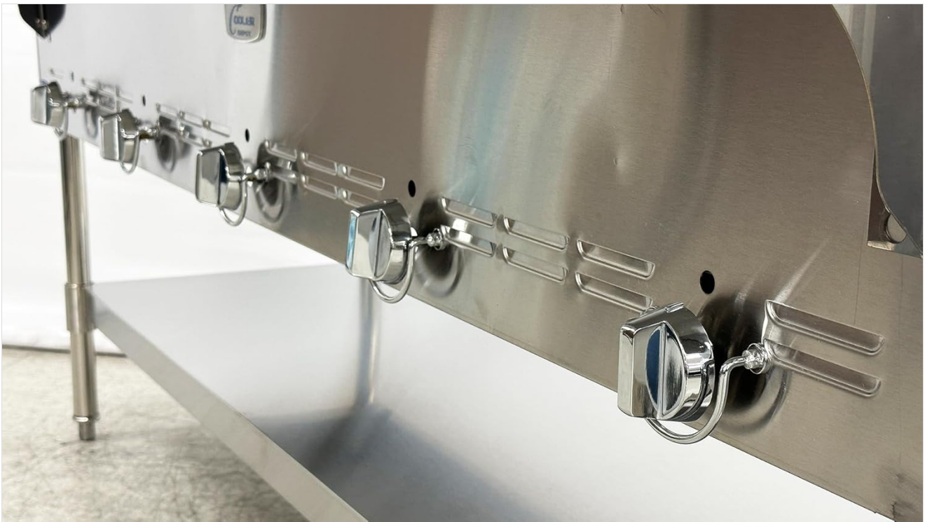
Image 5: Control knobs for individual well temperature adjustment.