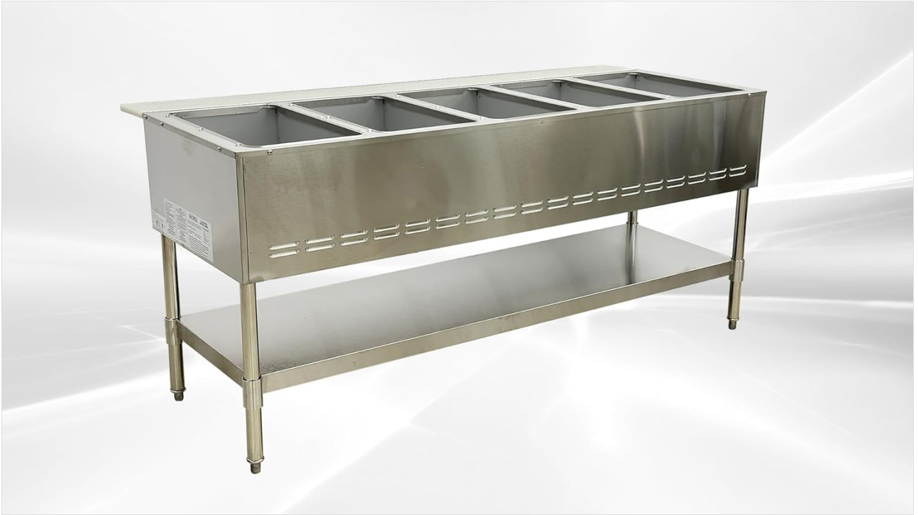
Image 1: Side view of the steam table warmer with undershelf and legs.

Attach the four legs to the bottom of the steam table. Ensure they are securely fastened. Install the undershelf onto the legs at the desired height. The cutting board is designed to fit securely on the side of the unit.