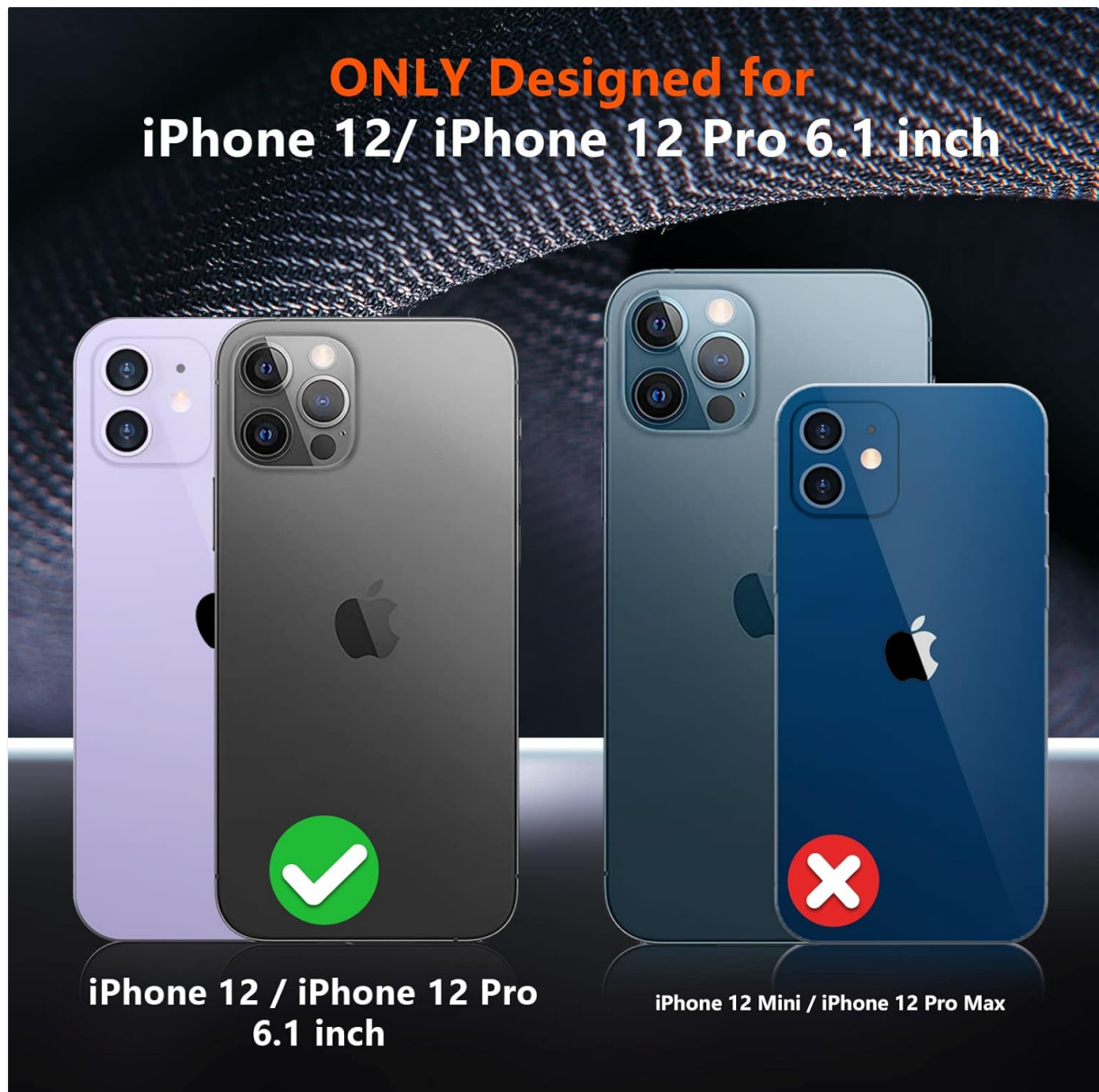
Image: A visual guide indicating that the case is designed exclusively for iPhone 12 and iPhone 12 Pro (6.1 inch models), and is not compatible with iPhone 12 Mini or iPhone 12 Pro Max.