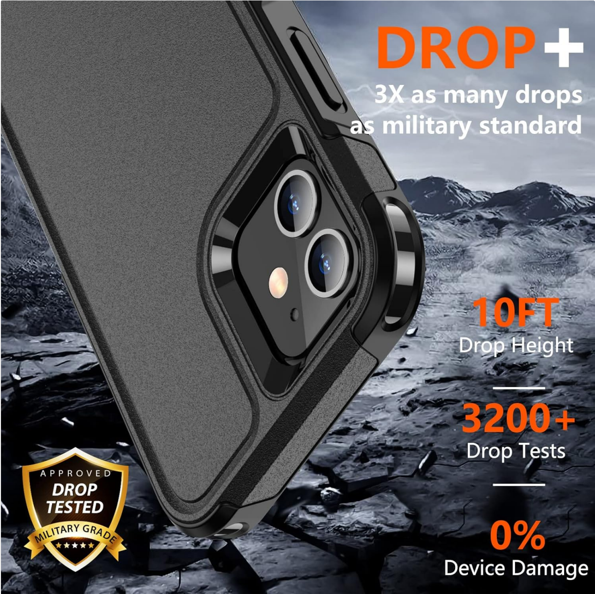
Image: A graphic demonstrating the case's military-grade drop protection, indicating it withstands 3X more drops than military standard from a 10-foot height, with over 3200 drop tests resulting in 0% device damage.