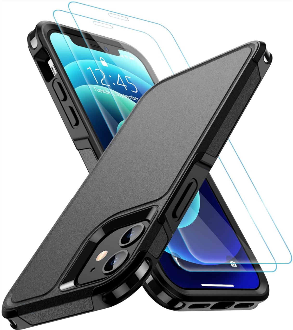
Image: The SPIDERCASE protective case for iPhone 12/12 Pro, shown with two included tempered glass screen protectors.