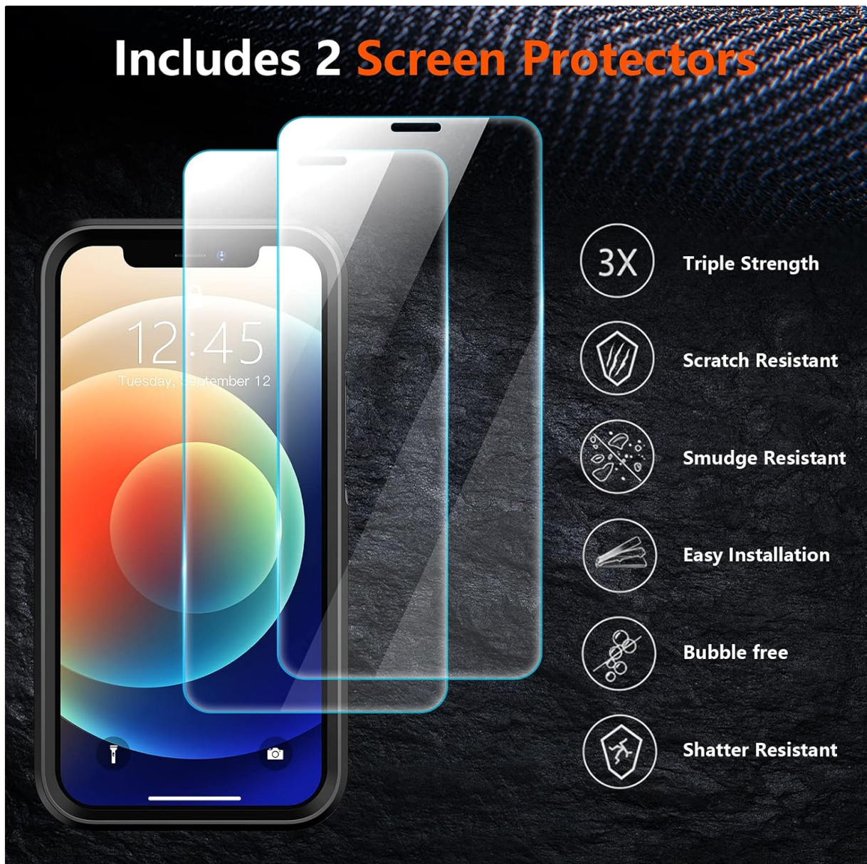
Image: A visual representation of the two tempered glass screen protectors included with the case, highlighting features such as triple strength, scratch resistance, smudge resistance, easy installation, bubble-free application, and shatter resistance.