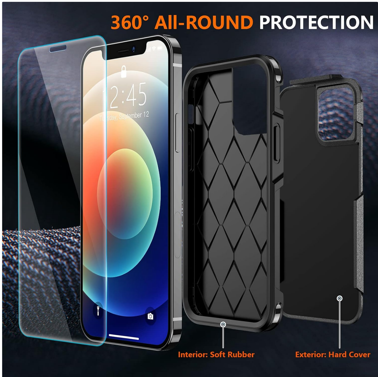
Image: An exploded diagram illustrating the dual-layer design of the SPIDERCASE, consisting of a soft rubber interior and a hard outer cover, alongside the tempered glass screen protector.