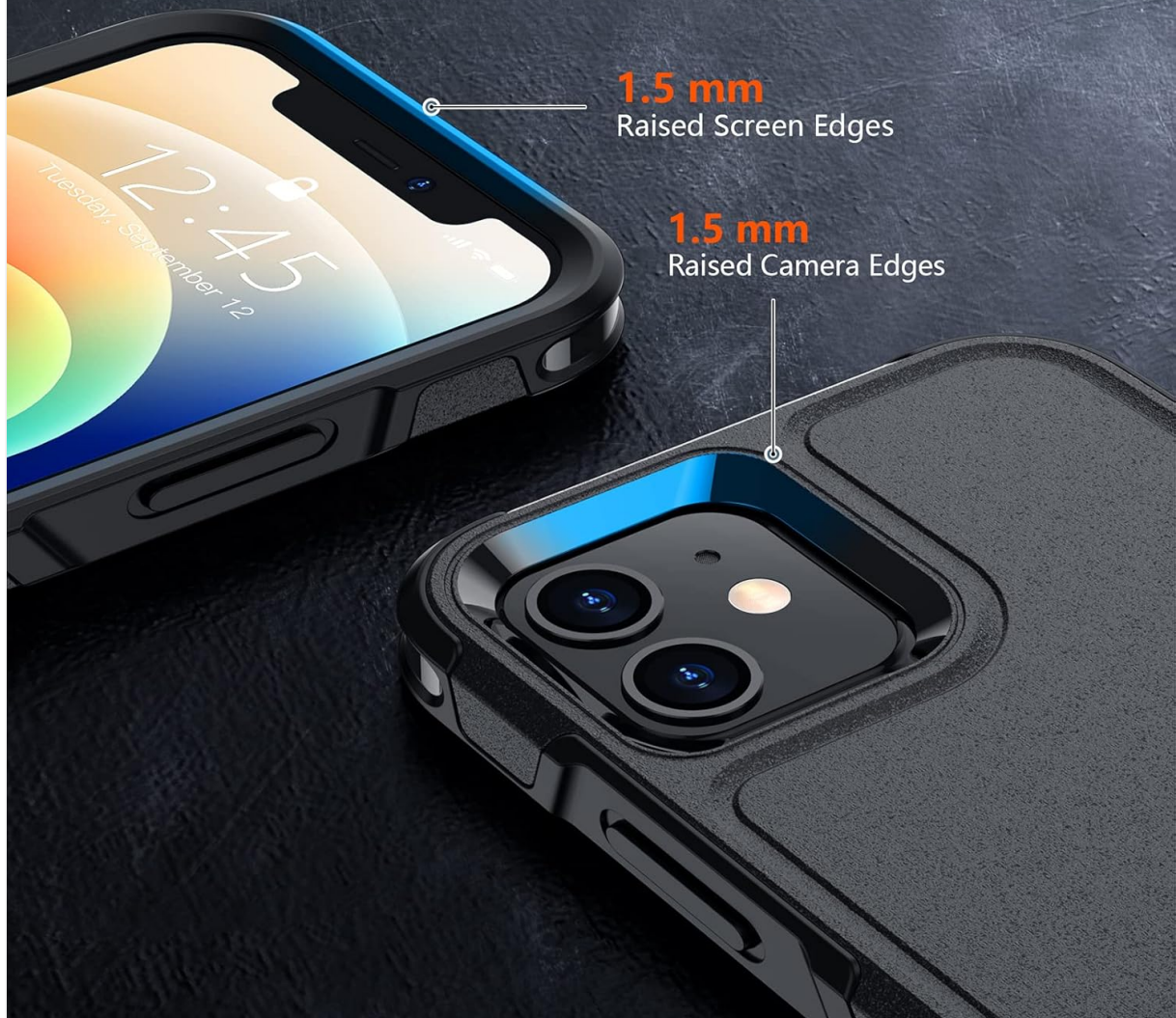
Image: A detailed view of the case highlighting the 1.5mm raised edges around both the screen and camera, designed to protect against scratches and impacts.