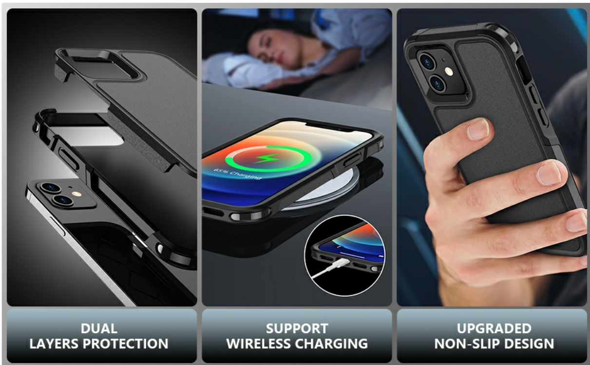
Image: A composite image highlighting the case's dual-layer protection, its compatibility with wireless charging, and its upgraded non-slip design.