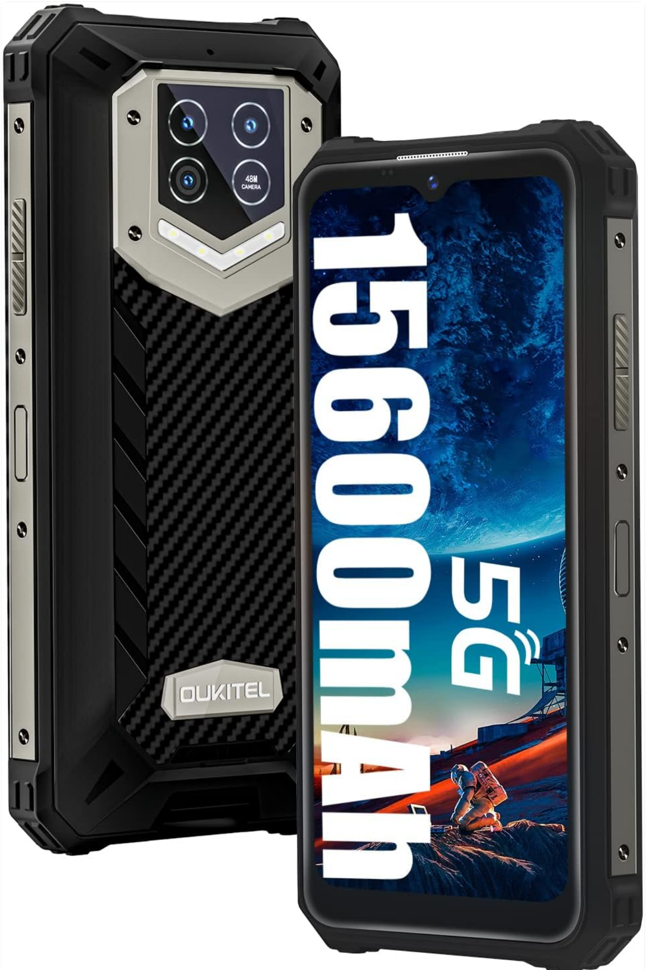
Figure 1: OUKITEL WP15 5G Rugged Smartphone, showcasing its robust design and large battery capacity.