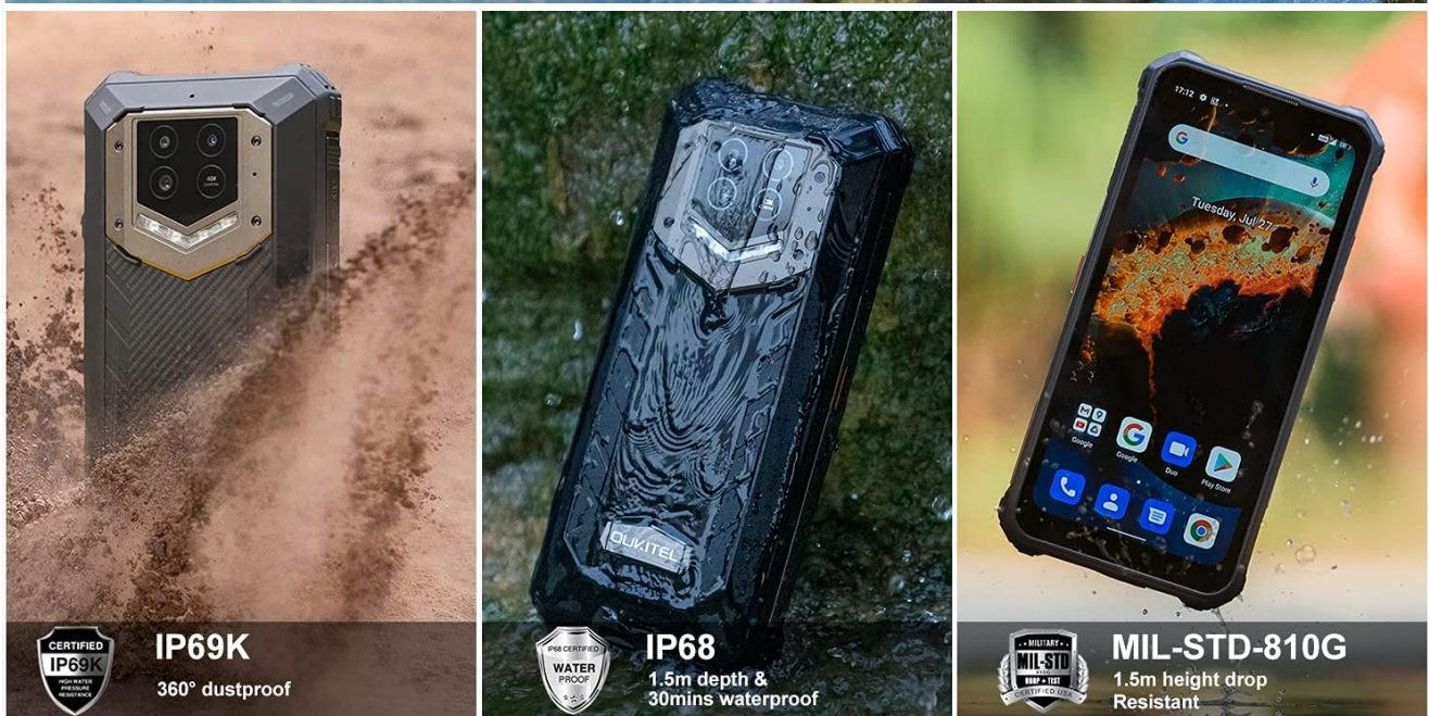
Figure 8: The OUKITEL WP15 demonstrating its IP68, IP69K, and MIL-STD-810G certifications for water, dust, and drop resistance.

With IP68, IP69K, MIL-STD-810G Certification