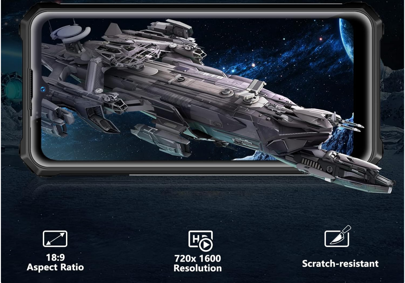
Figure 6: The 6.52-inch HD+ full view screen of the OUKITEL WP15, featuring Corning Gorilla Glass for enhanced durability.