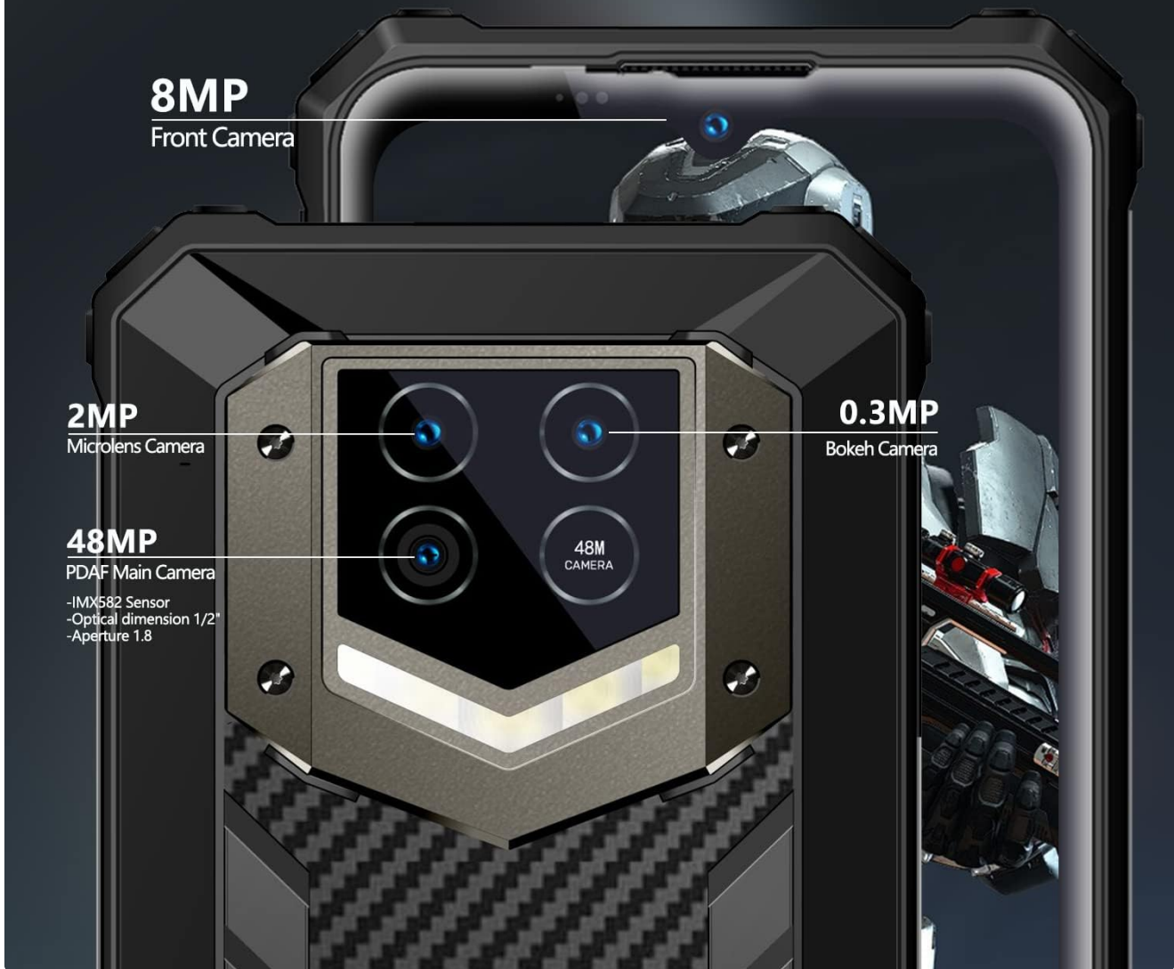
Figure 5: Detailed view of the OUKITEL WP15's 48MP triple camera setup, including macro and Bokeh lenses.