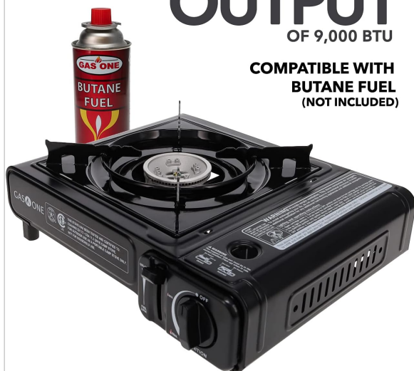
Image: Premium design elements including the 8oz butane fuel compatibility, automatic safety shut-off, and built-in cartridge ejection system.

COMPATIBLE WITH BUTANE FUEL (NOT INCLUDED)