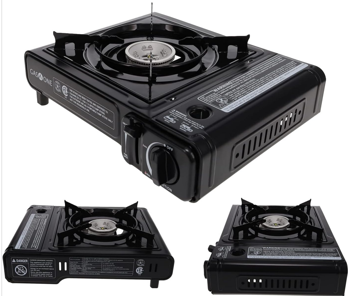
Image: Detailed dimensions and weight of the Gas One GS-3000 Portable Butane Gas Stove.