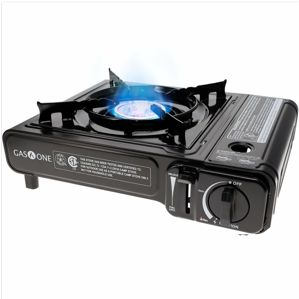
Image: The Gas One GS-3000 Portable Butane Gas Stove, showcasing its compact design and burner.