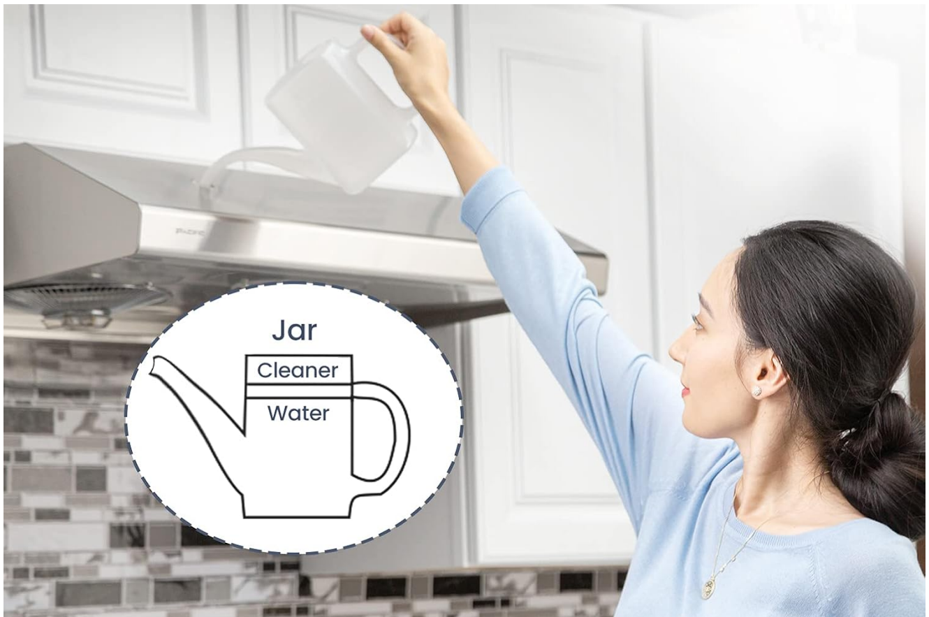
Figure 4: A user demonstrating the process of adding cleaning solution to the range hood for the auto-clean function.

consult the troubleshooting section or contact customer support.