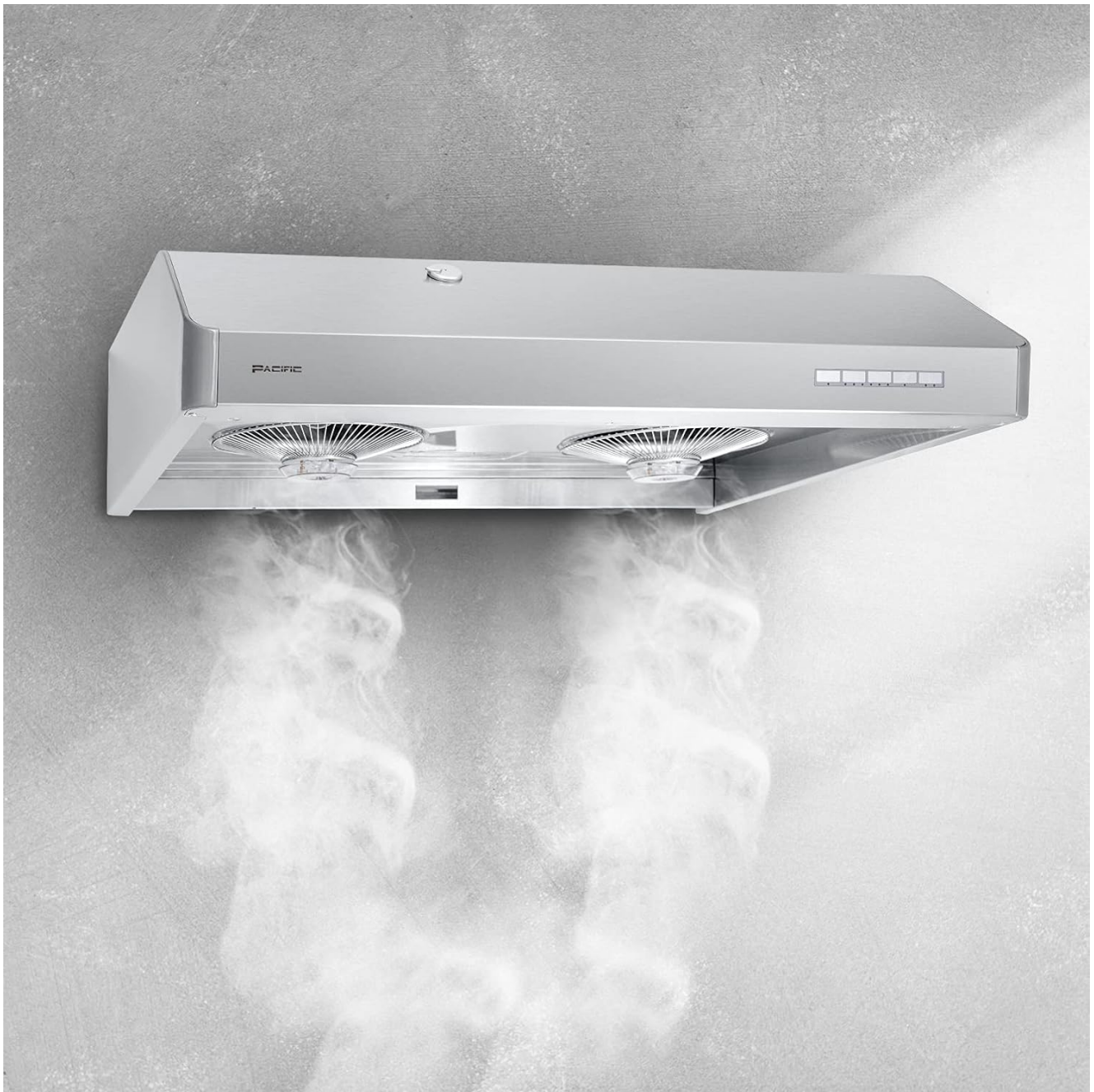
Figure 3: The range hood in operation, demonstrating its effectiveness in capturing and removing cooking steam and odors.

short period after cooking, ensuring all odors and steam are cleared before automatically shutting down.