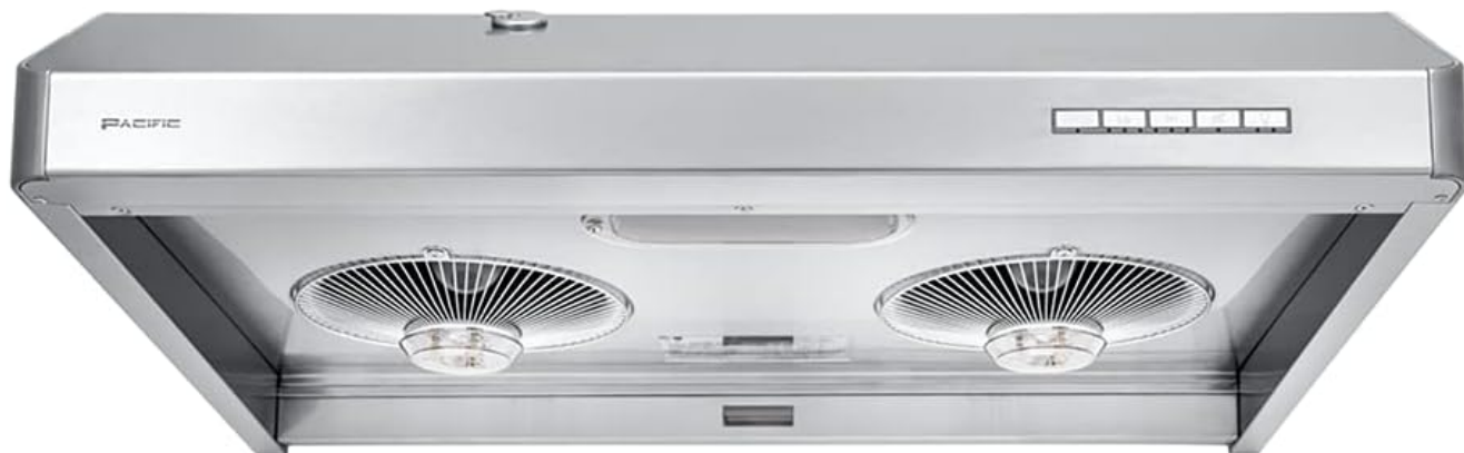
Figure 2: Underside view of the range hood, highlighting the two powerful fans and the central LED light fixture.