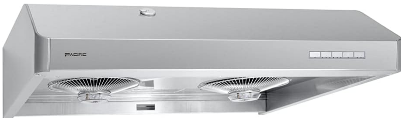
Figure 1: Front view of the Pacific Auto Clean Range Hood. This image shows the overall design and the control panel on the right side.