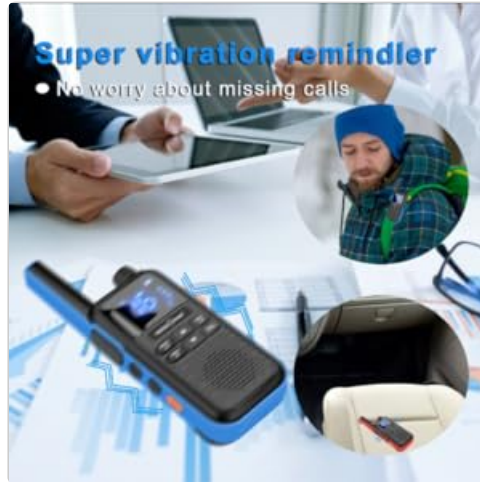
Image: The SOCOTRAN T82 walkie talkie on a desk, with visual cues indicating vibration, highlighting the "Super vibration reminder" feature.