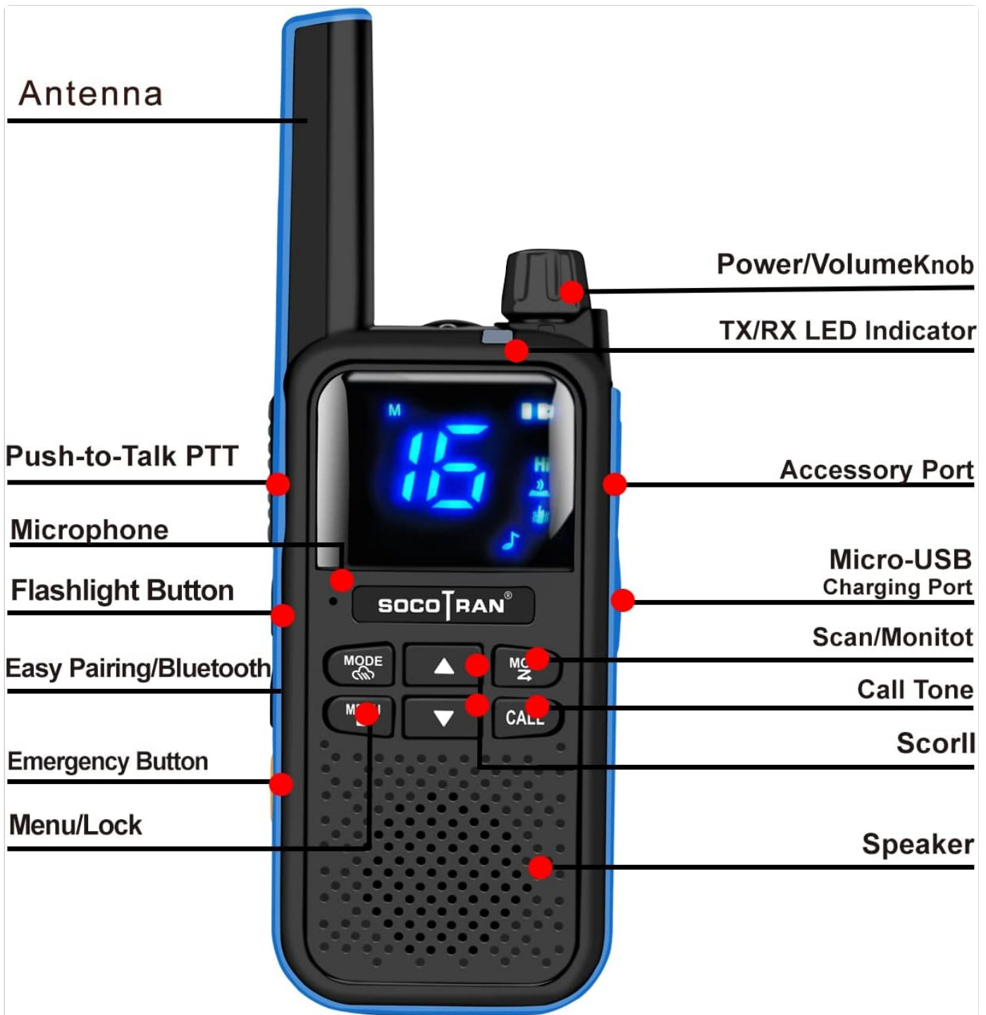
Image: Front view of the SOCOTRAN T82 Walkie Talkie with key components labeled, including Antenna, Power/Volume Knob, TX/RX LED Indicator, Push-to-Talk (PTT) button, Accessory Port, Microphone, Flashlight Button, Micro-USB Charging Port, Easy Pairing/Bluetooth button, Scan/Monitor button, Call Tone button, Emergency Button, Menu/Lock button, and Speaker.