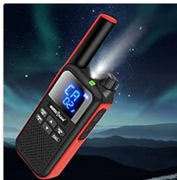
Image: The SOCOTRAN T82 walkie talkie in a dark outdoor setting, with its flashlight beam visible, demonstrating the flashlight function.