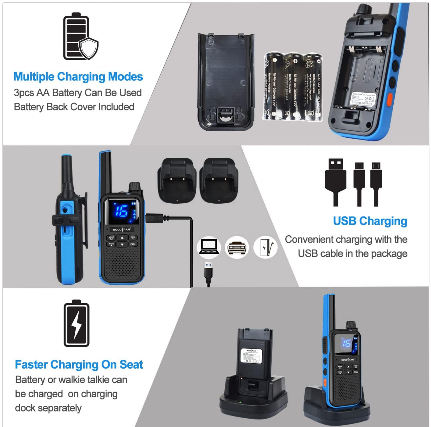
Image: A visual guide demonstrating how to install the Li-ion battery or 3 AA batteries into the SOCOTRAN T82 walkie talkie, along with illustrations of USB cable charging and dock charger usage.

The T82 walkie talkie uses a rechargeable Li-ion battery. It can also be powered by 3 AA batteries (not included) as an alternative.