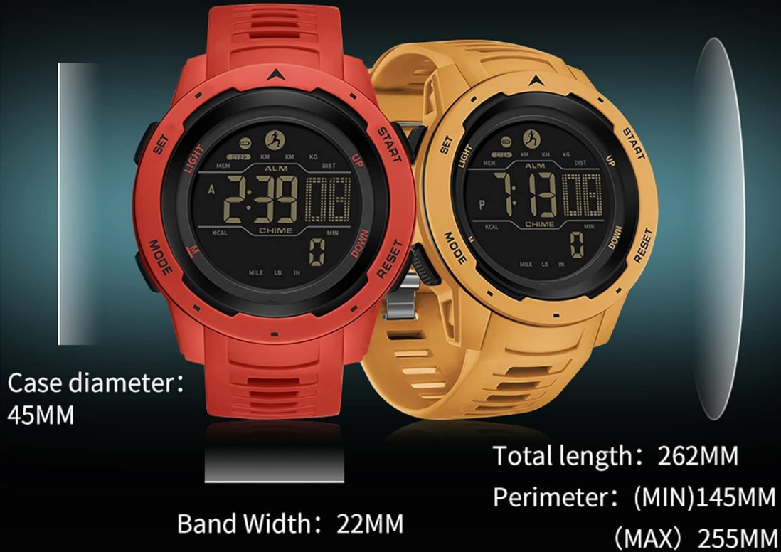
Image: A detailed diagram illustrating the physical dimensions of the watch, including case diameter, total length, and band width.