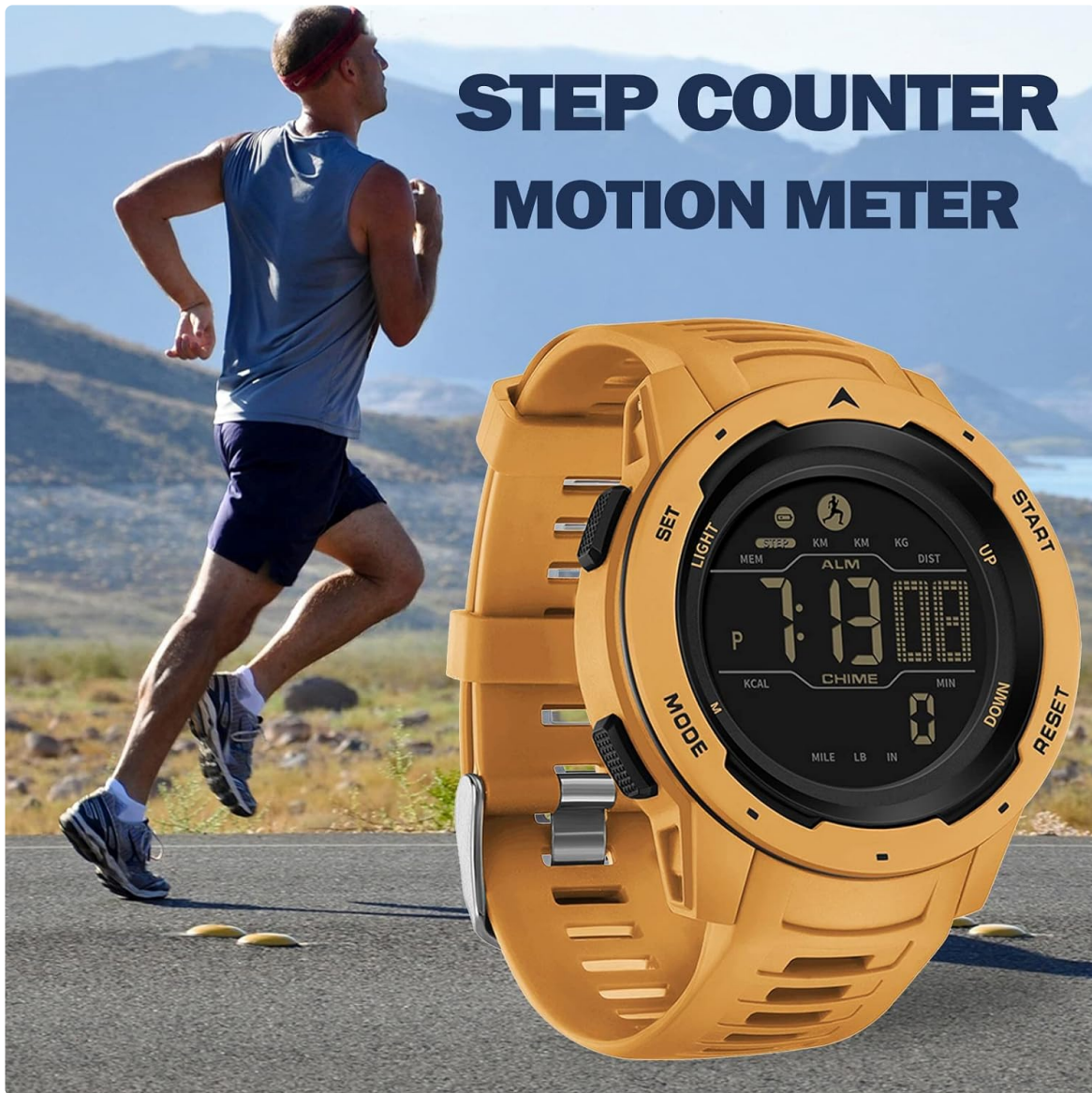
Image: The watch face with labels indicating the functions of each button for easy setup and navigation.