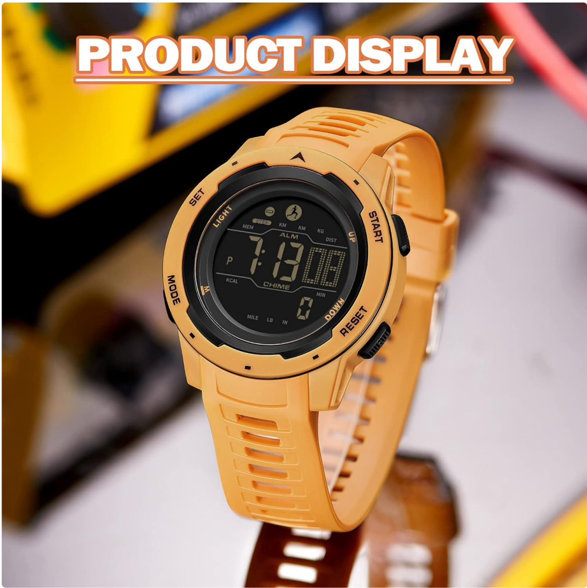
Image: A visual representation of the watch's activity tracking capabilities, showing steps, distance, and calories.