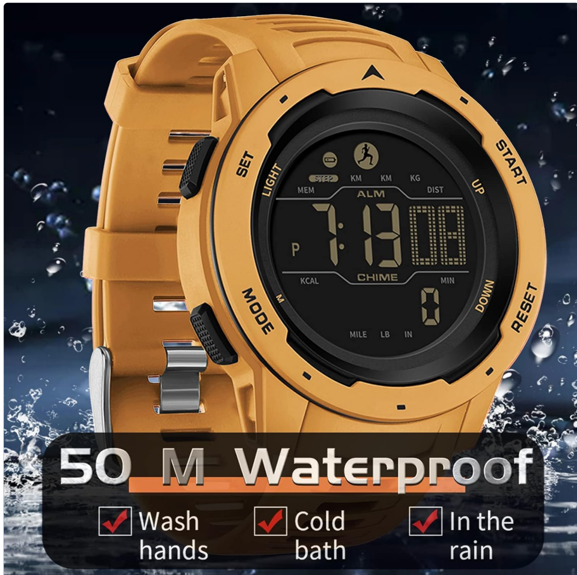
Image: The watch being splashed with water, visually confirming its 50-meter water resistance for daily use and swimming.