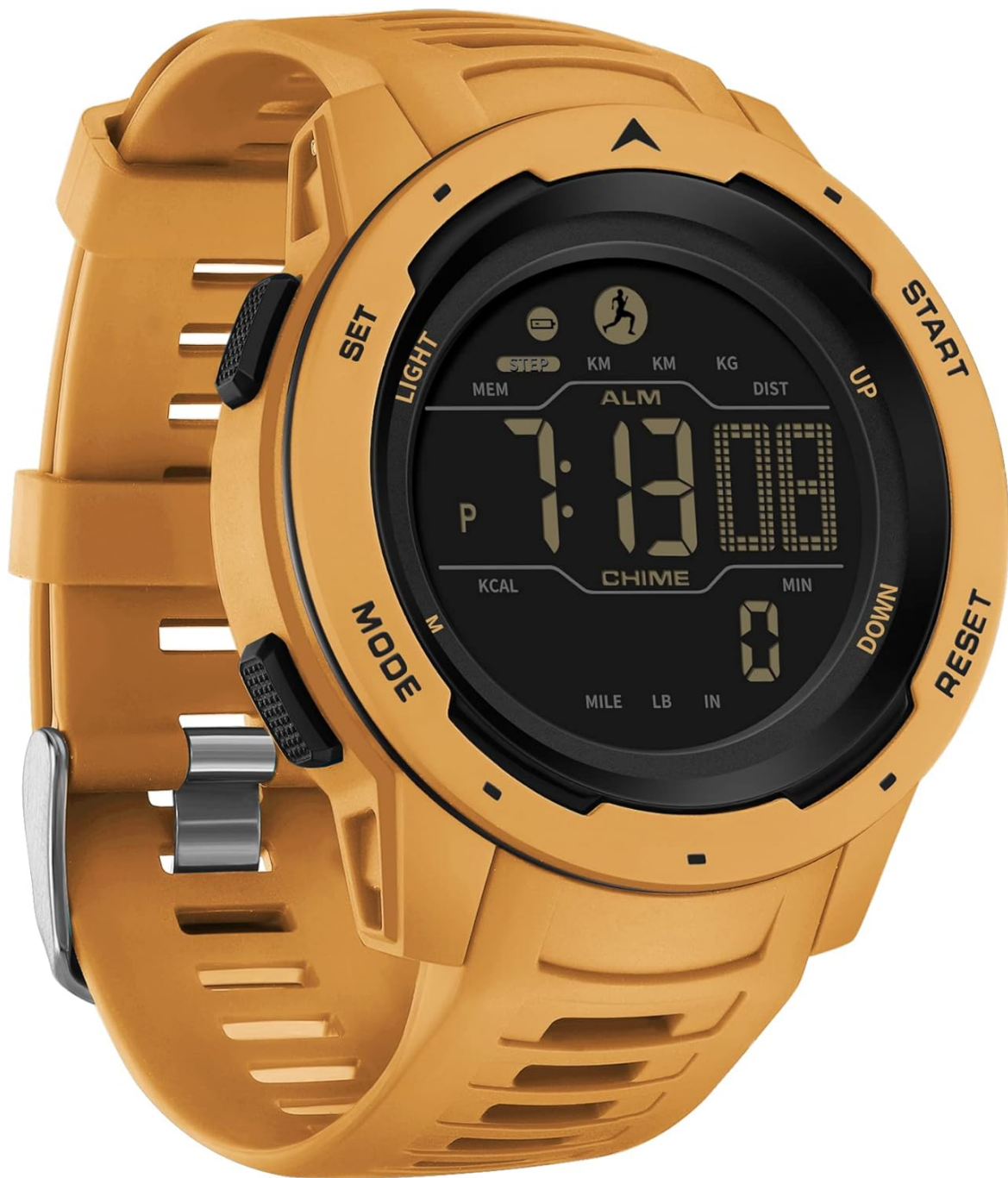
Image: The findtime Men's Digital Watch in yellow, showcasing its design and digital display.