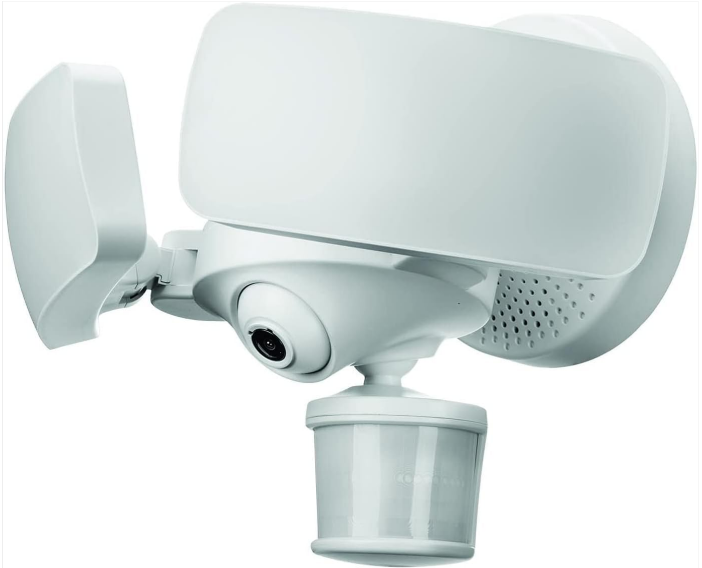
Figure 4.1: Front view of the KUNA New SE Camera Floodlight, showing the camera lens and LED light panels.