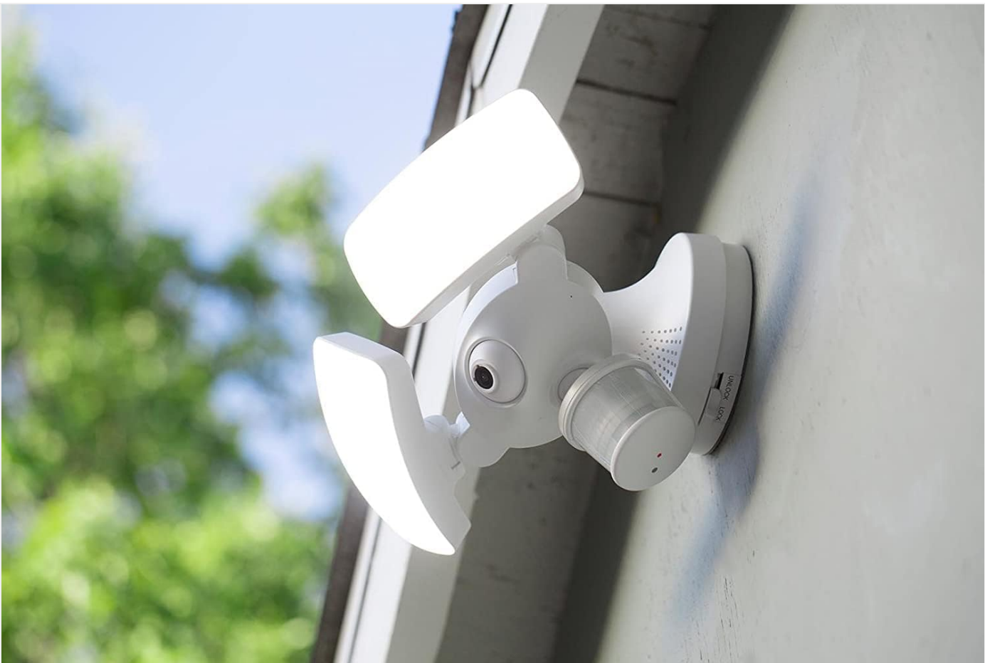
Figure 5.4: The floodlight installed and illuminated, demonstrating its lighting capability.