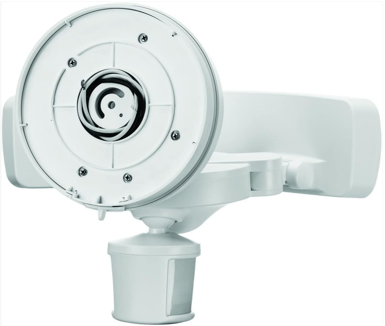
Figure 5.2: Underside view of the floodlight, showing the wiring compartment and connection points.