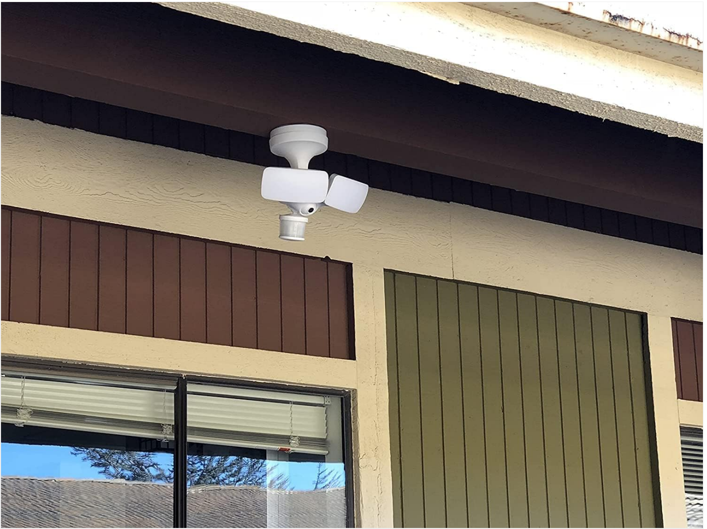
Figure 5.5: The floodlight mounted under an eave, showing a common installation scenario.