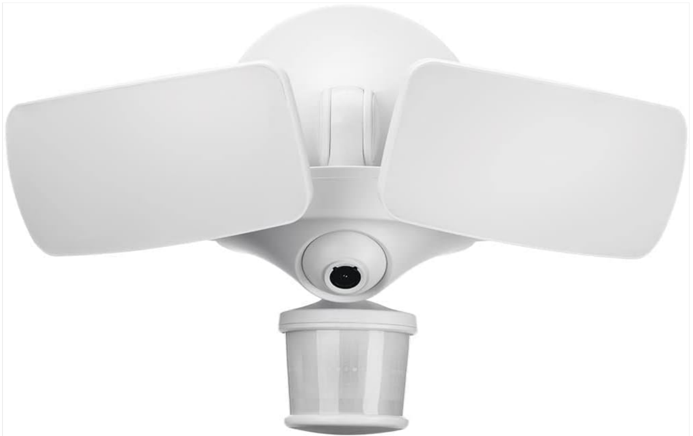
Figure 4.2: Frontal view of the floodlight, highlighting the central camera and the motion sensor below.