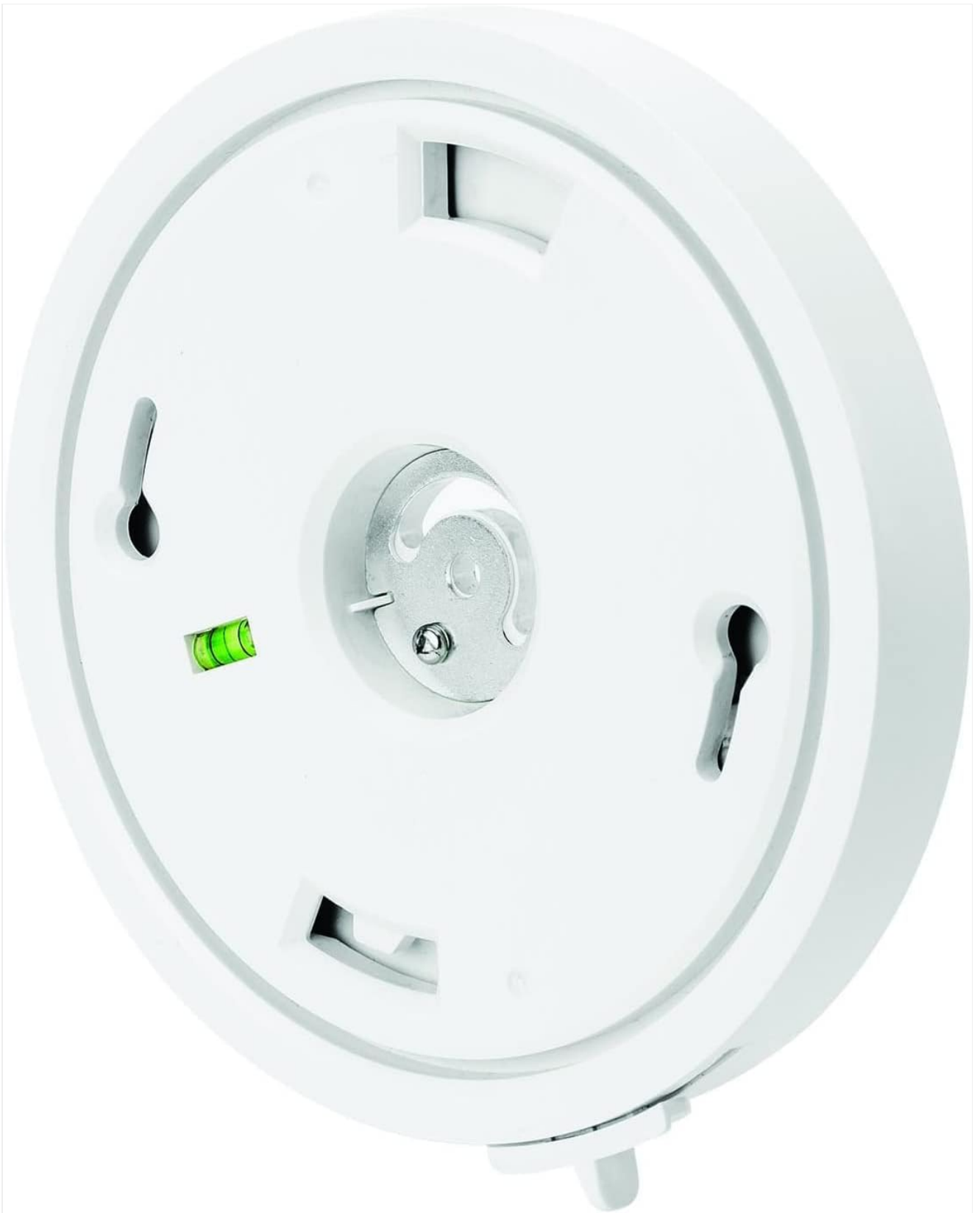
Figure 5.1: Rear view of the floodlight's mounting base, showing the attachment points and integrated level.