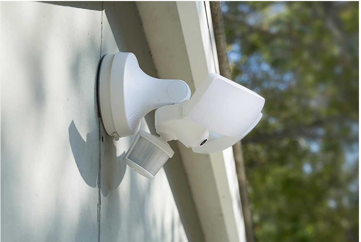
Figure 5.3: KUNA New SE Camera Floodlight installed on an exterior wall, providing illumination and surveillance.