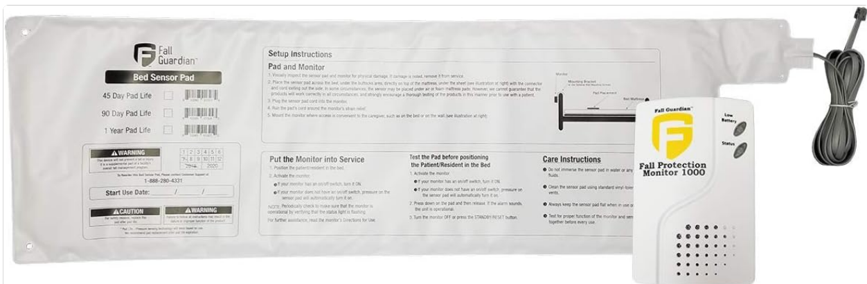
Image 1: The Fall Guardian 1000 Monitor and Bed Sensor Pad, illustrating the complete system.

The Fall Protection Monitor 1000 is always active once a battery is installed and features a status light and a low battery indicator for continuous monitoring.