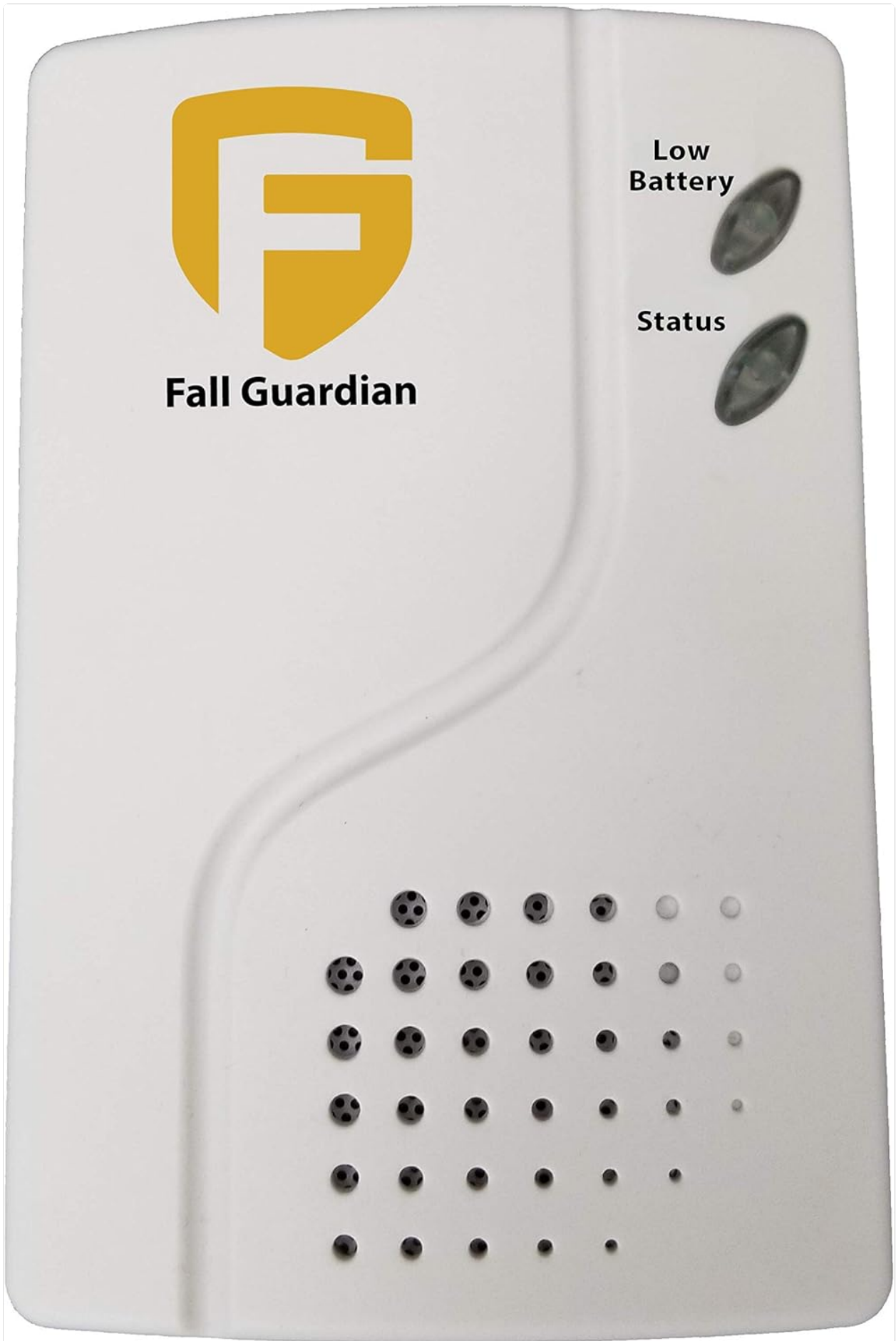
Image 3: Close-up view of the Fall Guardian 1000 Monitor, highlighting the status and low battery indicators.