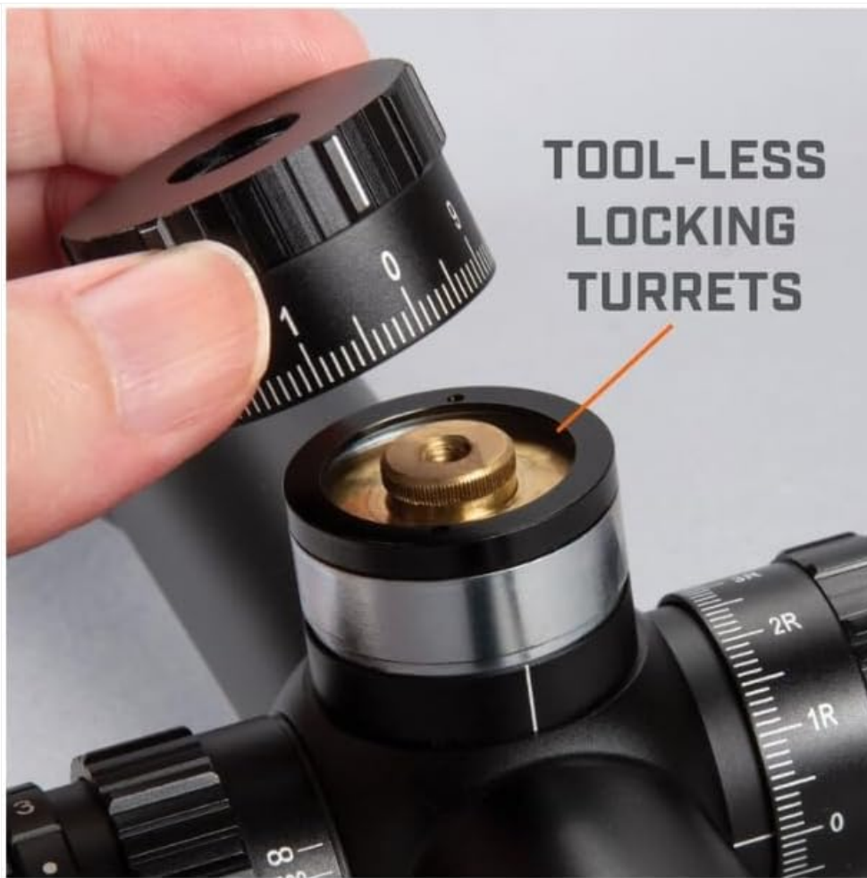
Figure 3: Demonstrating the tool-less turret reset feature for quick zeroing.