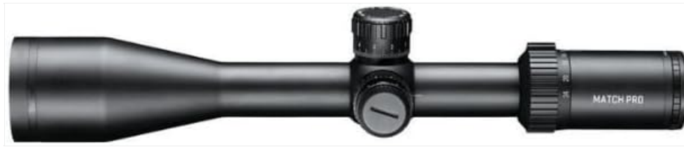
Figure 2: Side view of the Match PRO Rifle scope, highlighting its robust construction.

Your browser does not support the video tag.