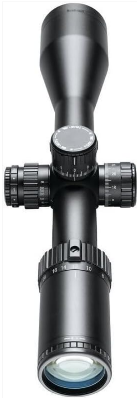
Figure 1: Top-down view of the Bushnell Match PRO 6-24X50 Riflescope.