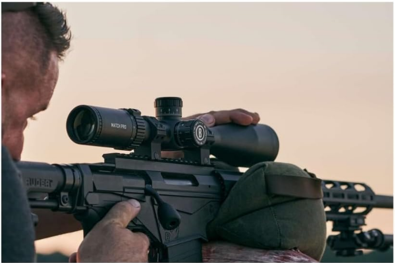
Figure 5: A shooter utilizing the Match PRO riflescope on a rifle.