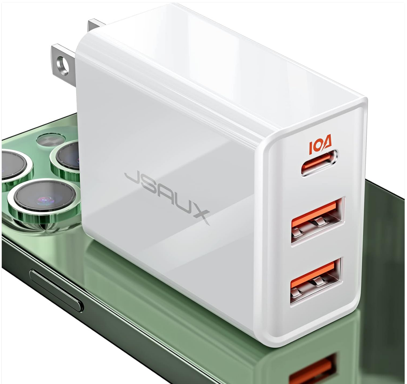
Image: The JSAUX 32W 3-Port USB Wall Charger, displaying its single USB-C port and two USB-A ports on the front face.