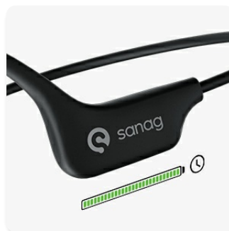
Figure 4.1: Charging the Sanag A5S Headphones

A fully charged battery provides up to 8 hours of continuous use or 300 hours of standby time.