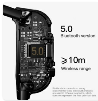
Figure 4.2: Bluetooth 5.0 Connectivity

The headphones will automatically attempt to reconnect to the last paired device when powered on.