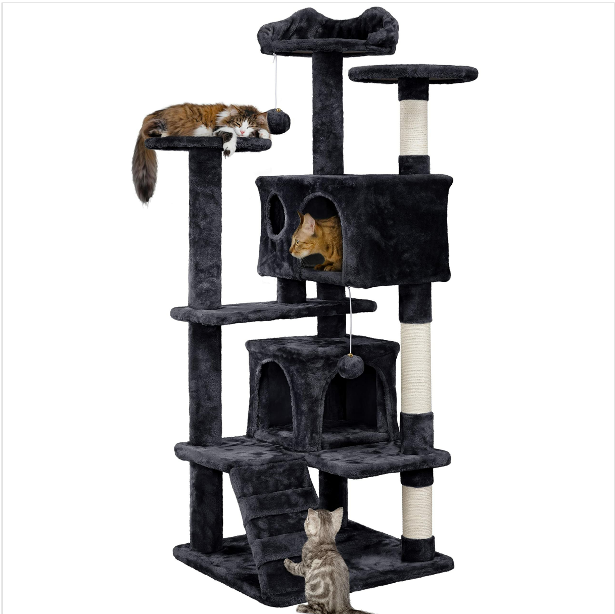
Image: The Yaheetech 54in Black Cat Tree Tower Condo, showcasing its multi-level design and various features, with three cats interacting with different parts of the tree.