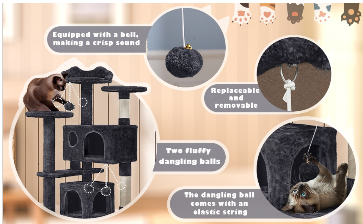
Image: A diagram detailing the dangling toy balls, highlighting their bell feature and showing that they are replaceable, encouraging interactive play.