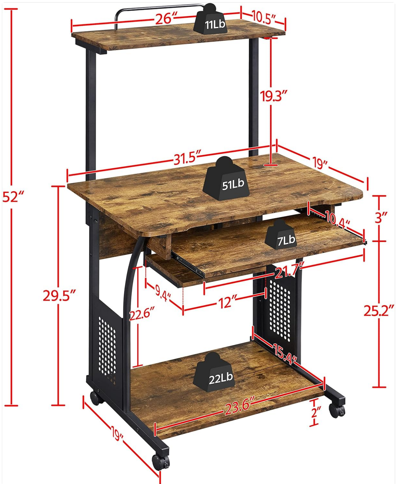
Image 9.1: Detailed dimensions of the computer desk, including height, width, and depth of various sections.