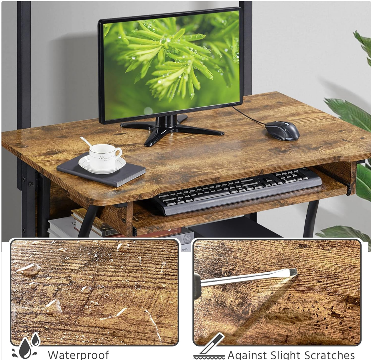
Image 7.1: Visual representation of the desk's waterproof and scratch-resistant properties.