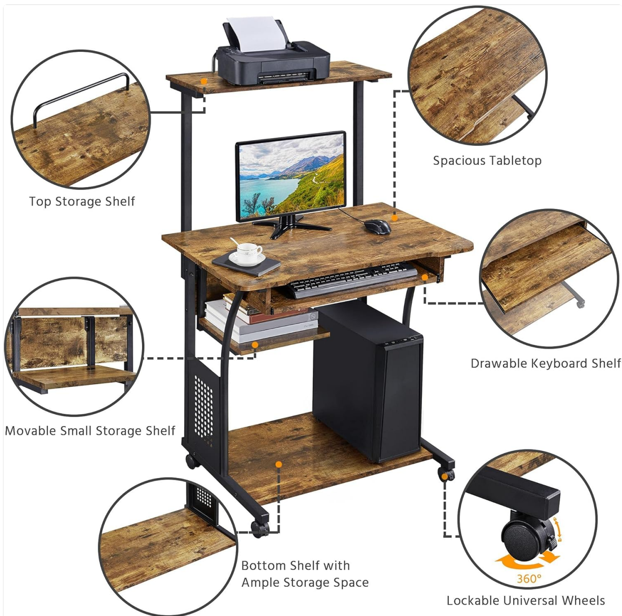
Image 3.1: Exploded view illustrating the various components of the desk, including the main tabletop, shelves, frame, and keyboard tray.