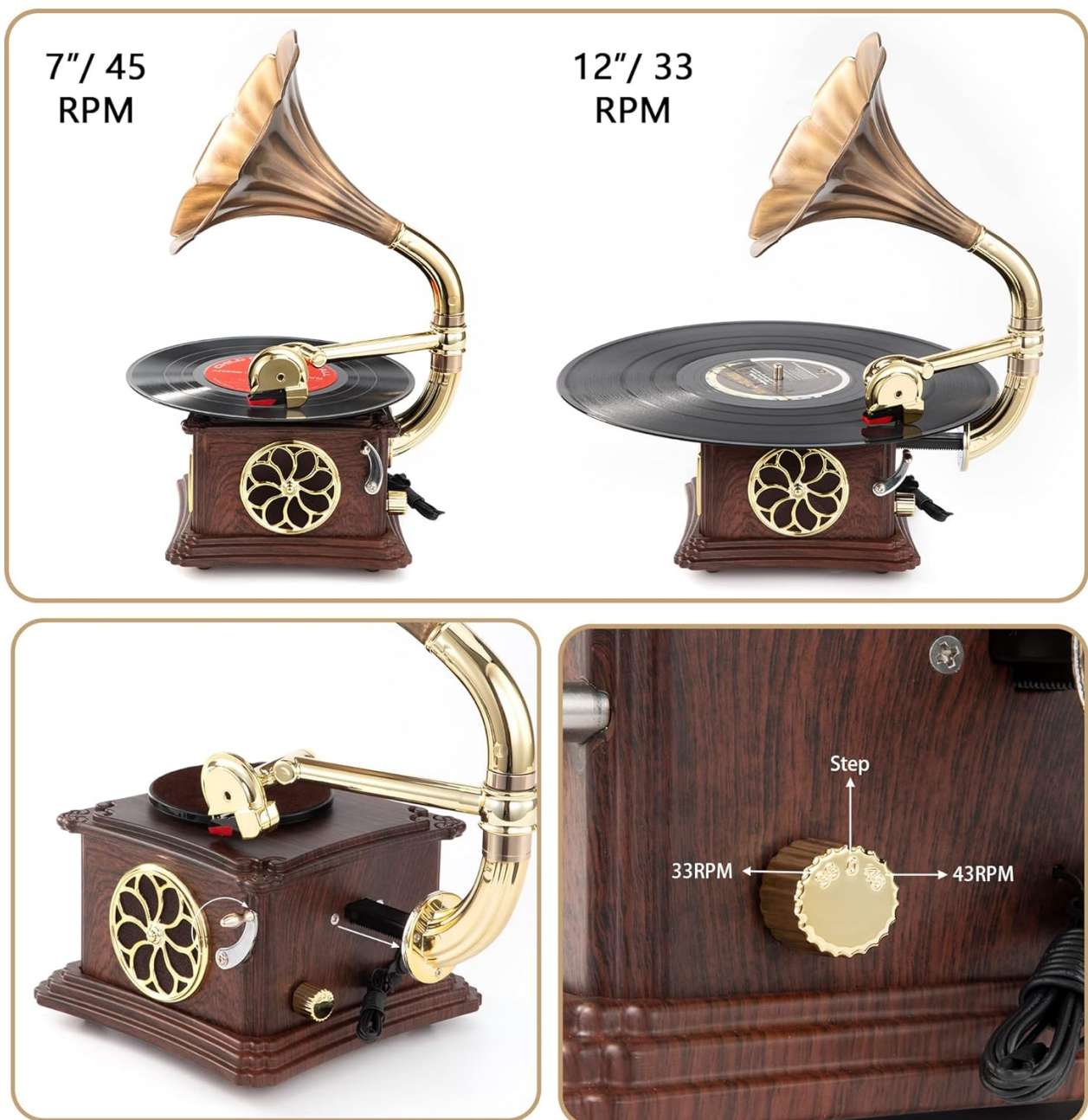
Figure 4: Illustration of record sizes and corresponding RPM settings.