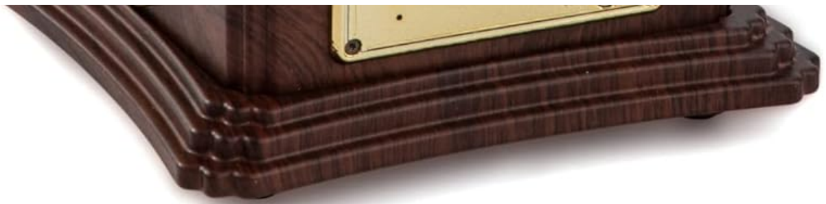
Figure 1: Overall view of the MEAGEAL VS-1727 Record Player.