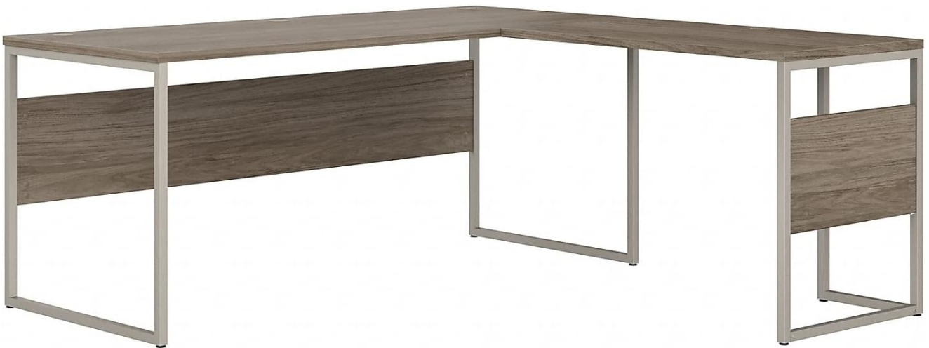
Image 1.1: The Bush Business Furniture Hybrid L Shaped Table Desk in Modern Hickory finish.

This manual provides essential information for the assembly, operation, and maintenance of your Bush Business Furniture Hybrid L Shaped Table Desk. Please read these instructions carefully before beginning assembly and retain them for future reference. This desk is designed to provide a durable and functional workspace for home or office environments.