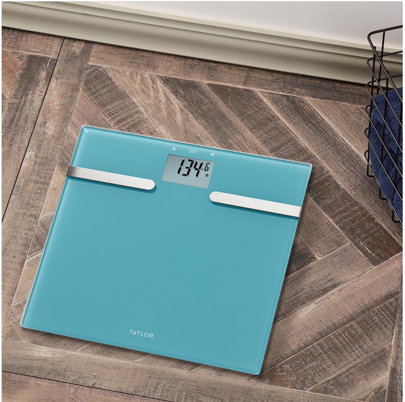
Image: The Taylor digital bathroom scale positioned on a wooden floor, ready for use.