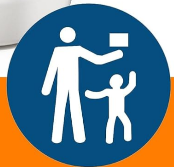
Image: A visual warning about button cell batteries, showing different sizes of button cell batteries and a graphic indicating keeping them away from children.