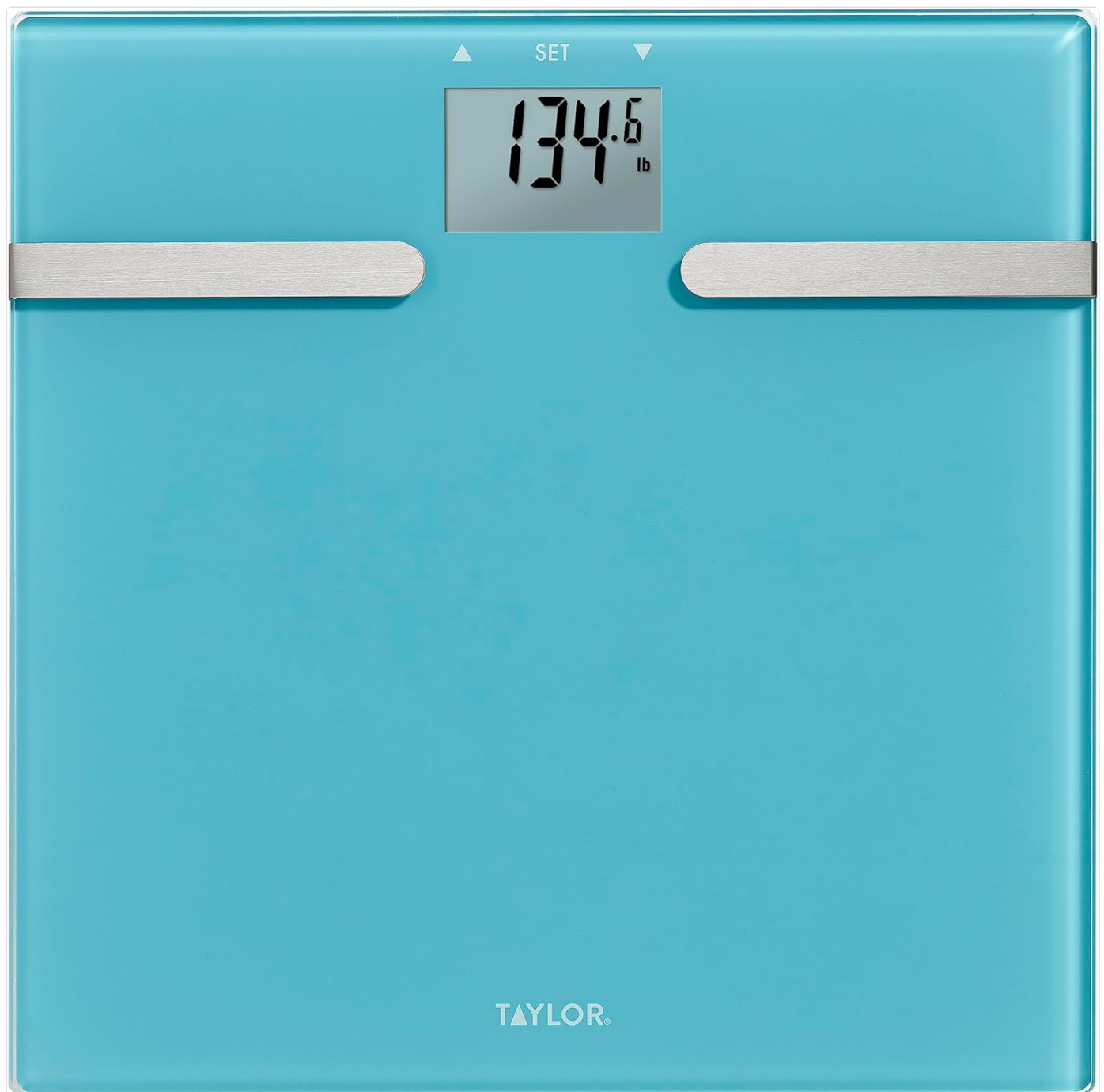
Image: The Taylor digital bathroom scale showing a weight reading on its display.

To measure your weight only, simply step onto the scale with both feet. The scale will automatically turn on and display your weight. Remain still until the reading stabilizes. The scale will automatically turn off after a few seconds of inactivity.