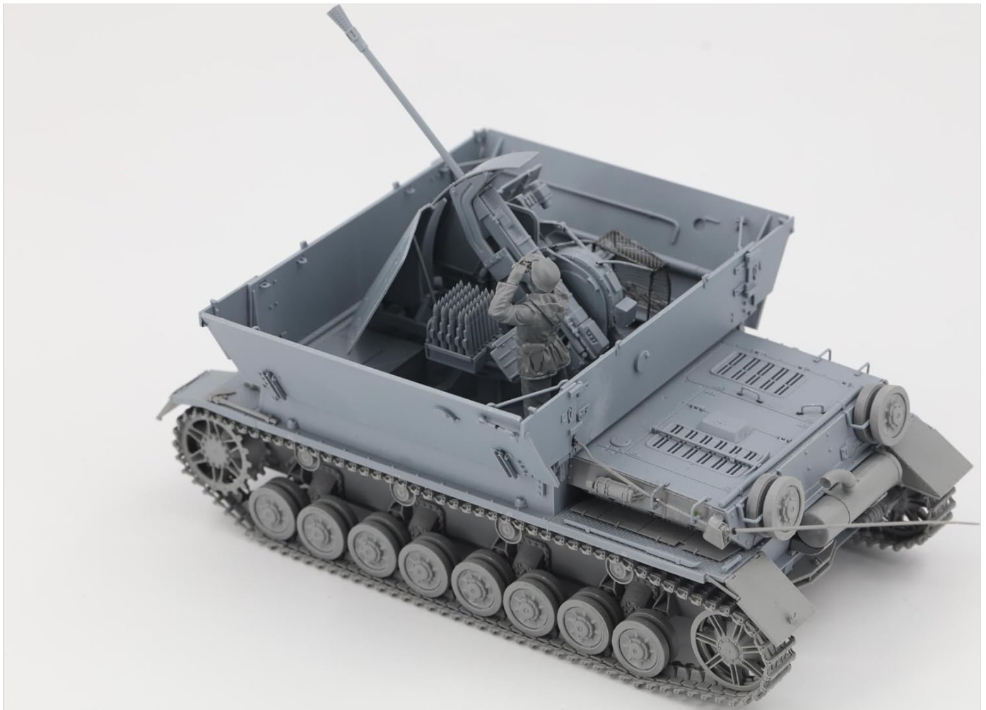
Image: Top-down view of the assembled Möbelwagen model, showcasing the detailed fighting compartment and gun.