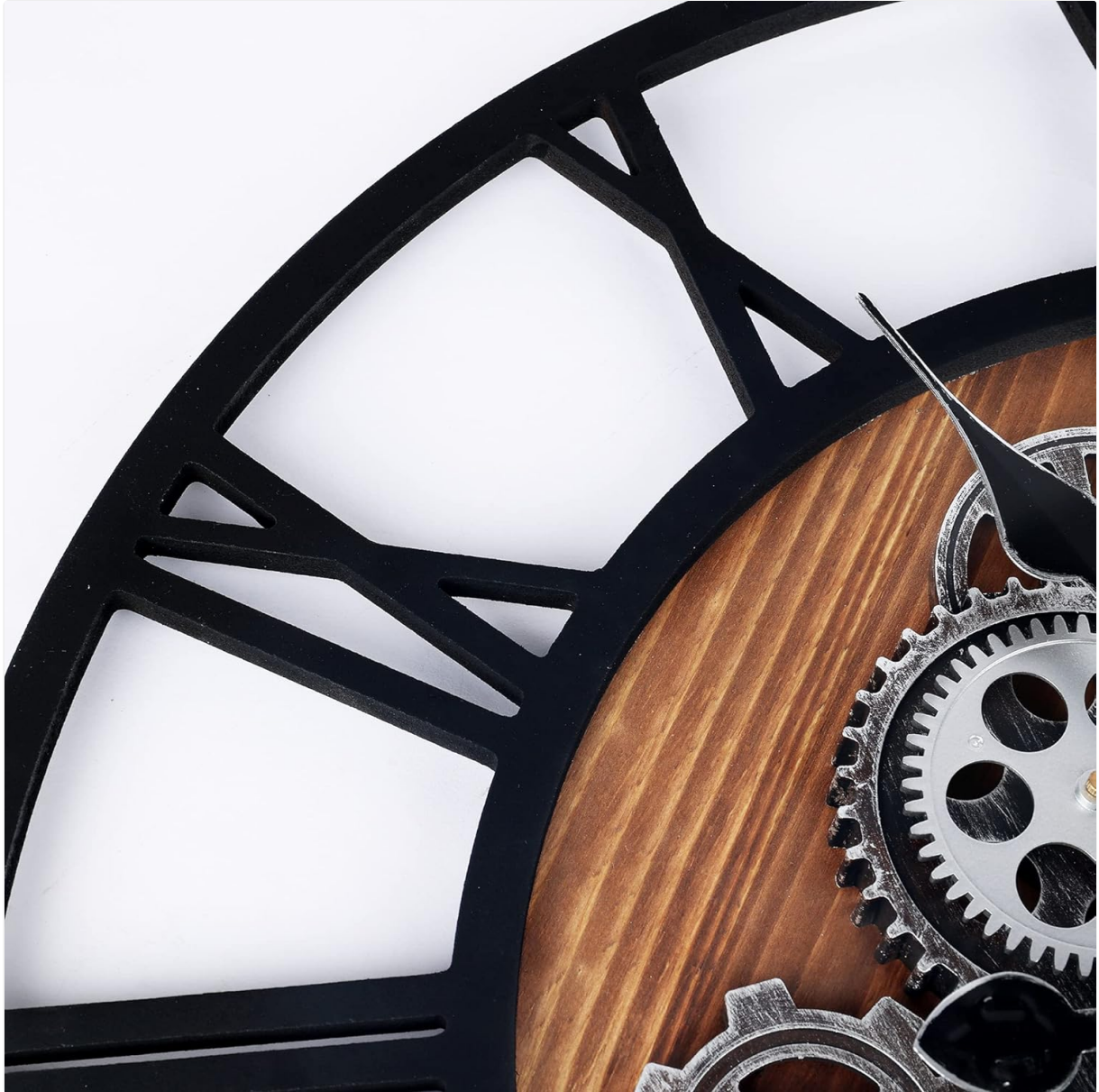
Image: Close-up of the intricate moving gears and clock hands.

The Lafocuse wall clock combines a robust wooden dial with metal hands and decorative plastic gears. The clock features two separate battery compartments: one for the timekeeping movement and another for the moving gears.