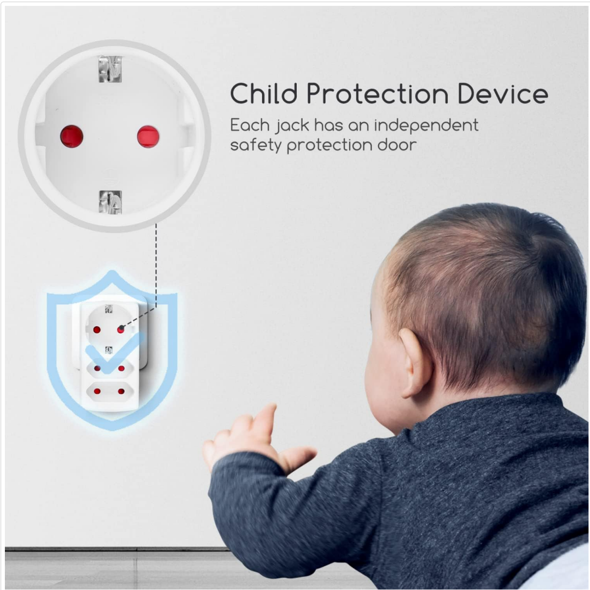
Figure 2.1: The Aigostar adapter features an integrated child protection device, indicated by the safety doors within each socket, designed to prevent accidental contact with live parts.