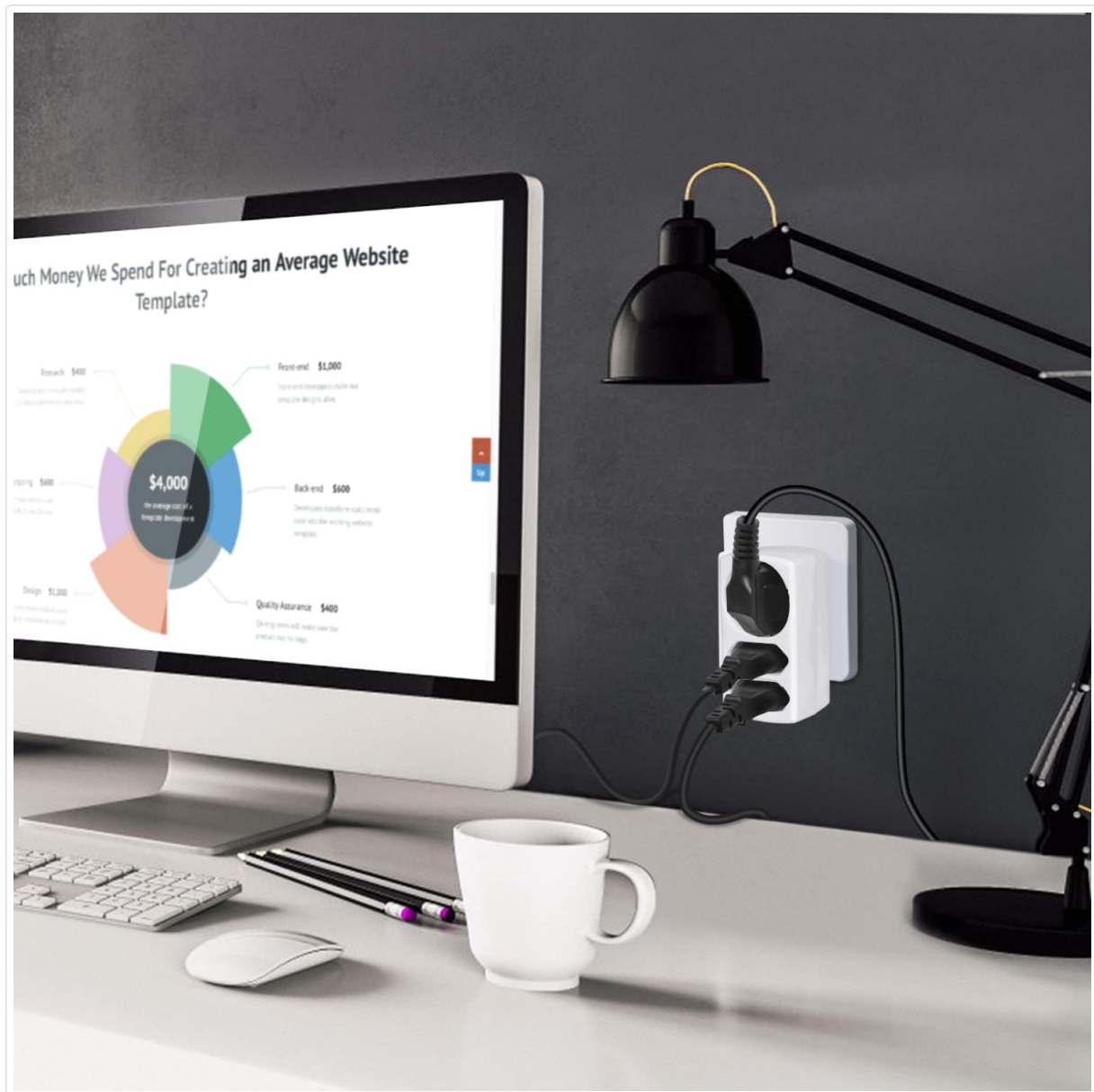
Figure 5.2: The adapter providing power to a computer monitor and a desk lamp, illustrating its utility in a workspace.