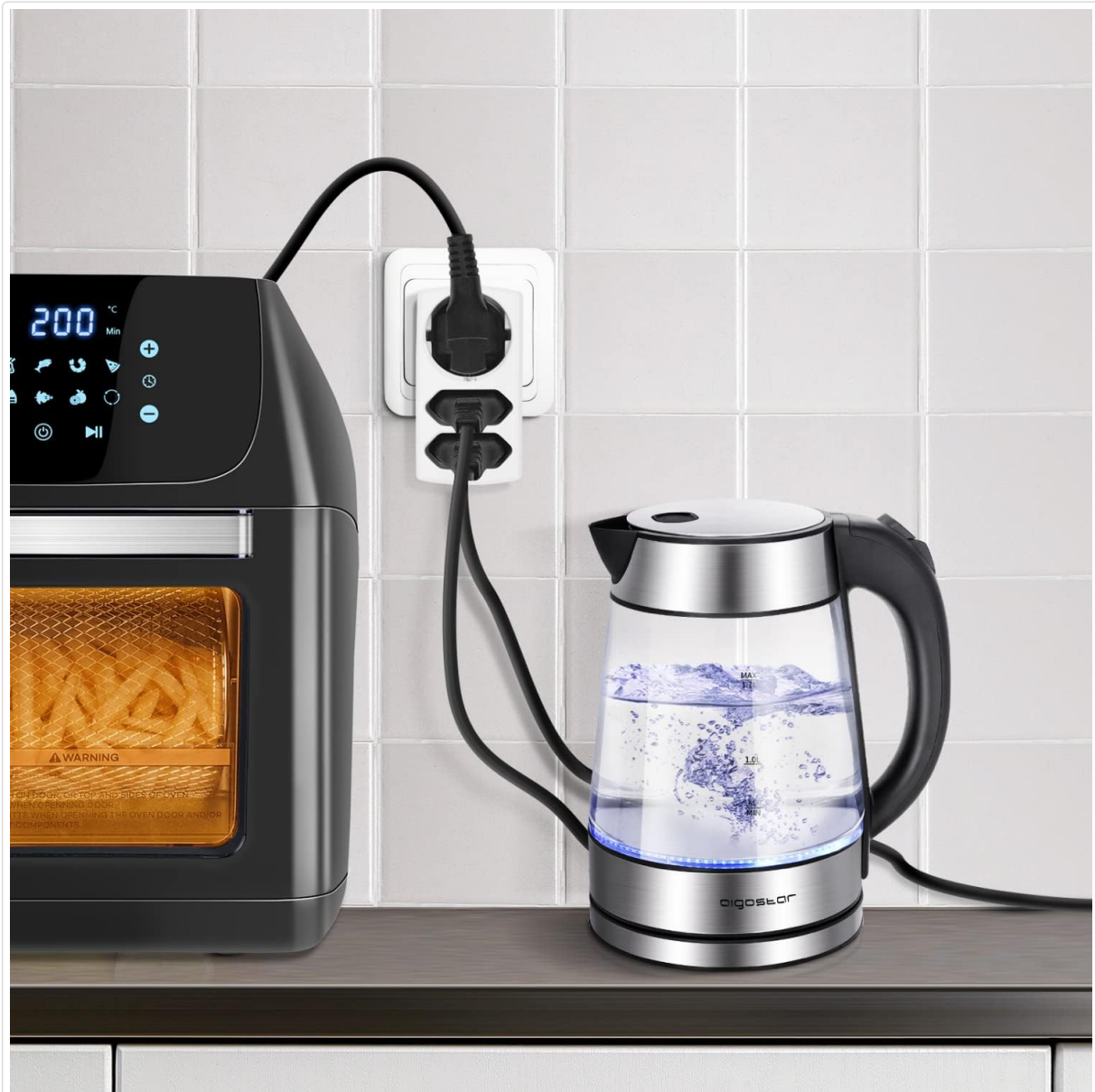
Figure 4.1: The Aigostar adapter securely plugged into a wall outlet, ready for use.

Note: The adapter's design allows it to be used in a double wall socket without obstructing the second outlet, thanks to its offset plug.