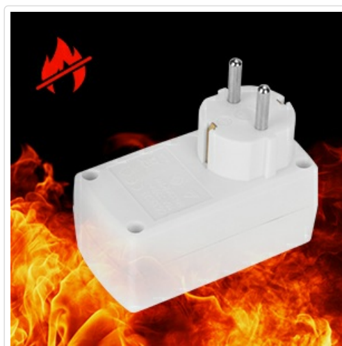
Figure 2.2: The adapter is constructed from durable, heat-resistant materials to enhance safety and prevent fire hazards.