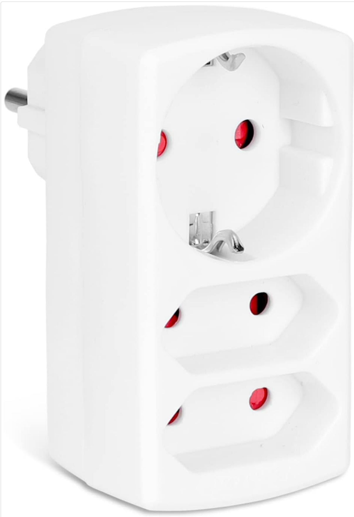
Figure 3.1: Front view of the Aigostar HU-XI-152 adapter, highlighting its one Schuko and two Euro sockets.