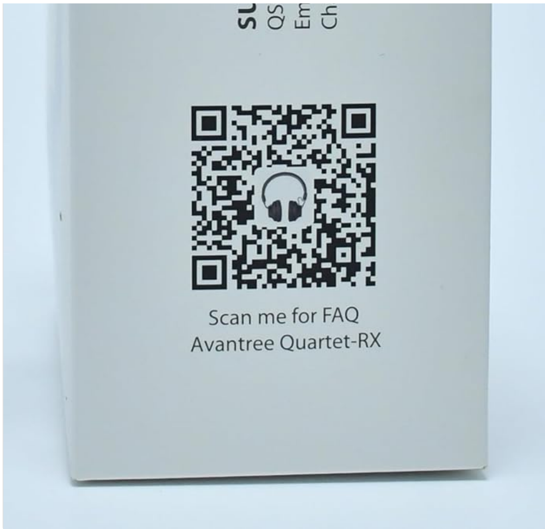
The side of the product packaging displaying the Avantree support website address and a QR code for quick access to FAQs and tutorials.