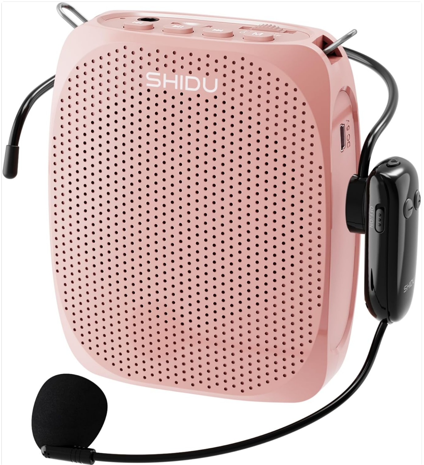
Image: Front view of the SHIDU Voice Amplifier (rose gold) with the wireless microphone headset. The amplifier features a large speaker grille and control buttons on top.