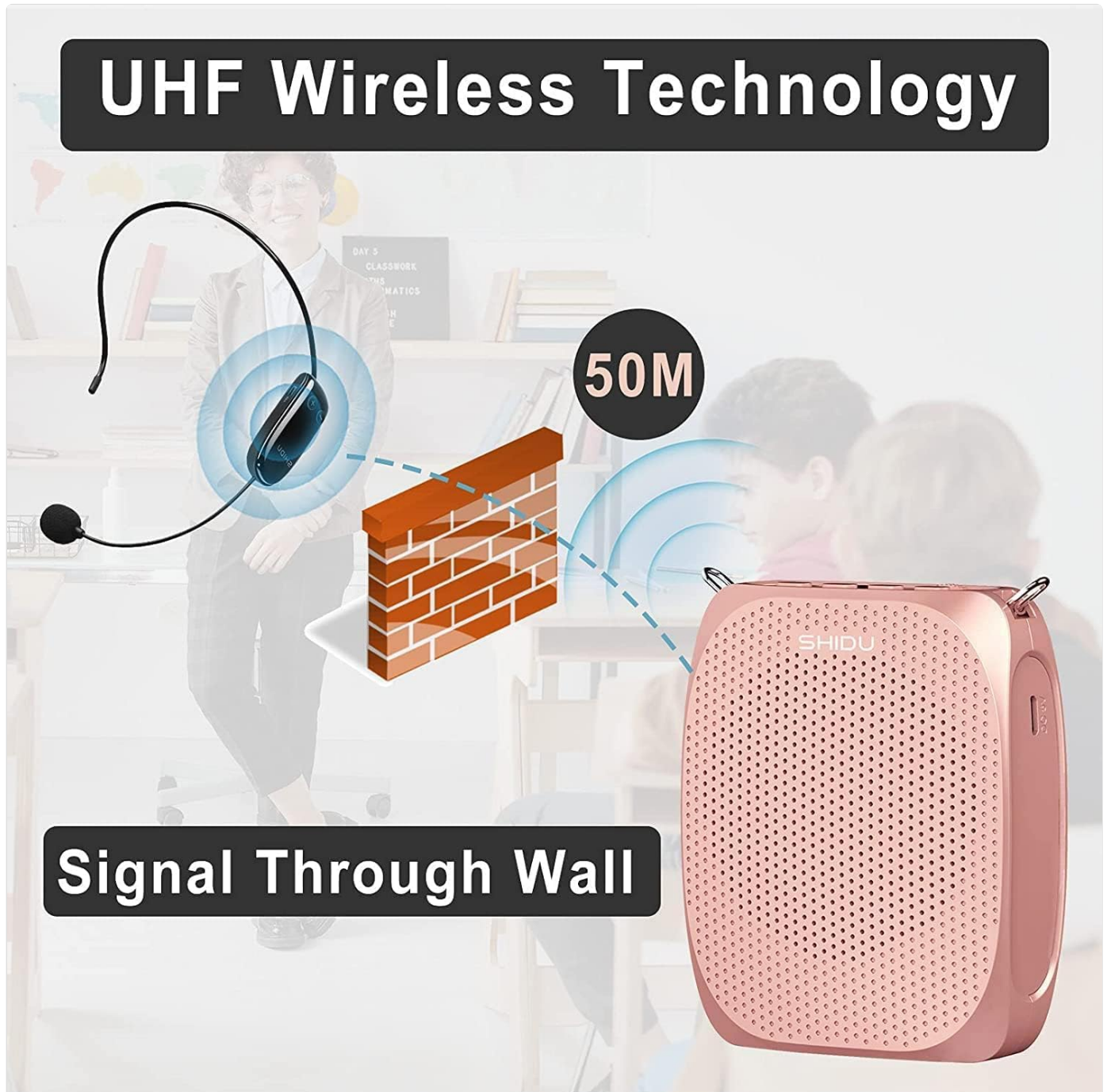
Image: This diagram demonstrates the UHF wireless technology, showing the microphone headset transmitting a signal up to 50 meters, even through walls, to the amplifier.