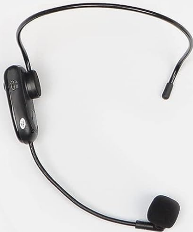
501.0-540.0MHZ Wireless microphone*1