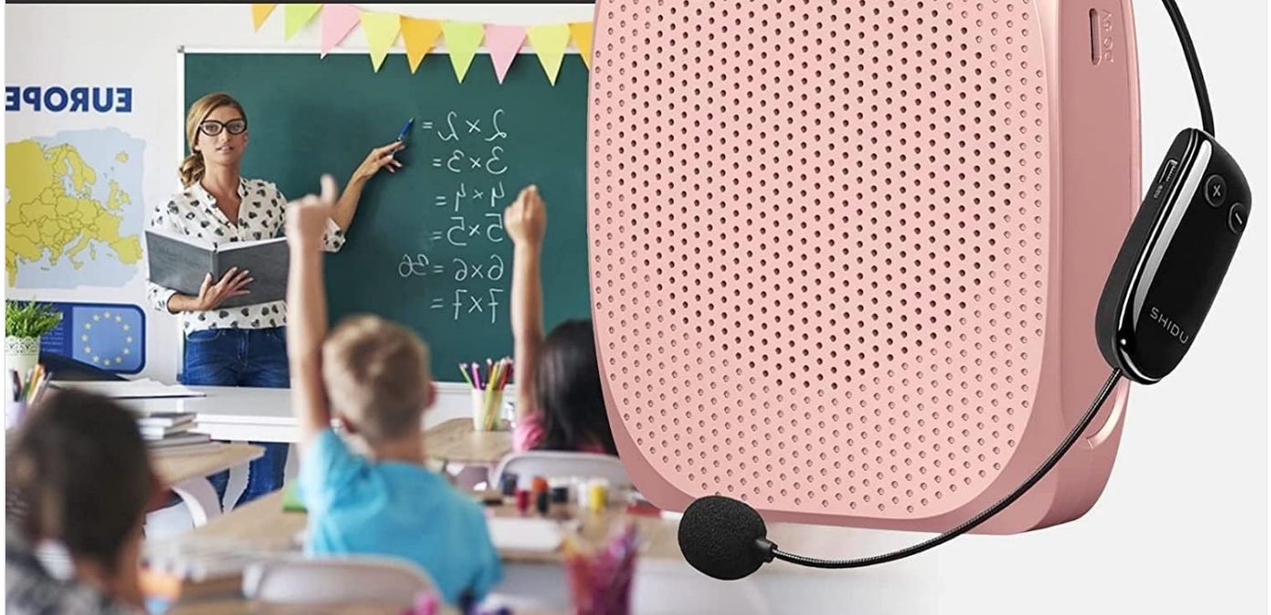
Image: Side view of the SHIDU Voice Amplifier, highlighting the power button and DC 5V charging port.