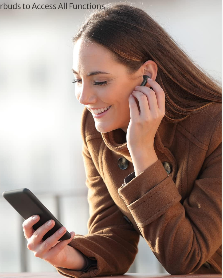
Image: A user demonstrating the touch controls on the Senso Orbits earbuds, with a visual guide to different tap functions.