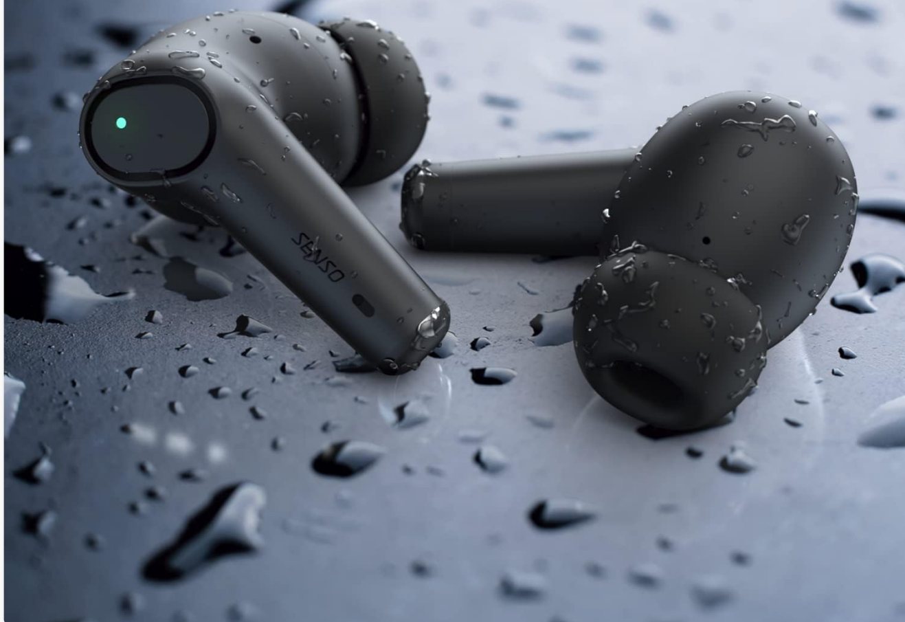
Image: Senso Orbits earbuds shown with water droplets, illustrating their IPX rating for protection against water and sweat.