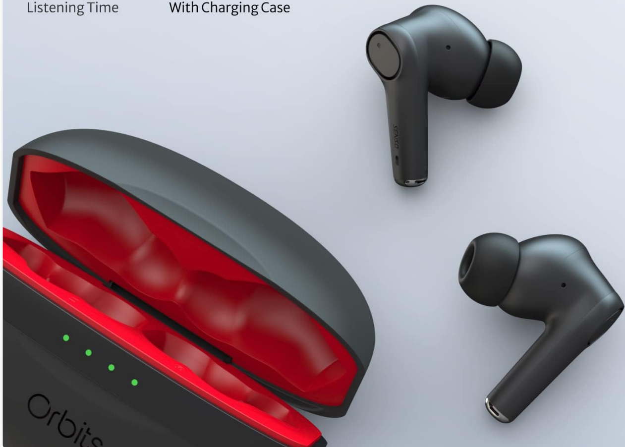
Image: Senso Orbits earbuds and their charging case, illustrating the long battery life and USB-C charging capability.