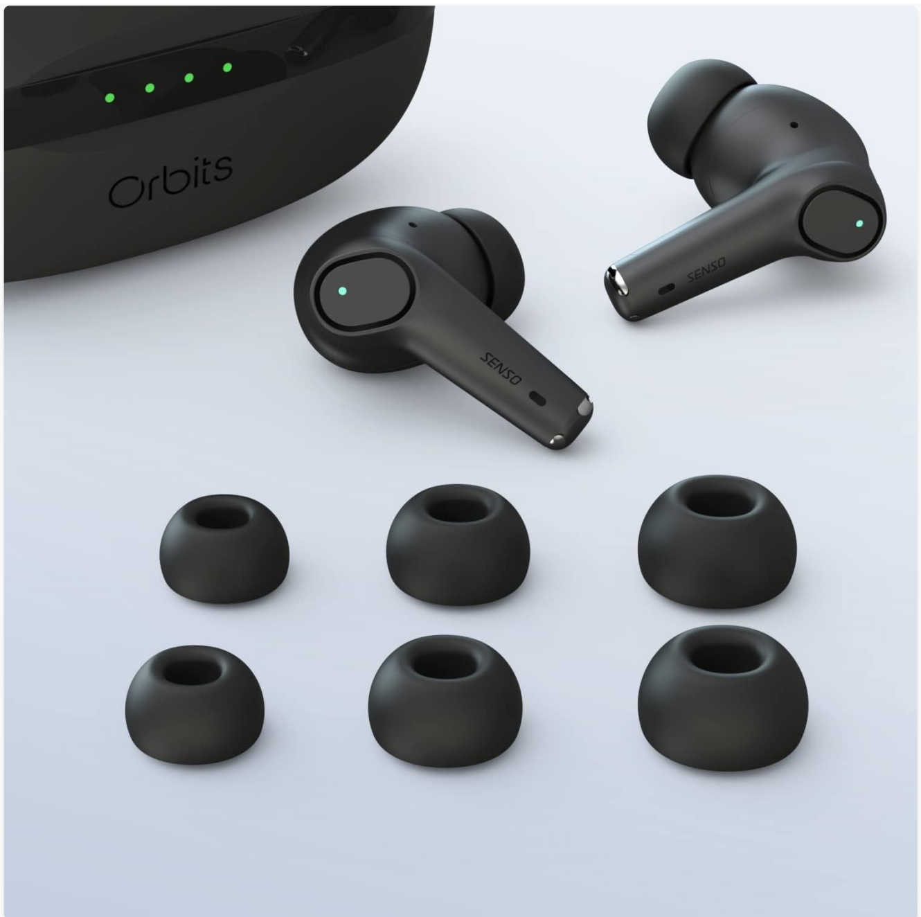
Image: Senso Orbits Earbuds with multiple ear tip sizes for a comfortable fit.