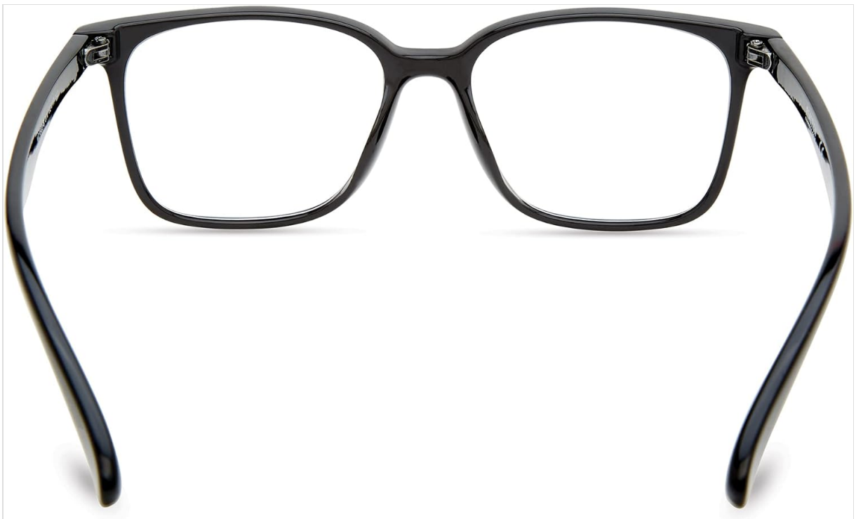
Figure 3: Back view of the eyewear frames, showing the overall structure and temple design.