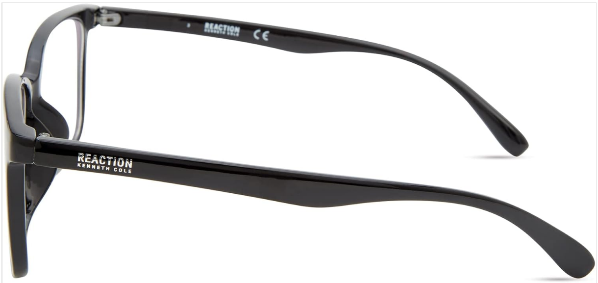
Figure 2: Side view of the eyewear frames, highlighting the shiny solid black temples and lightweight construction.