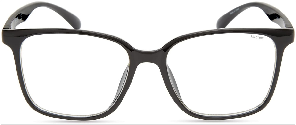
Figure 1: Front view of the eyewear frames, showcasing the square plastic design and clear blue light filtering lenses.