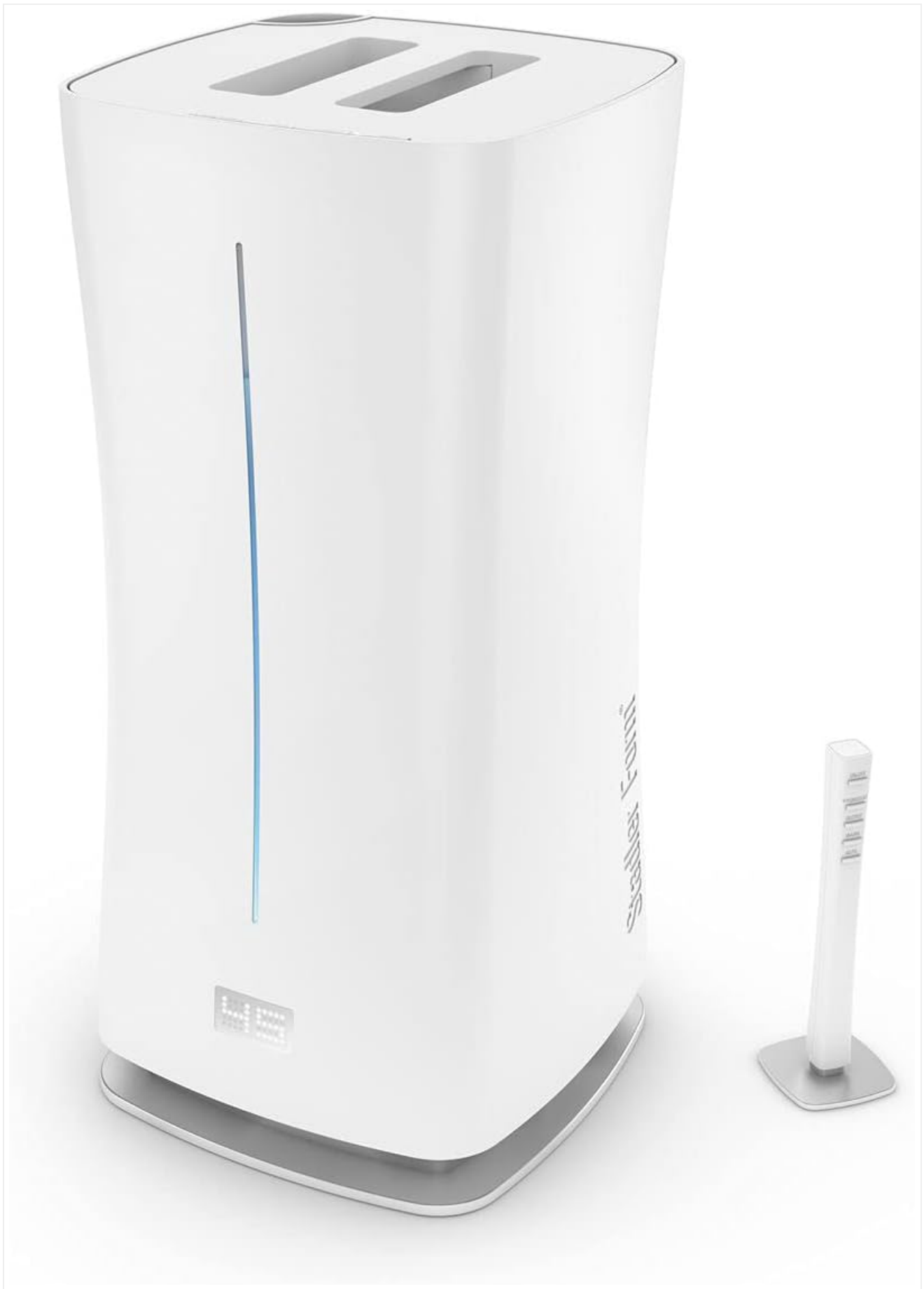
The Stadler Form Eva humidifier, shown here with its external humidity sensor.