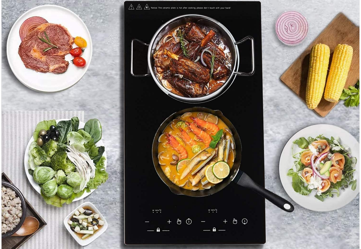
Figure 7: The cooktop in use, demonstrating its compatibility with various magnetic cookware sizes (6-11 inches) and highlighting features like 9 power levels, temperature control, timer, and overheating protection.