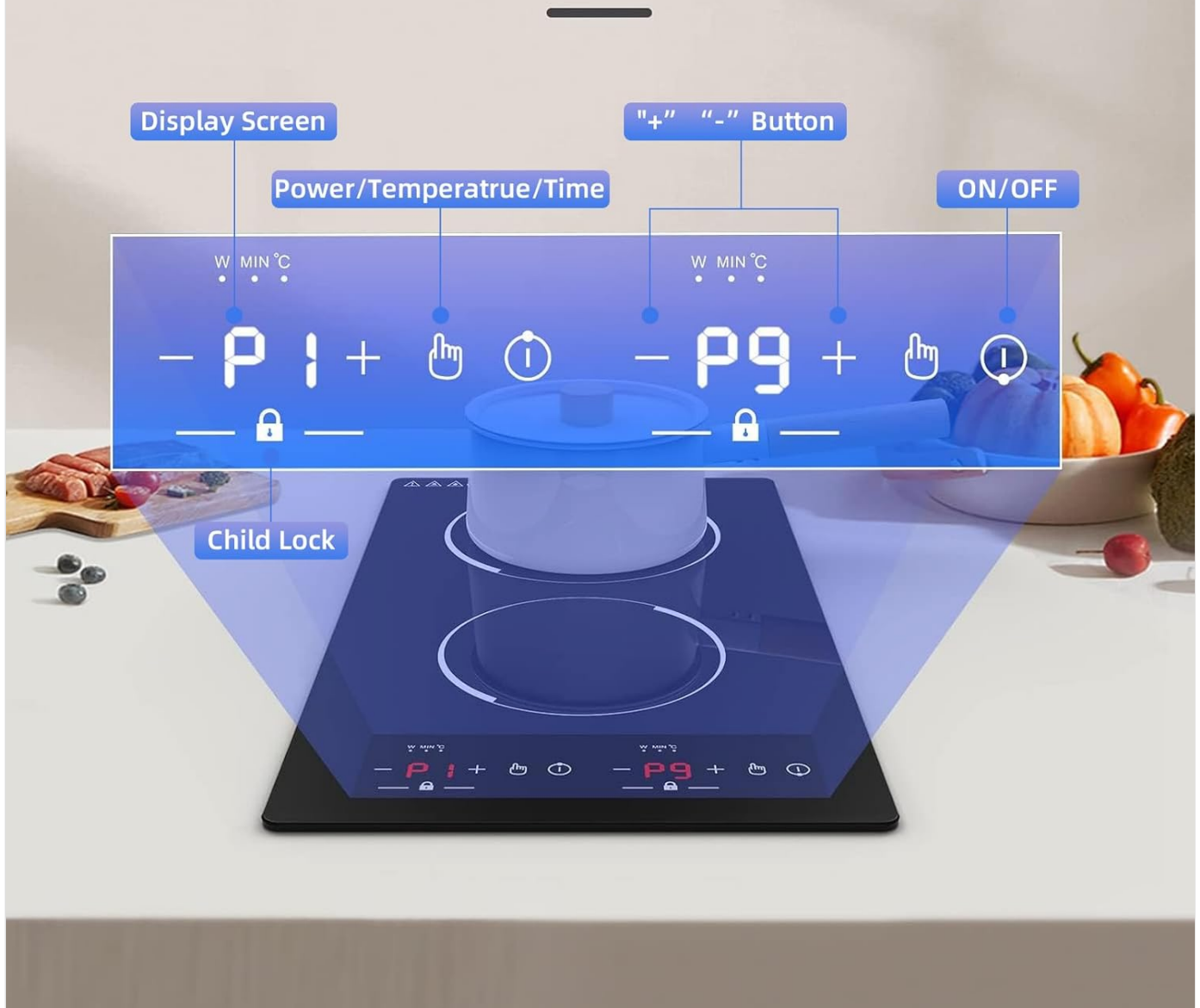
Figure 2: Detailed view of the LED touch screen control panel, highlighting the display screen, power/temperature/time controls, plus/minus buttons, and the ON/OFF switch, along with the child lock indicator.