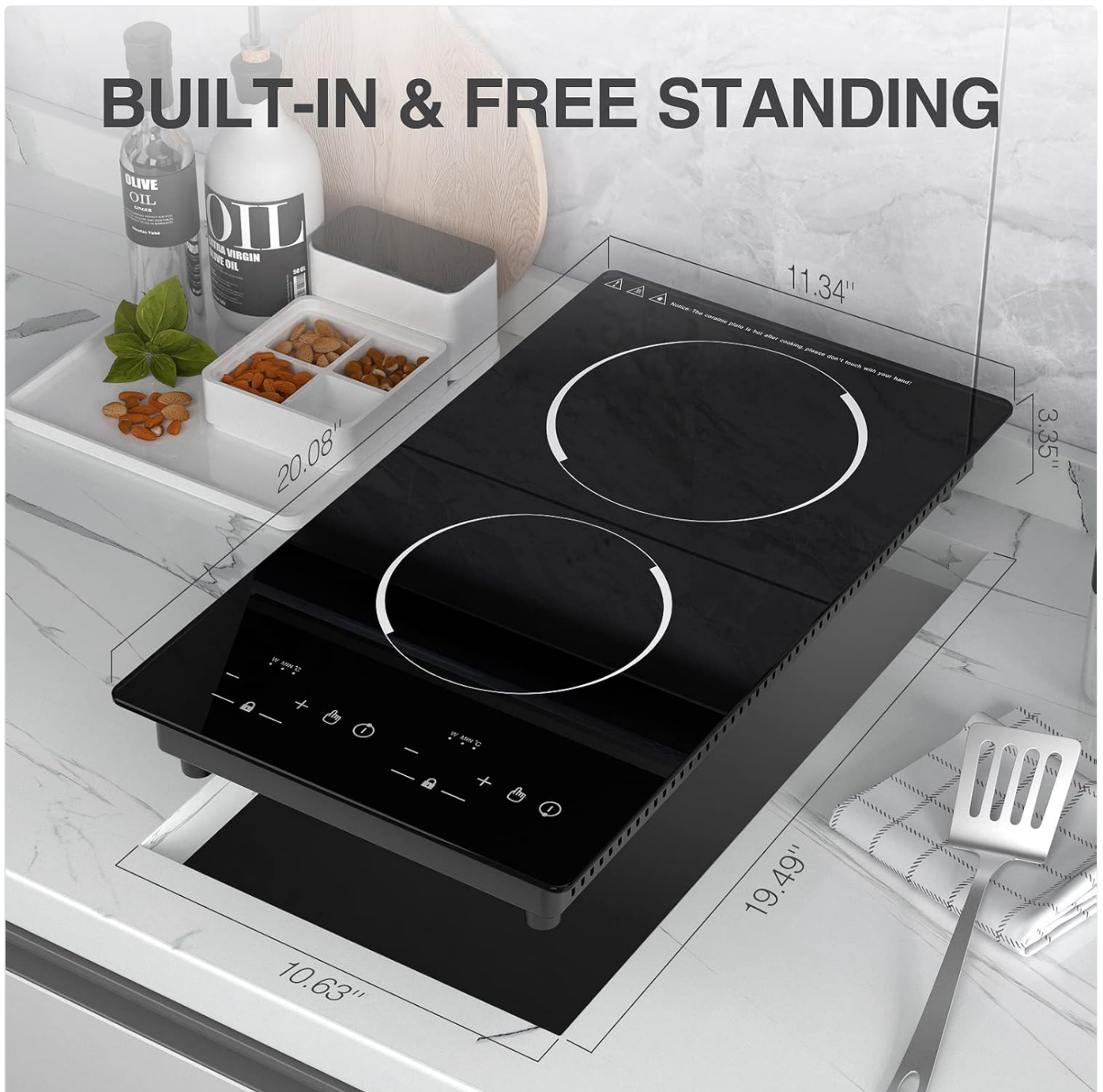
Figure 5: Technical drawing indicating the dimensions of the cooktop (20.08" x 11.34" x 3.35") and the recommended cutout size (19.49" x 10.63") for built-in applications.