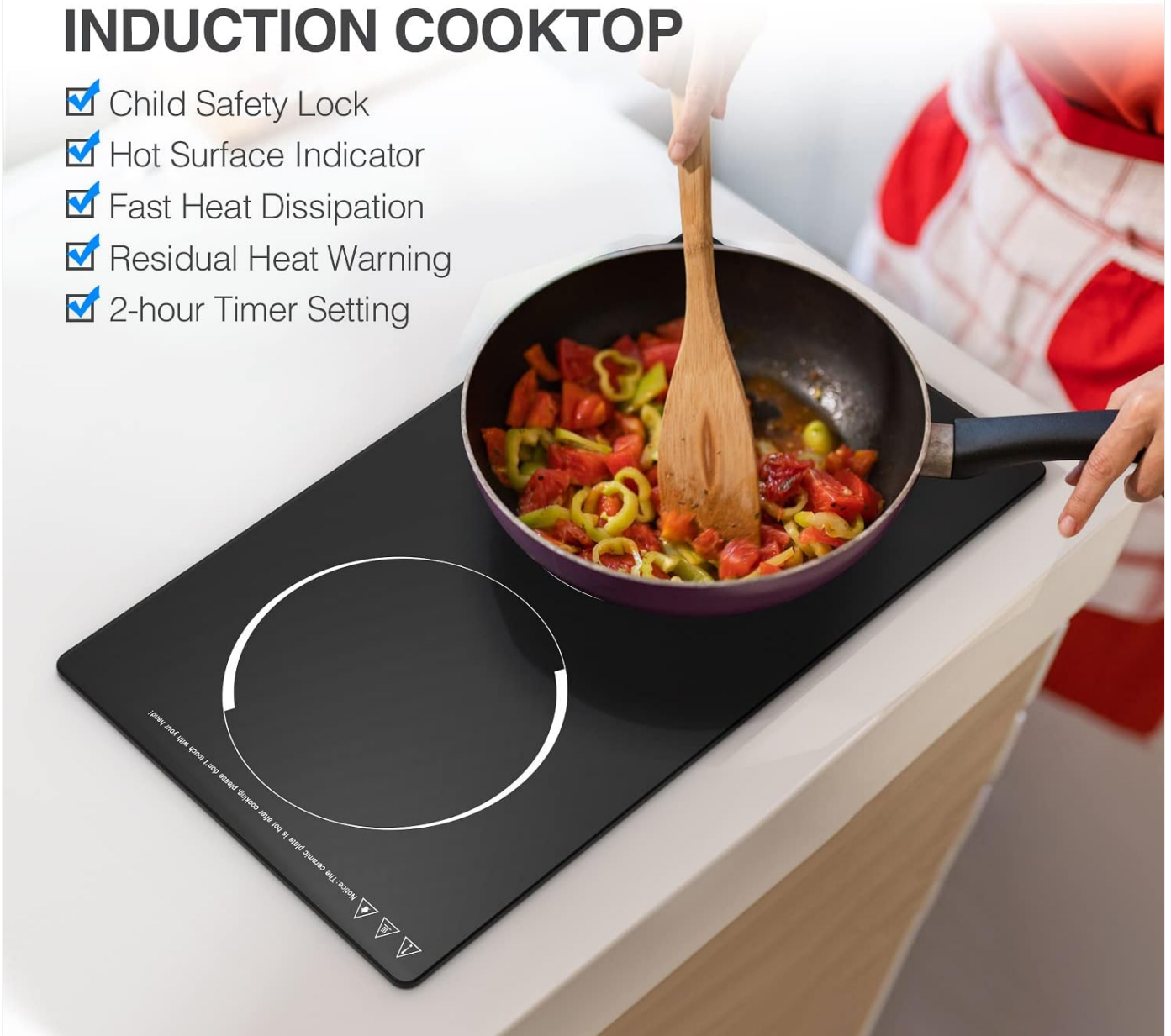
Figure 3: Overview of key safety and convenience features including Child Safety Lock, Hot Surface Indicator, Fast Heat Dissipation, Residual Heat Warning, and 2-hour Timer Setting.