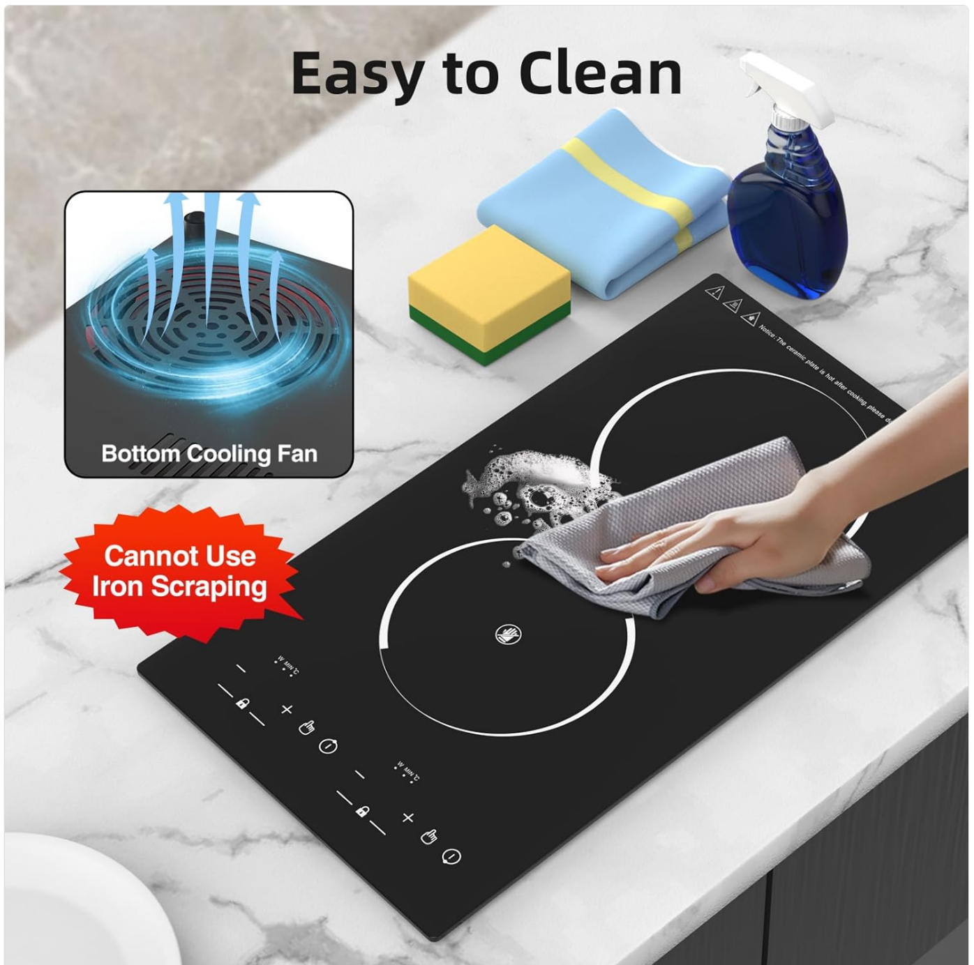
Figure 8: A hand wiping the cooktop surface with a cloth, demonstrating the ease of cleaning. The image also shows a warning against using iron scraping tools and highlights the bottom cooling fan.