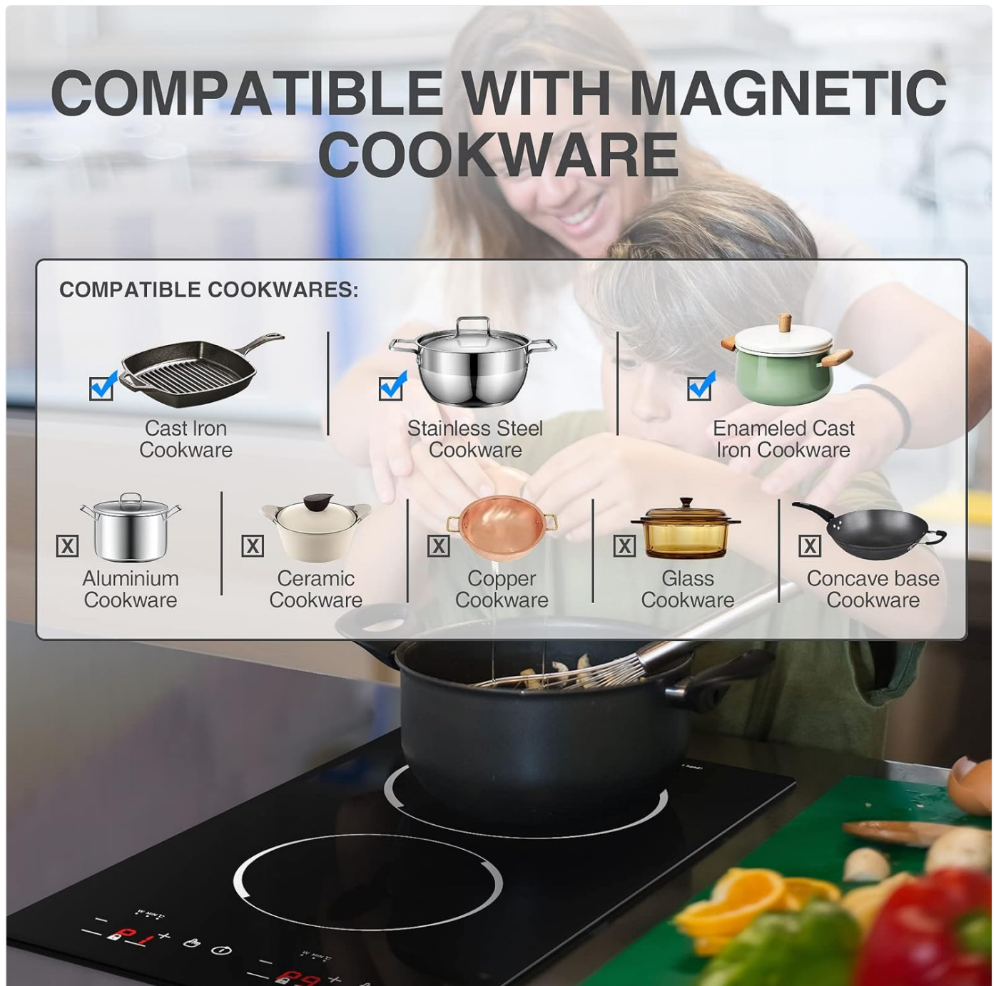
Figure 6: Visual guide to compatible cookware (cast iron, stainless steel, enameled cast iron) and incompatible types (aluminum, ceramic, copper, glass, concave base).

Cookware should have a bottom diameter between 6 and 11 inches for optimal performance. The cooktop will automatically turn off if no compatible cookware is detected within 30 seconds.