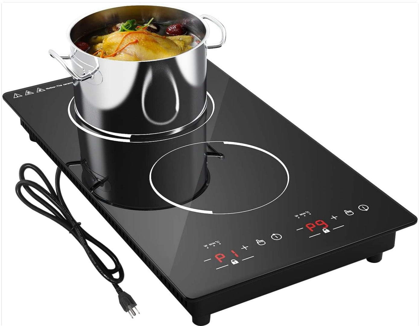
Figure 1: The GTKZW 12-inch Double Induction Cooktop, showcasing its sleek black surface and two cooking zones, with a pot actively heating on one of the burners.