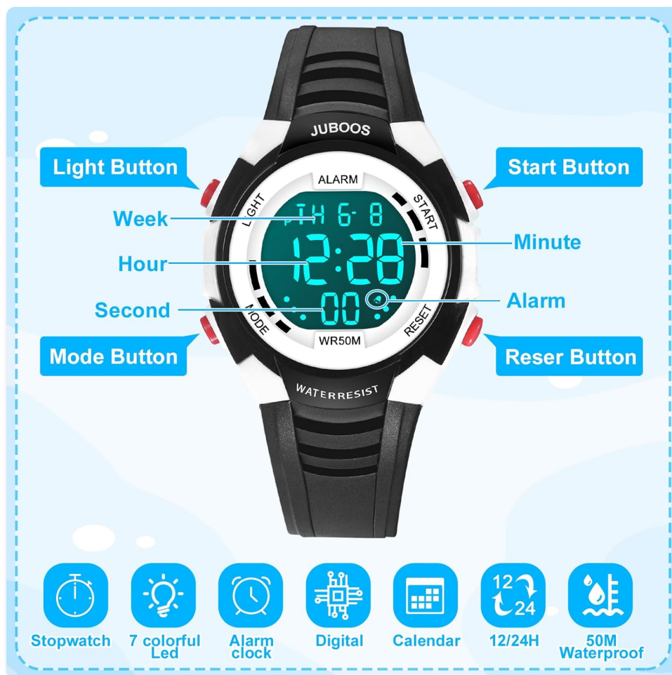
Watch button and display element diagram