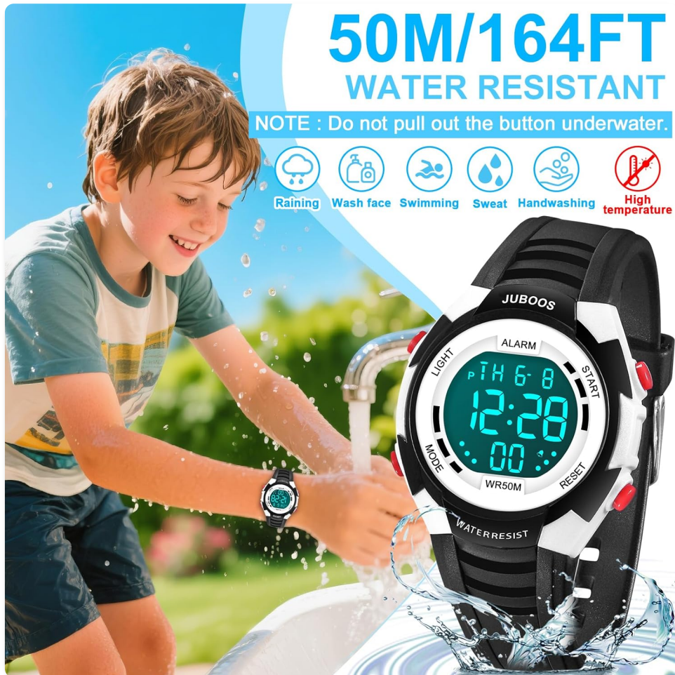
Image: Watch in use during hand washing, demonstrating water resistance

The Juboos Kids Digital Watch is rated 5 ATM (50 meters / 164 feet) water resistant. This means it is suitable for daily use, hand washing, showering, and swimming in shallow water.