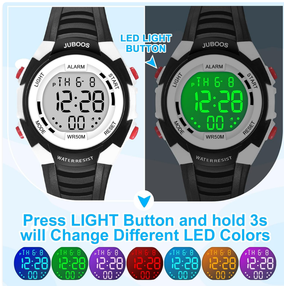
Image: LED backlight color options

The watch features a 7-color LED backlight.